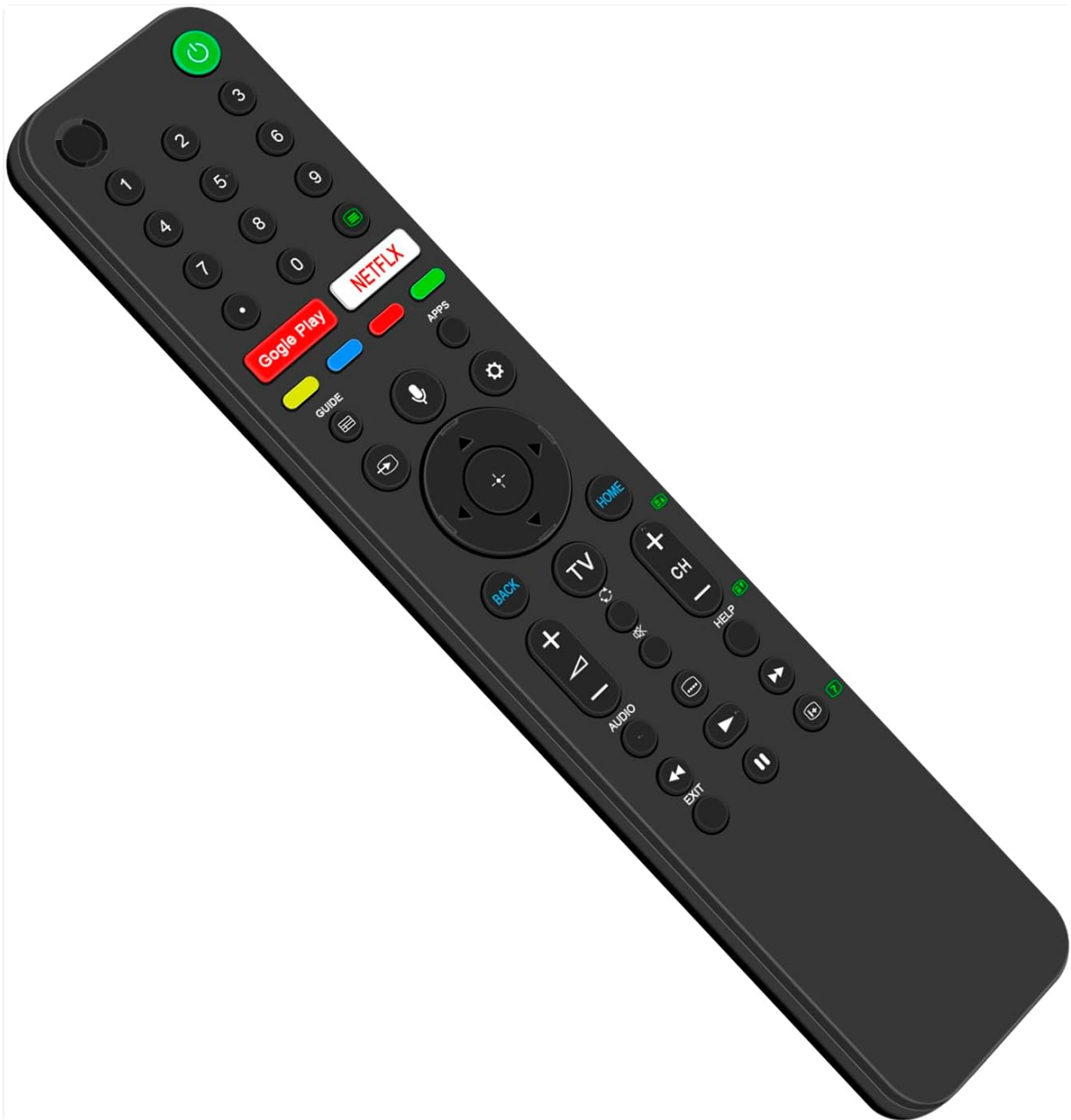
Figure 3: Angled view of the ALLIMITY RMF-TX500P remote control, highlighting the layout of all buttons. This image helps users identify specific function buttons.