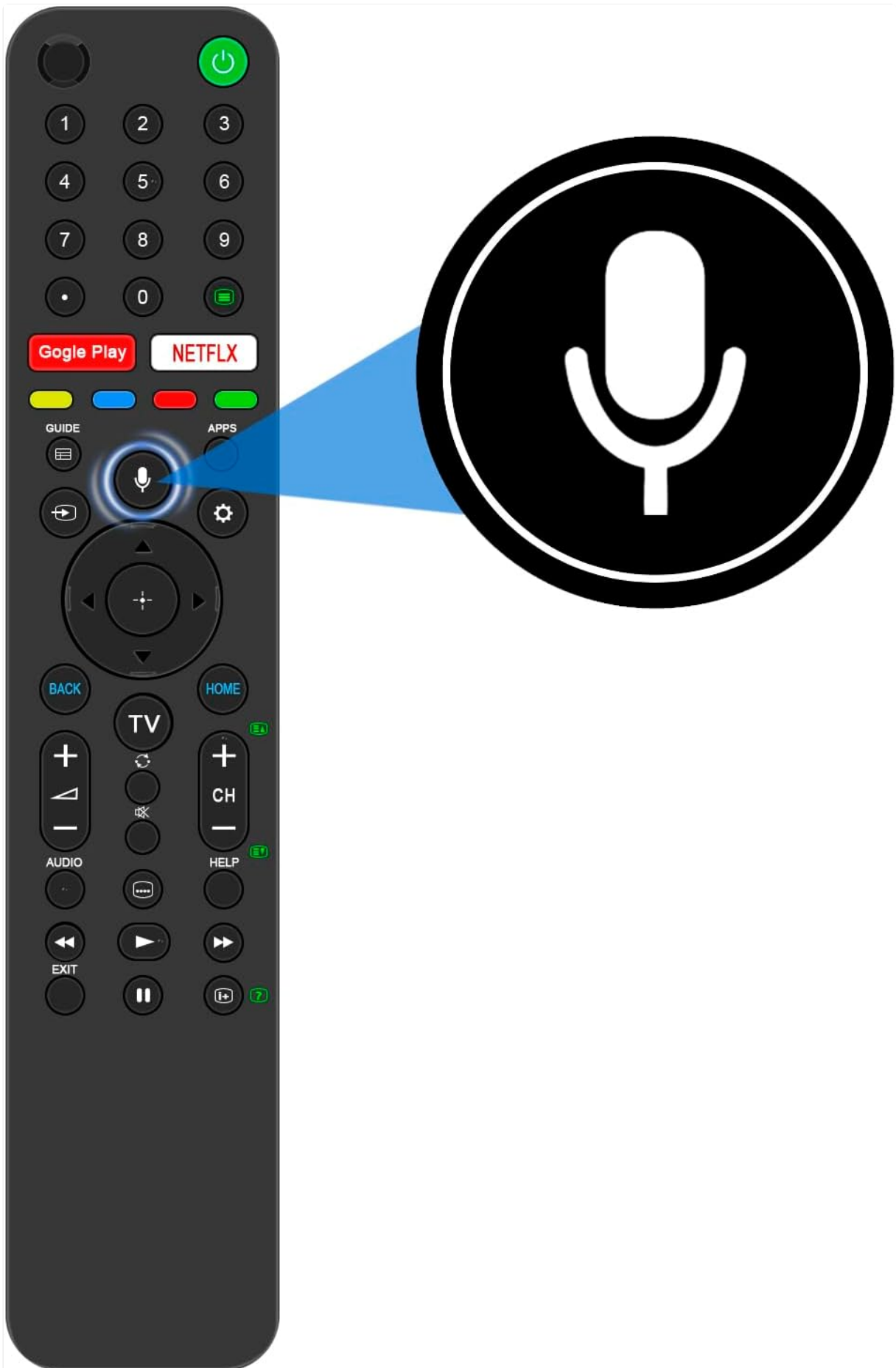
Figure 4: The ALLIMITY RMF-TX500P remote control with the microphone button highlighted. This image indicates the location of the voice control activation button.