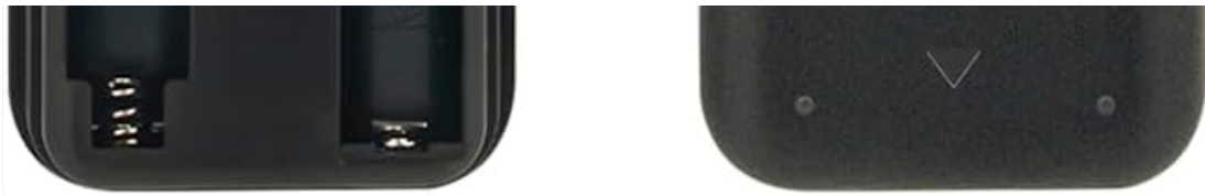
Figure 2: Back view of the ALLIMITY RMF-TX500P remote control with the battery compartment open. This image illustrates where to insert the AAA batteries.