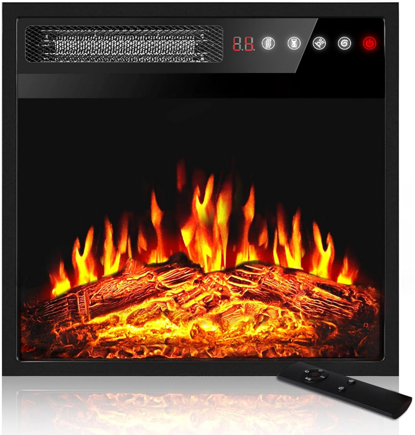
Image: The electric fireplace insert displaying its realistic LED flame effect and glowing log bed, creating a warm and inviting atmosphere.