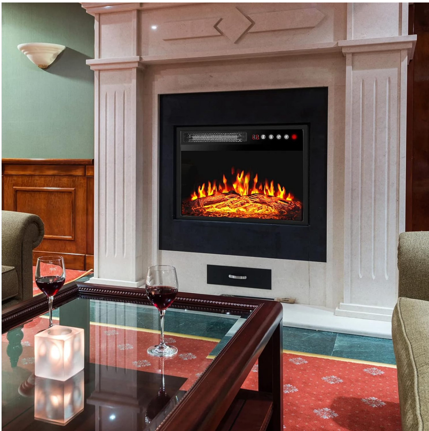
Image: The 18-inch electric fireplace insert seamlessly installed into a fireplace mantel in a living room setting, demonstrating a typical installation scenario.