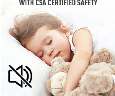
Image: A graphic indicating CSA and UL certifications, emphasizing safety. This image illustrates the product's adherence to safety standards, including thermal cut-off protection.