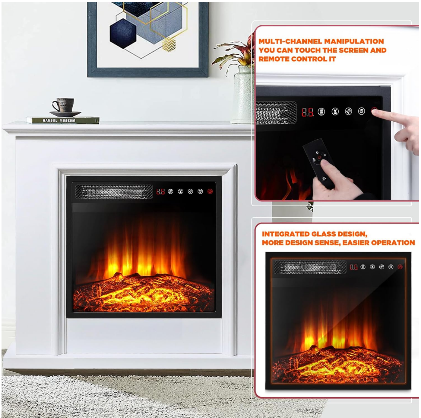
Image: Close-up view of the fireplace's touch screen control panel and the accompanying remote control, highlighting the various buttons and display for operation.