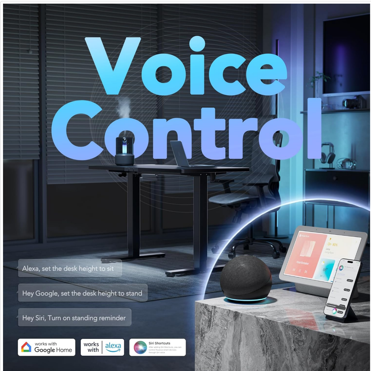
Image: Devices demonstrating voice control integration with the standing desk.