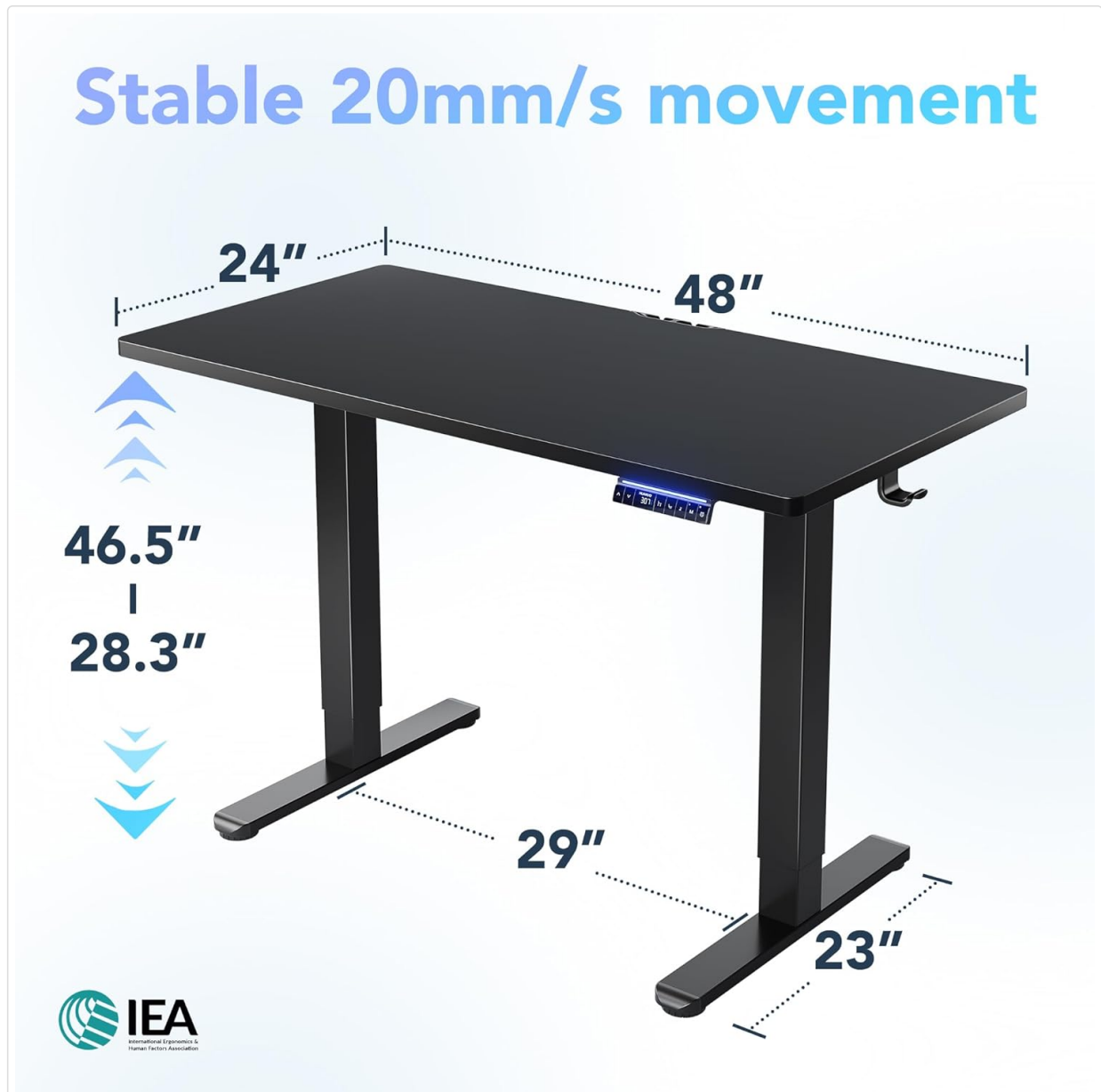
Image: Visual representation of the desk's adjustable height range and dimensions.

Use the up (▲) and down (▼) arrows on the control panel to manually adjust the desk height. The desk can be adjusted from 72 cm (28.3 inches) to 118 cm (46.5 inches).