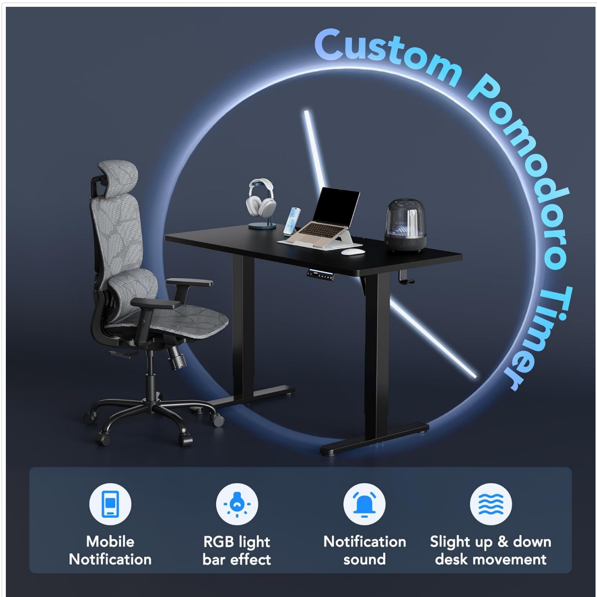
Image: Illustration of the Pomodoro timer and sedentary reminder features.