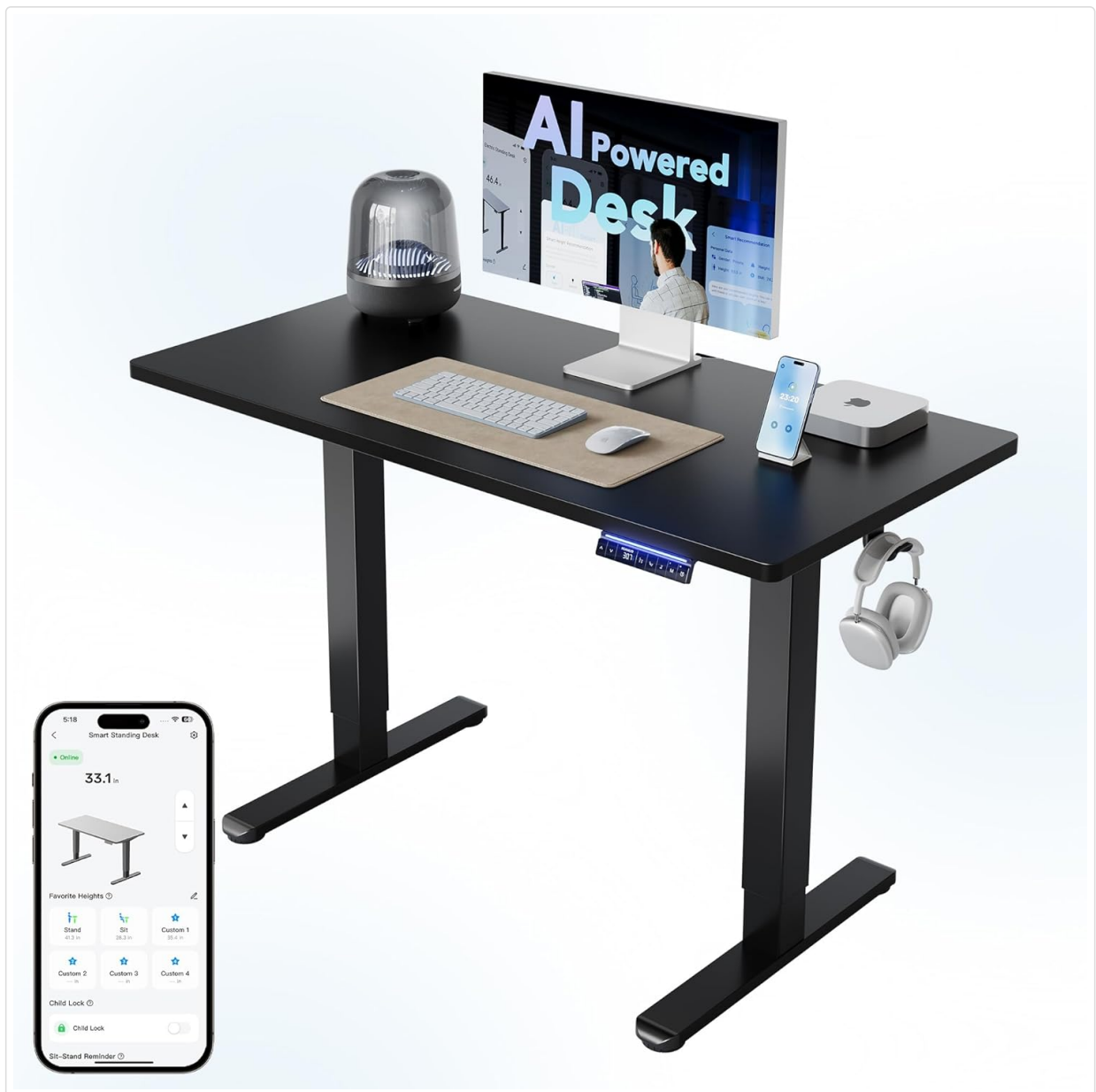
Image: All components of the HUANUO AI-Powered Electric Standing Desk, including the desktop, frame, control panel, and accessories.