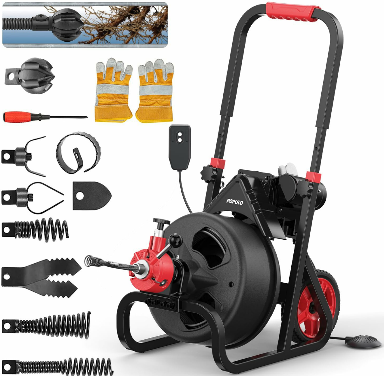
Figure 1: POPULO PEDC-100P Electric Drain Cleaner Machine with its main components visible.