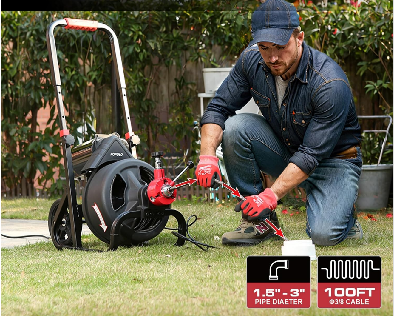
Figure 3: The advanced auto-feed system in action, demonstrating how it boosts efficiency and safety during operation.