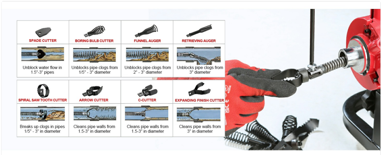
Figure 4: An assortment of the 8 specialized cutter heads included with the drain cleaner machine, each designed for specific types of blockages.