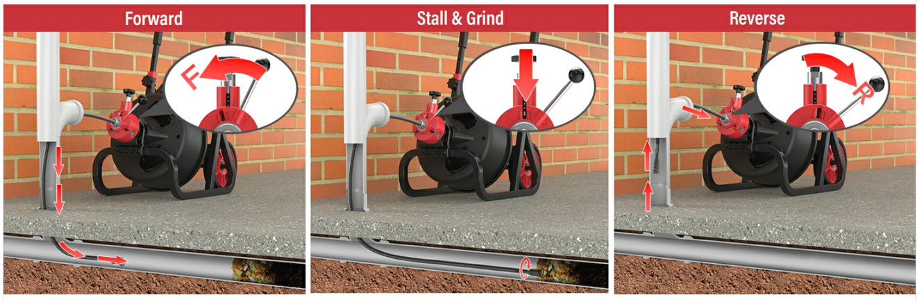
Figure 6: Diagram illustrating the automatic advancing and retracting mechanism, showing forward, stall & grind, and reverse operations.

Your browser does not support the video tag.