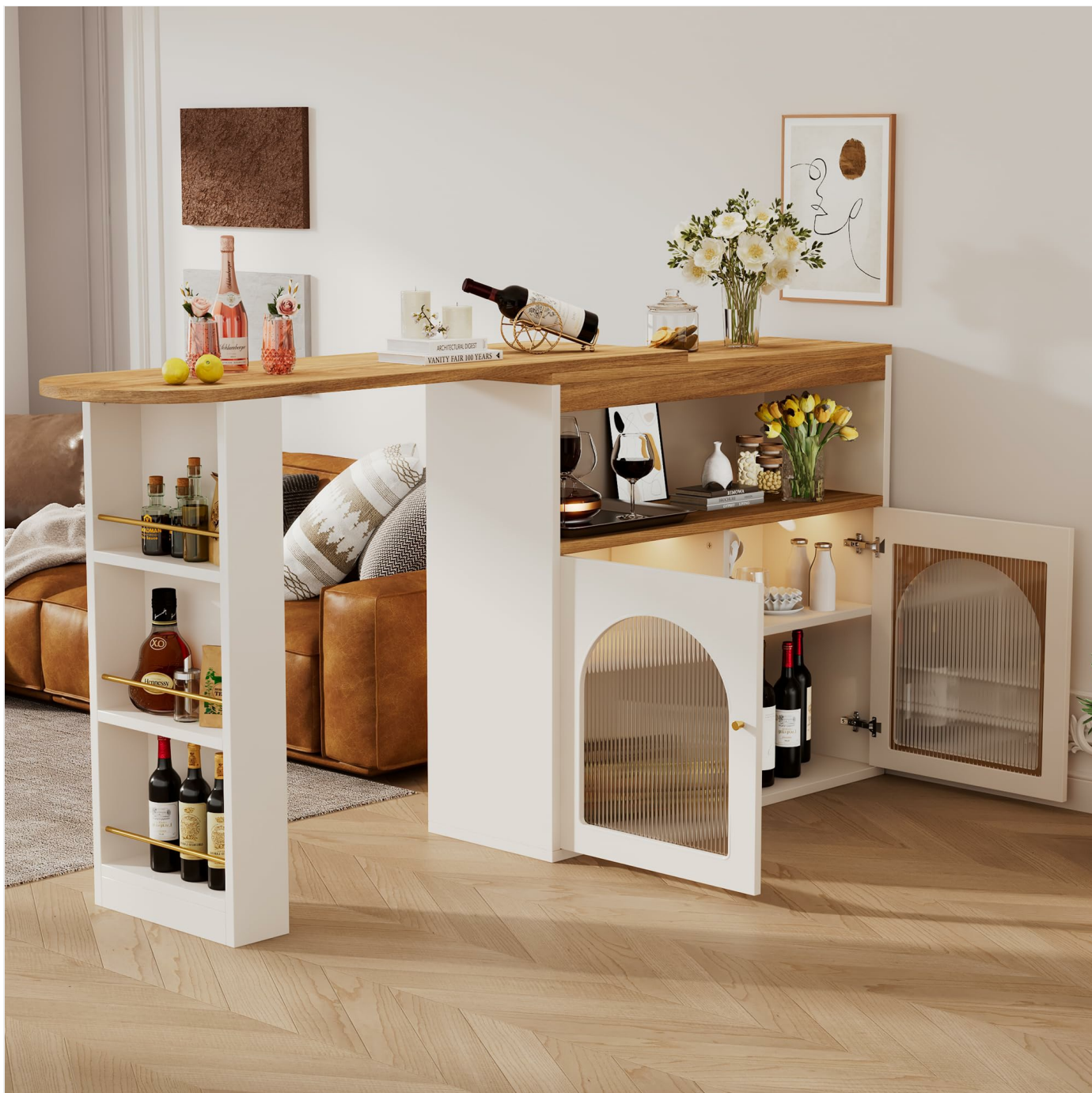
Image: The Merax 360° Swivelling 3 Tier Dining Bar Table, showcasing its L-shape configuration with storage and an extendable countertop.