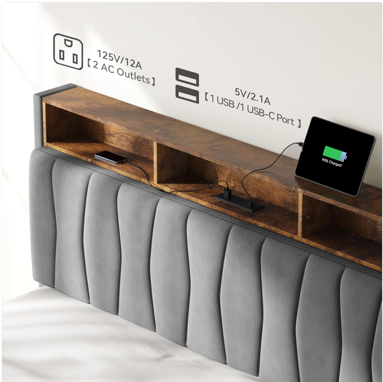
Figure 7: Charging Station. This close-up view of the headboard illustrates the integrated charging station, featuring two AC outlets and two USB ports (USB-A and USB-C) for convenient device charging.