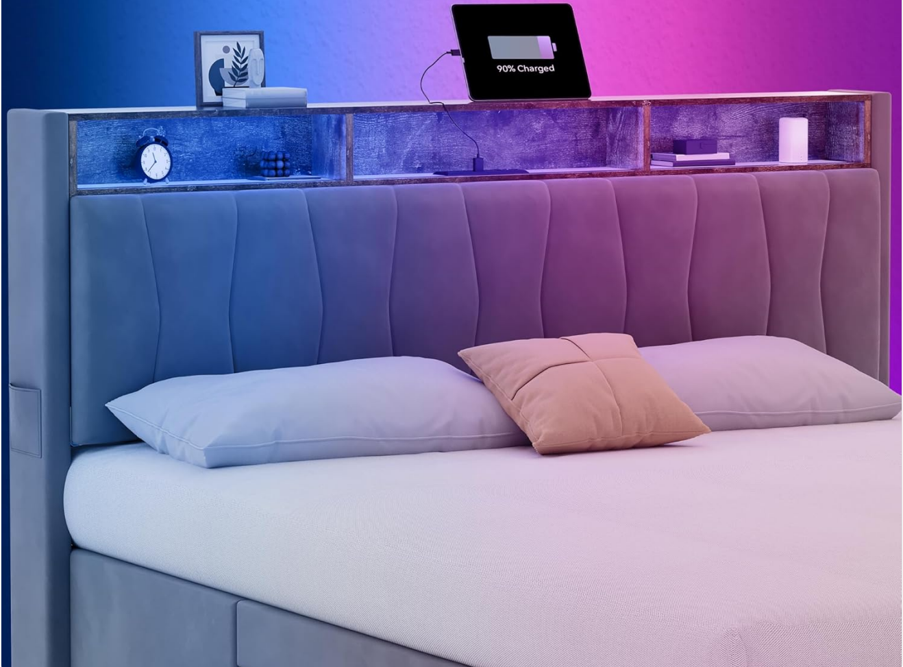
Figure 8: Customizable LED Lighting. This image showcases the headboard's integrated LED lights, demonstrating their ability to display various colors and create different moods, controllable via app or remote.