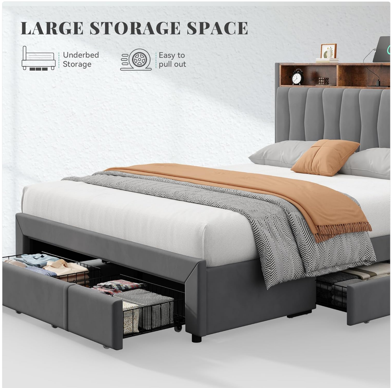
Figure 6: Under-Bed Storage. This image demonstrates the spacious under-bed drawers, ideal for storing clothes, quilts, and other items, highlighting their easy pull-out functionality.

The bed frame includes three large drawers located under the bed. These drawers are equipped with rolling wheels for smooth operation. Simply pull them out to access stored items and push them back in when not in use.