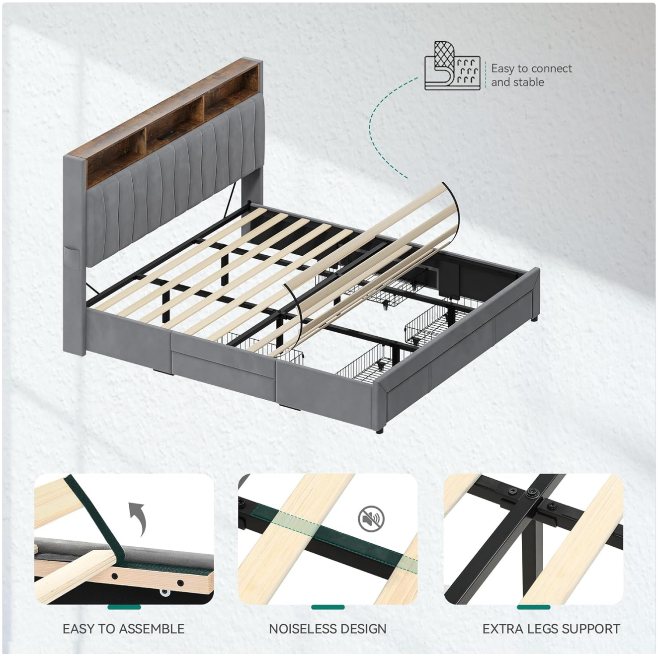
Figure 3: Assembly Features. This image details the easy assembly method for the wooden slats, the noiseless design with sound-dampening strips, and the robust extra leg support for the bed frame.