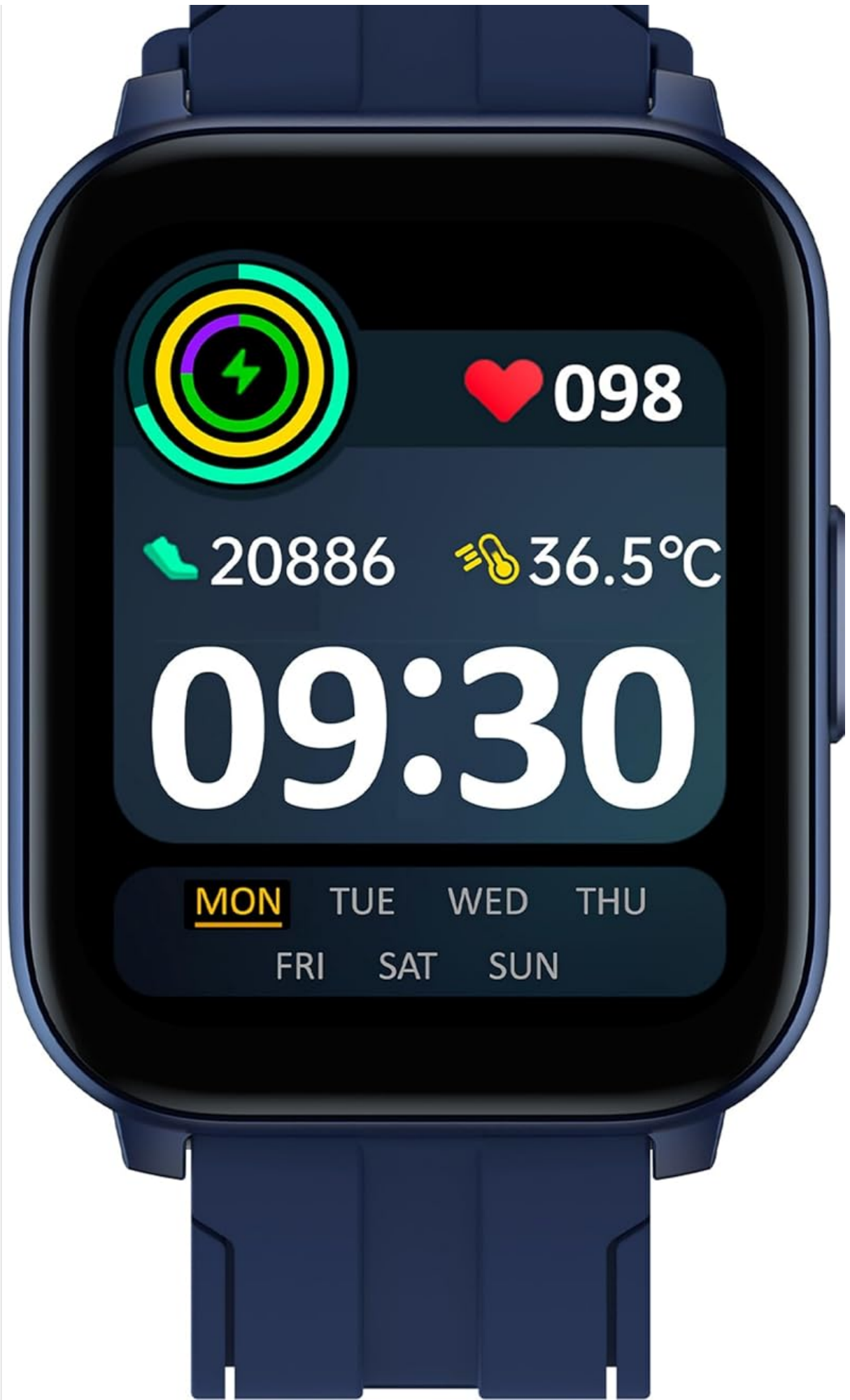
Image: Front view of the realme TechLife Watch SZ100 displaying the main watch face with time, activity data, heart rate, and temperature readings.