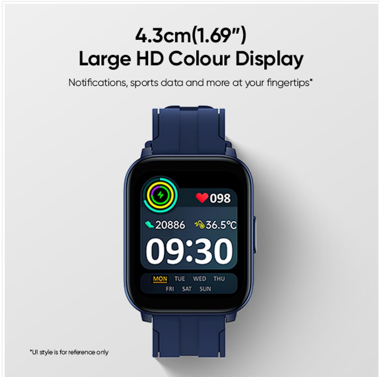
Image: An infographic illustrating the realme TechLife Watch SZ100's health ecosystem, including blood oxygen, heart rate, skin temperature, 24 sports modes, and sleep monitoring.