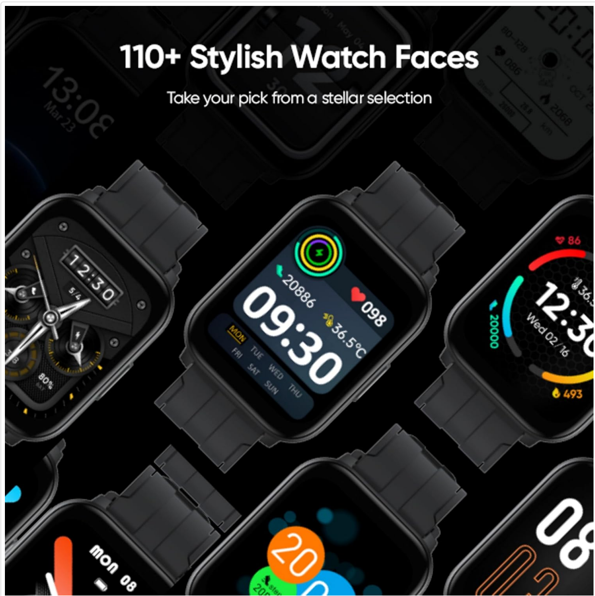
Image: A collage showcasing a diverse selection of watch faces, demonstrating the customization options for the realme TechLife Watch SZ100.