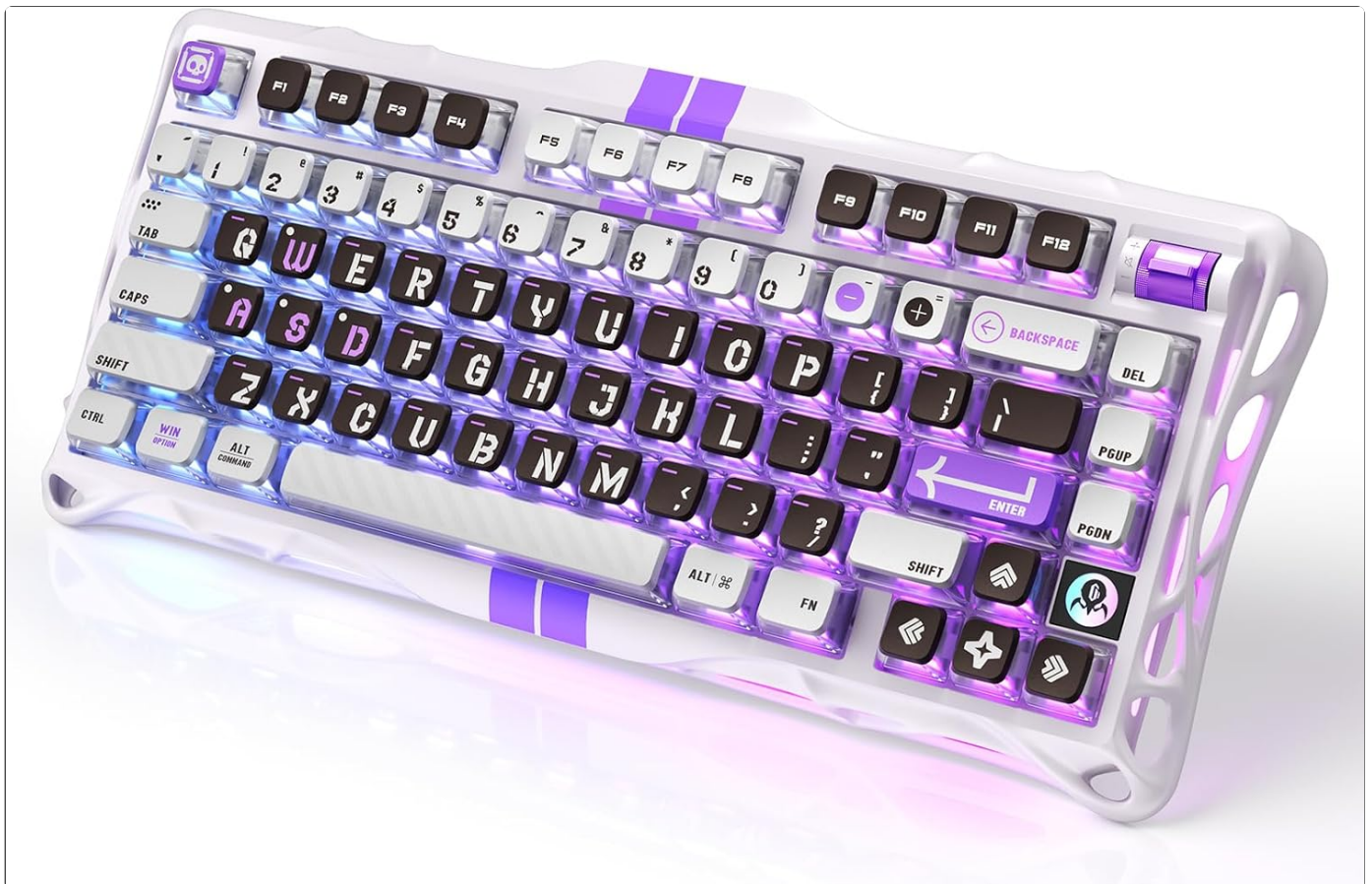
Image: The GravaStar Mercury V75 HE Keyboard, showcasing its unique design and vibrant RGB backlighting.

The GravaStar Mercury V75 HE Keyboard is a high-performance 75% layout gaming keyboard featuring Hall-Effect magnetic switches. Designed for precision and speed, it offers advanced customization options, ultra-low latency, and durable construction for an optimized gaming and typing experience.