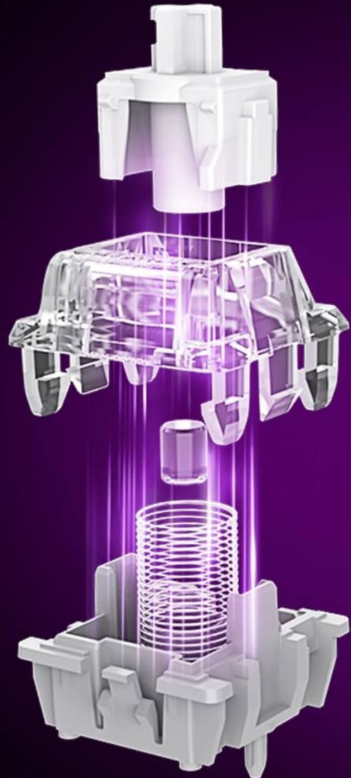
Image: Detailed view of the Hall Effect magnetic switches, highlighting their sensitivity, actuation range, and lifespan.