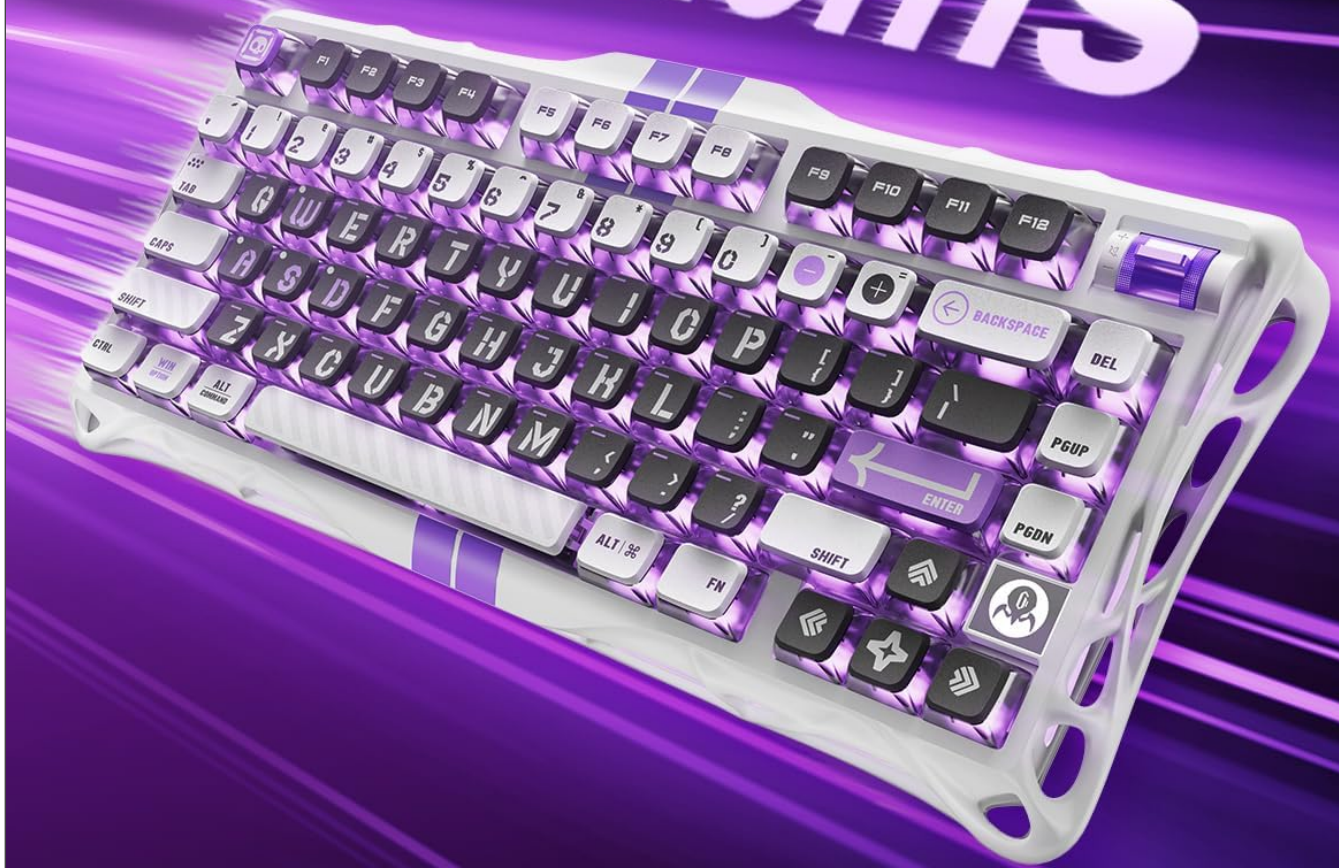
Image: The keyboard emphasizing its 8KHz polling rate for rapid response times.