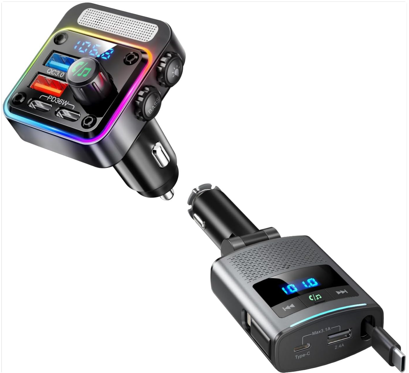
Image: The Nulaxy NX16 Bluetooth Car Adapter (top) and the Nulaxy KM26 Retractable Car Charger (bottom), showcasing their design and features.