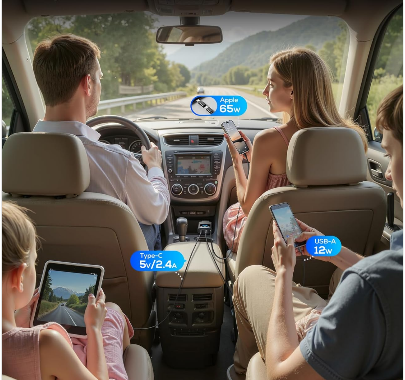
Image: The Nulaxy KM26 in use, demonstrating its 3-in-1 fast charging capability, allowing multiple devices (Android, iPhone, etc.) to be charged simultaneously.