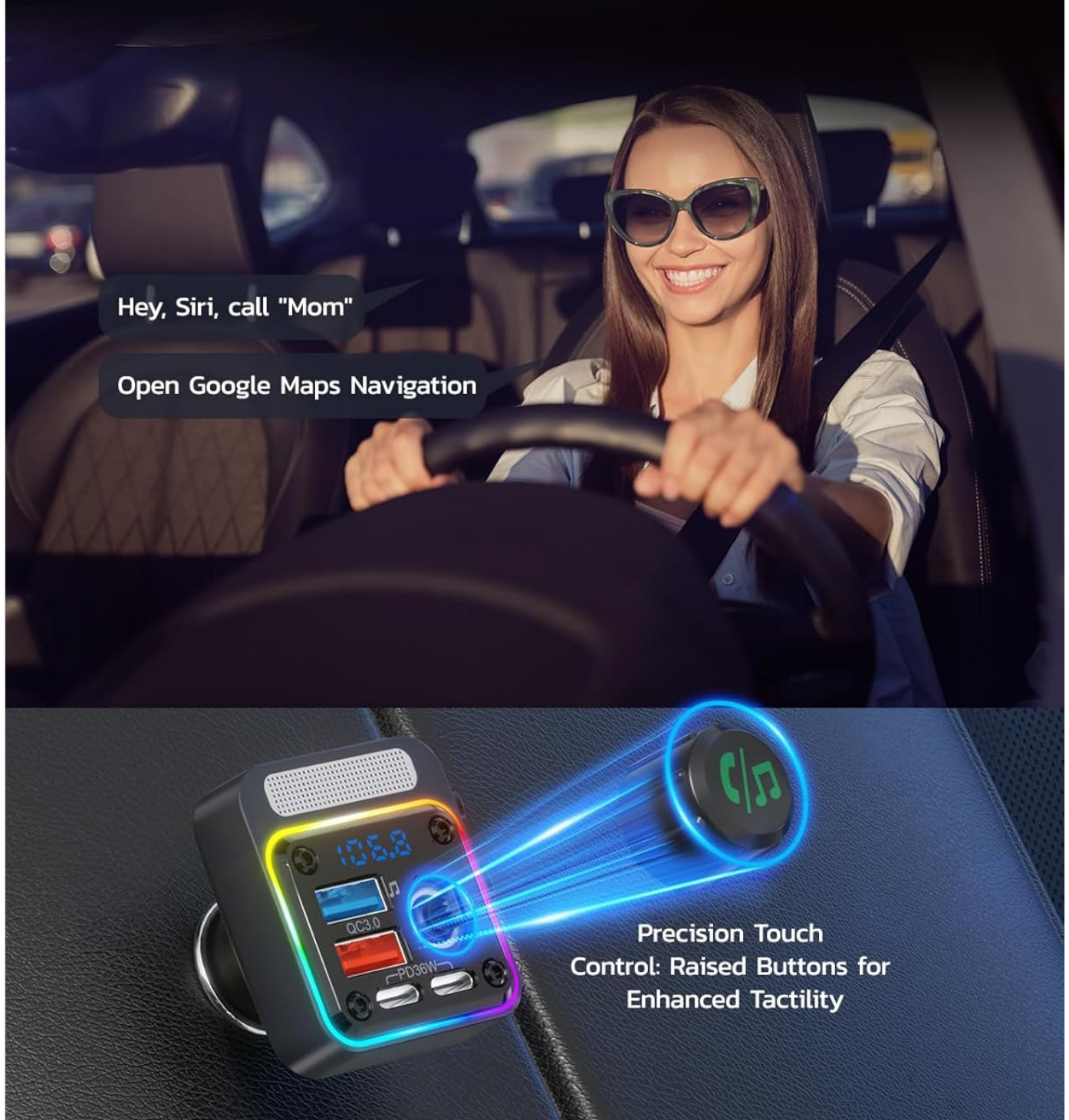
Image: The Nulaxy NX16 demonstrating hands-free operation, supporting voice commands for tasks like making calls or navigating, enhancing driving safety.