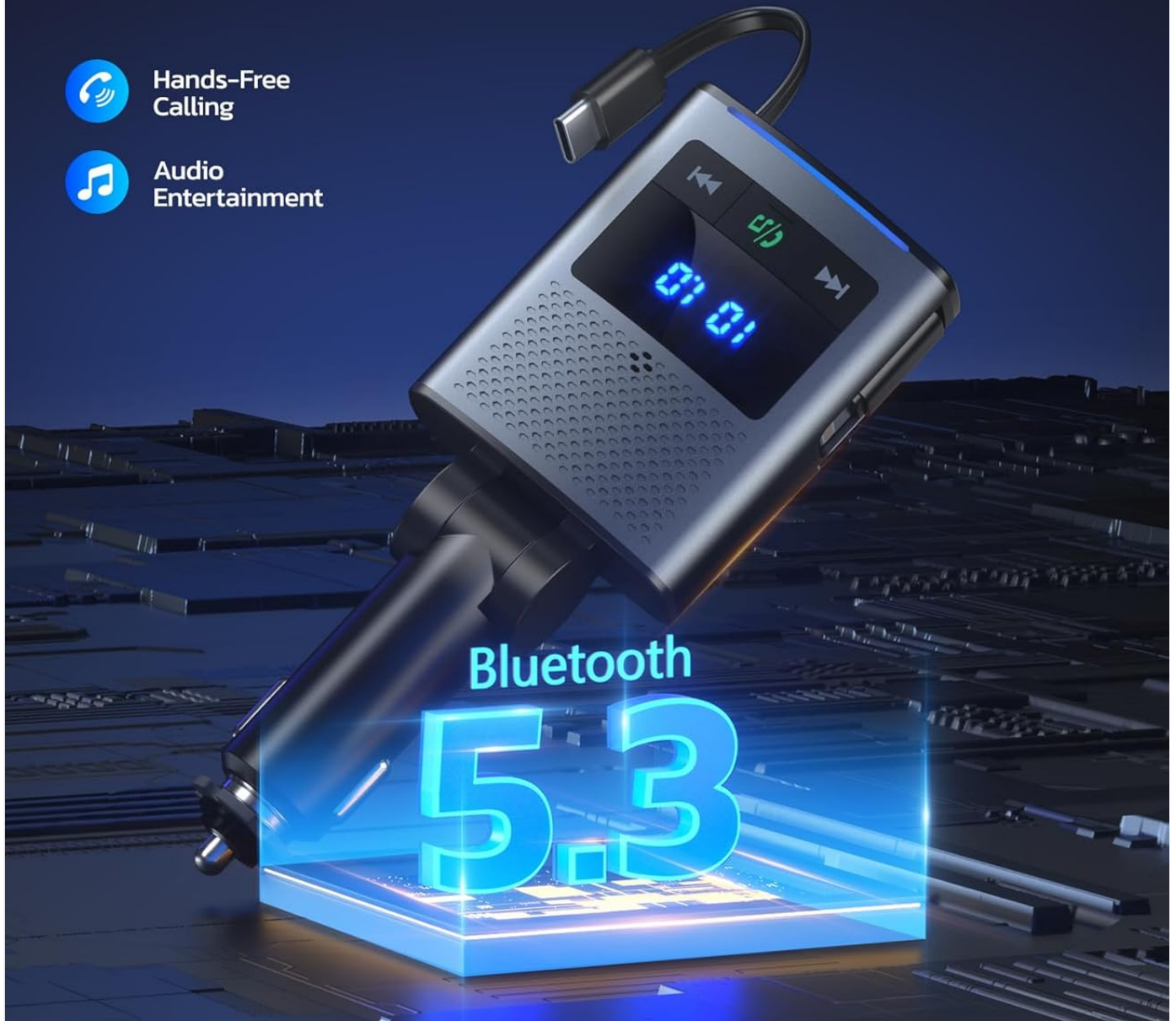
Image: The Nulaxy KM26 highlighting its advanced Bluetooth 5.3 technology, ensuring more stable connections, smoother streaming, and clearer calls for an enhanced in-car experience.