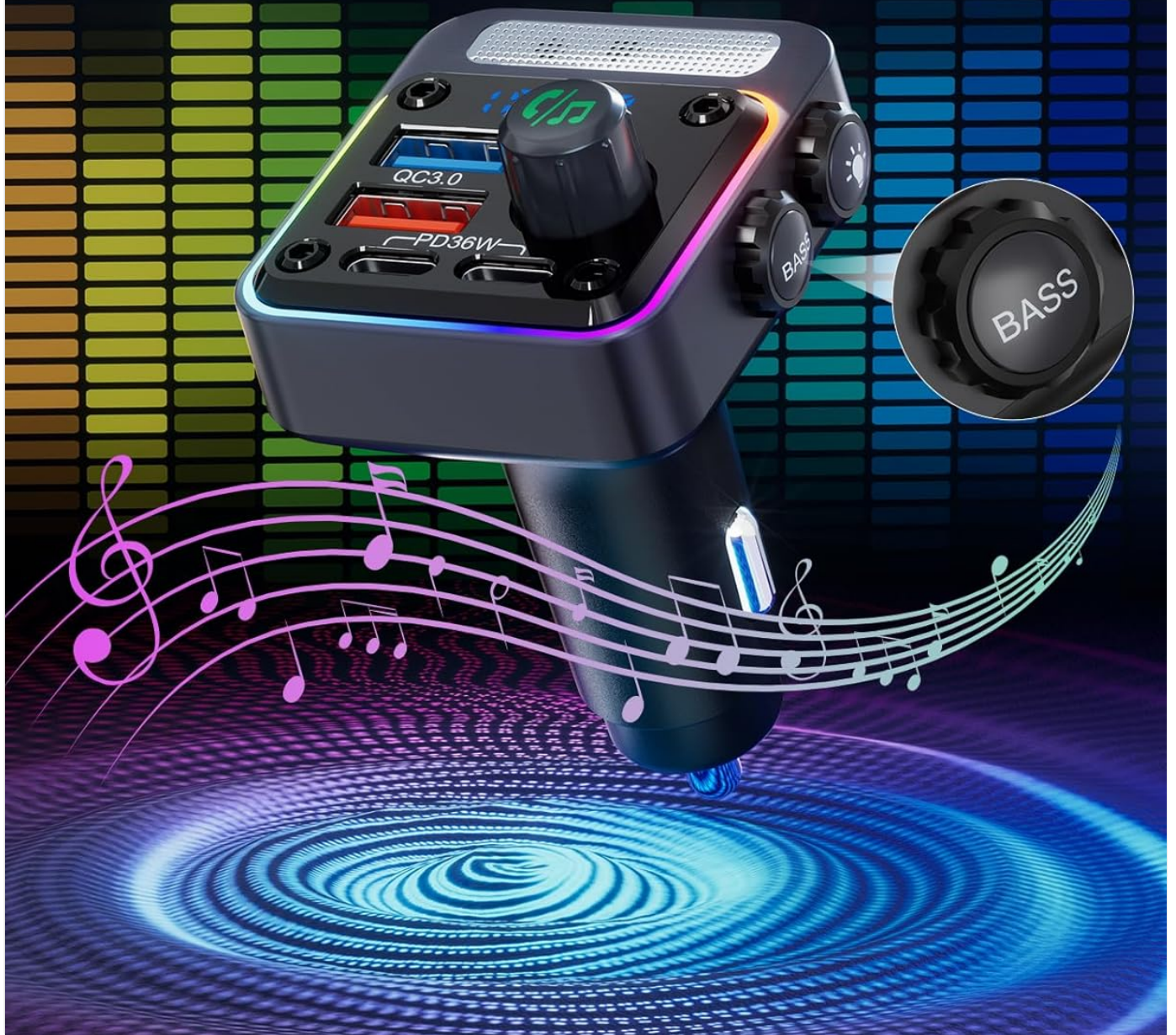
Image: The Nulaxy NX16 showcasing its deep bass feature, activated by a dedicated button, for an improved audio experience with rich sound.