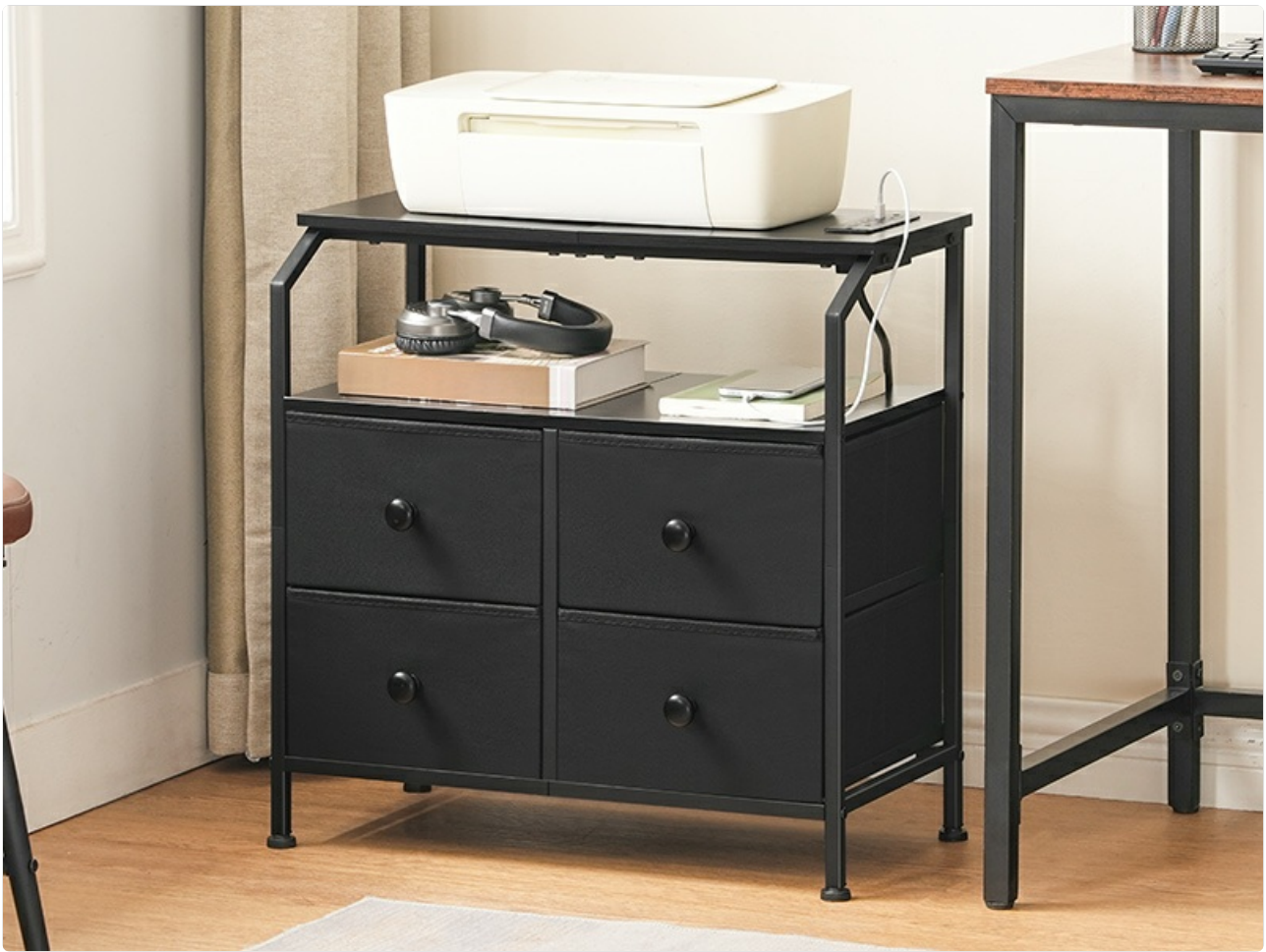
Figure 5: A closer look at the charging station, detailing the two AC outlets, one USB port, and one Type-C port for versatile device charging.