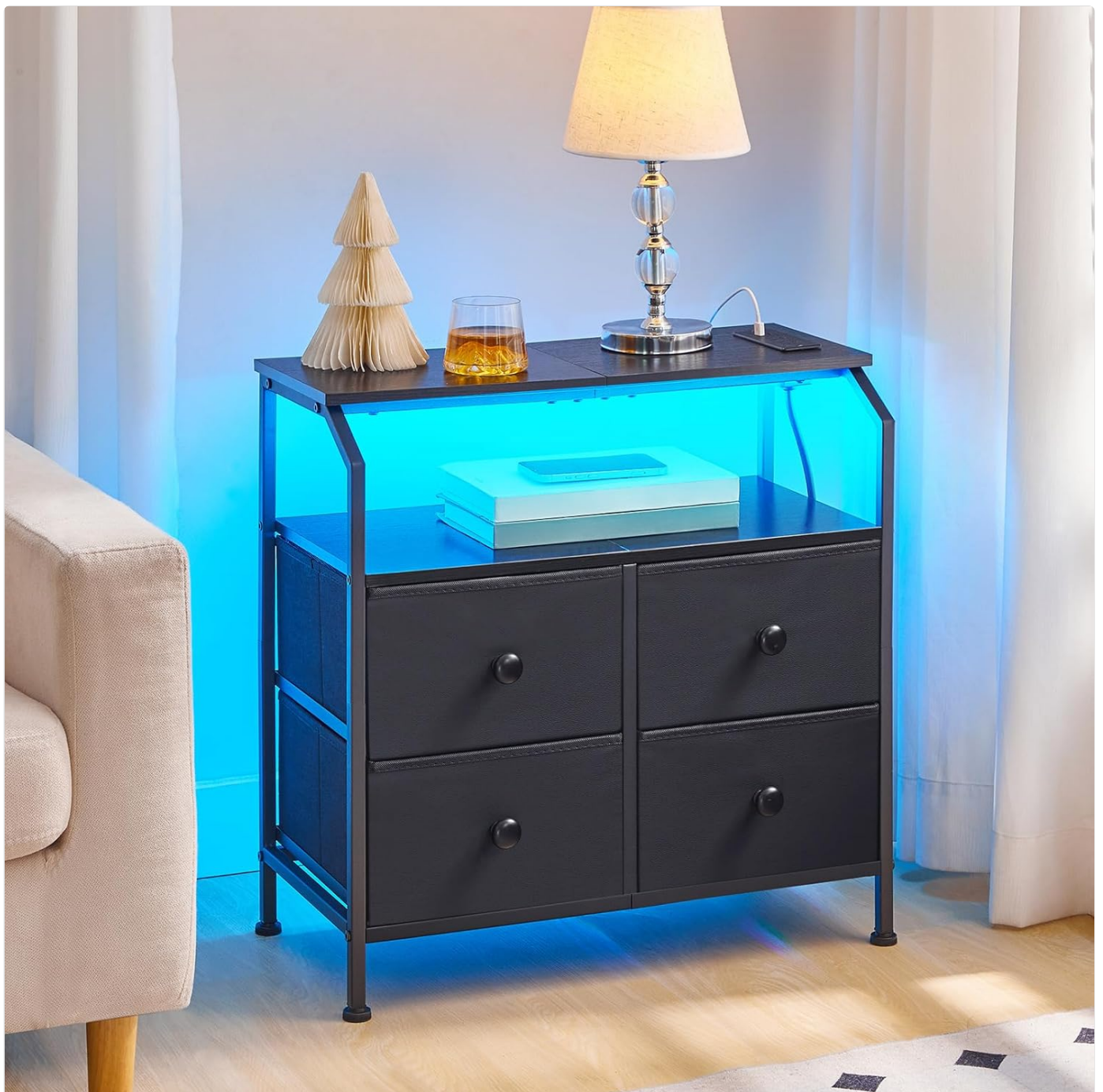
Figure 7: The nightstand displaying a blue LED light, illustrating its use as an end table in a living room setting.