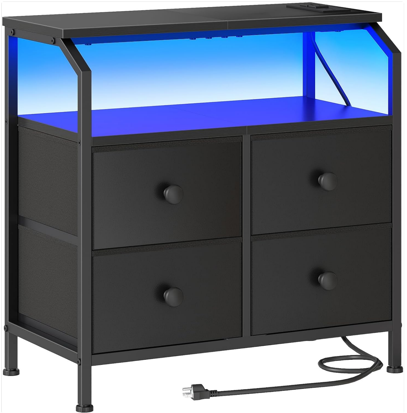
Figure 1: Overall view of the HOOBRO BB190UDBZ01 Nightstand in black, showcasing its open shelves, fabric drawers, and integrated charging station, illuminated by a blue LED light.