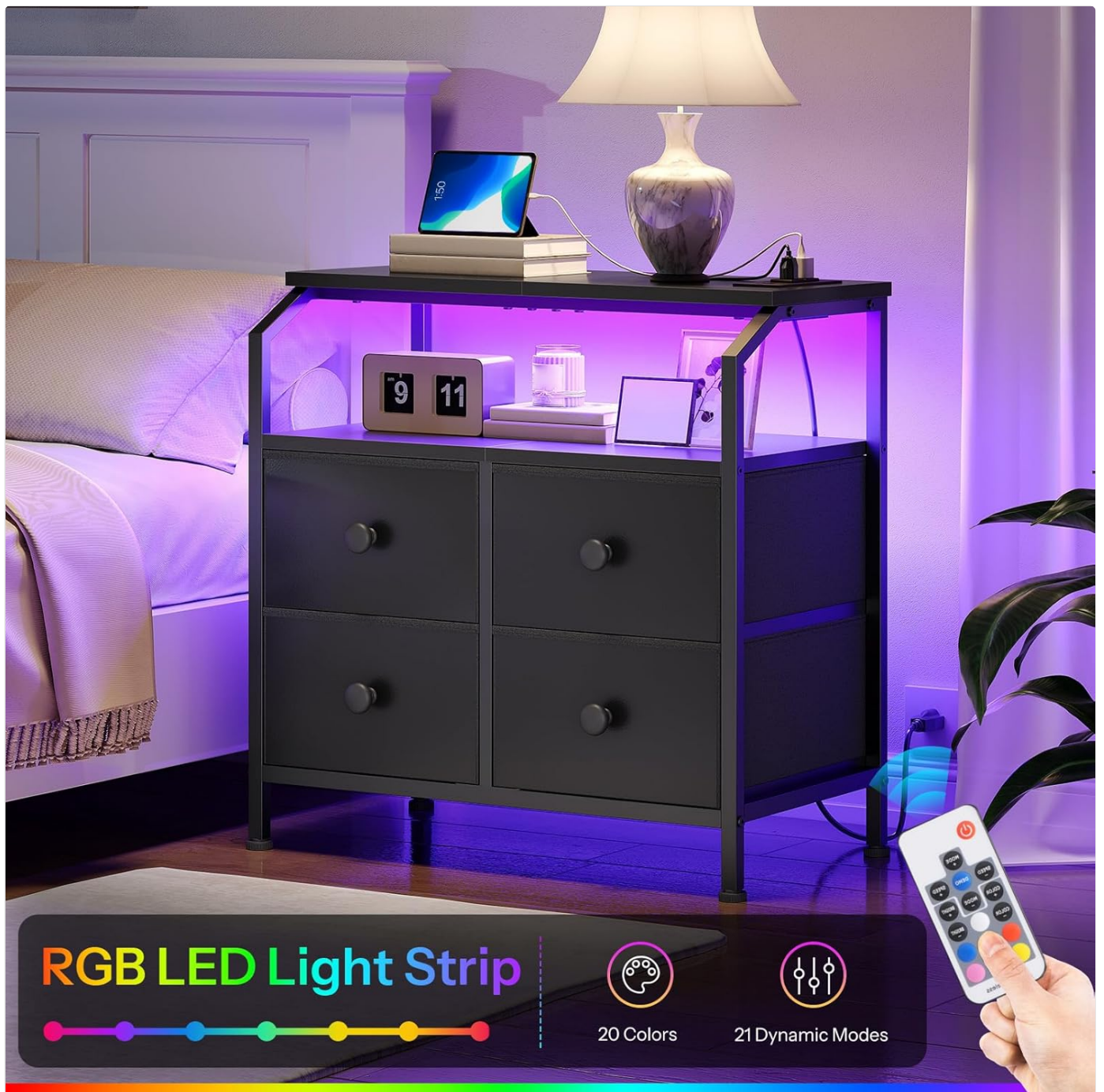
Figure 6: The nightstand illuminated with a purple LED light strip, demonstrating the customizable lighting feature and the remote control for easy adjustments.