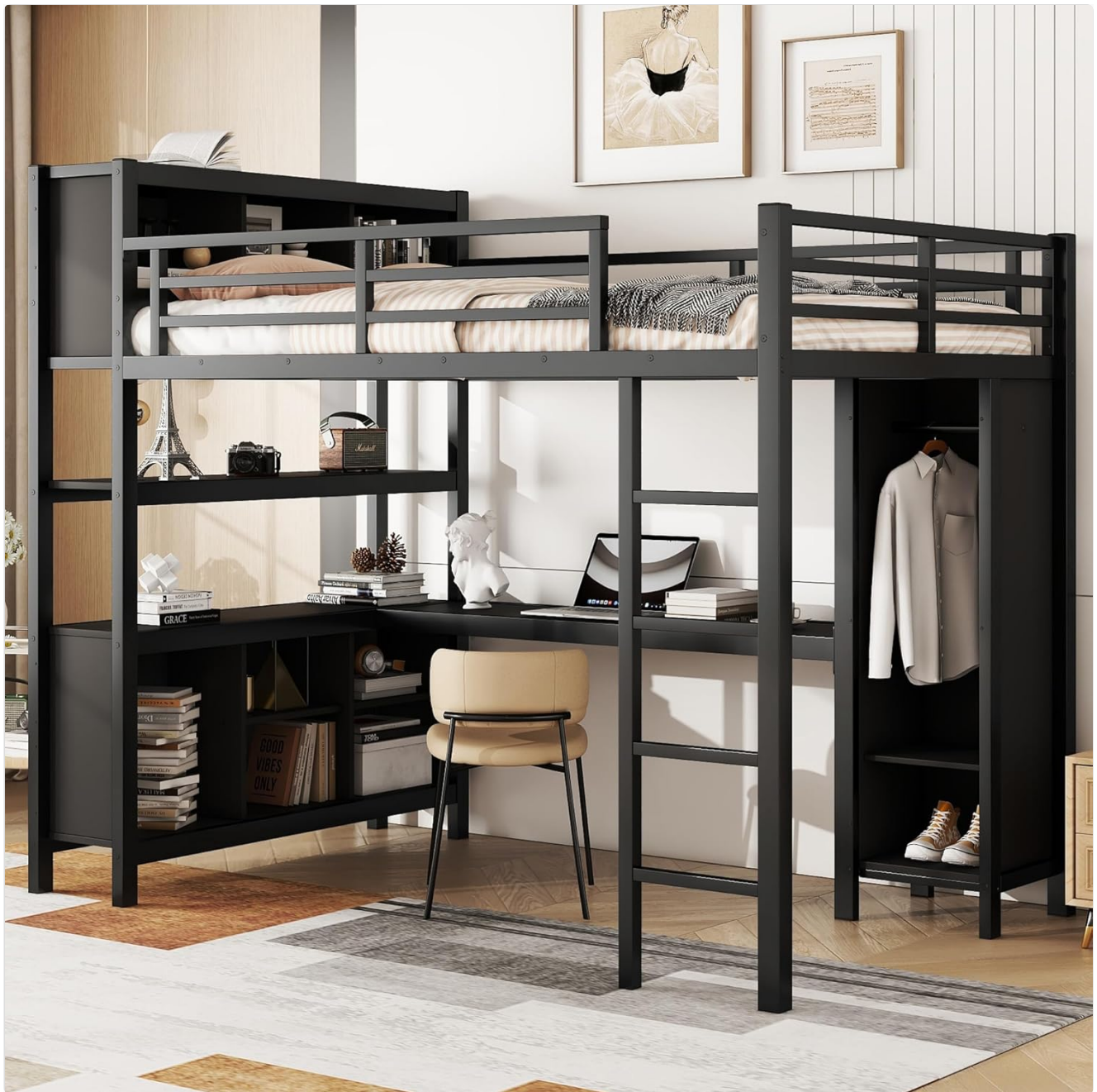
Image 1.1: Fully assembled Metal Full Size Loft Bed with integrated wardrobe, L-shaped desk, and storage shelves.

This loft bed features a full-size sleeping area, an L-shaped desk for work or study, a wardrobe for clothing storage, and additional storage compartments. Its design is optimized for space-saving in various room settings.