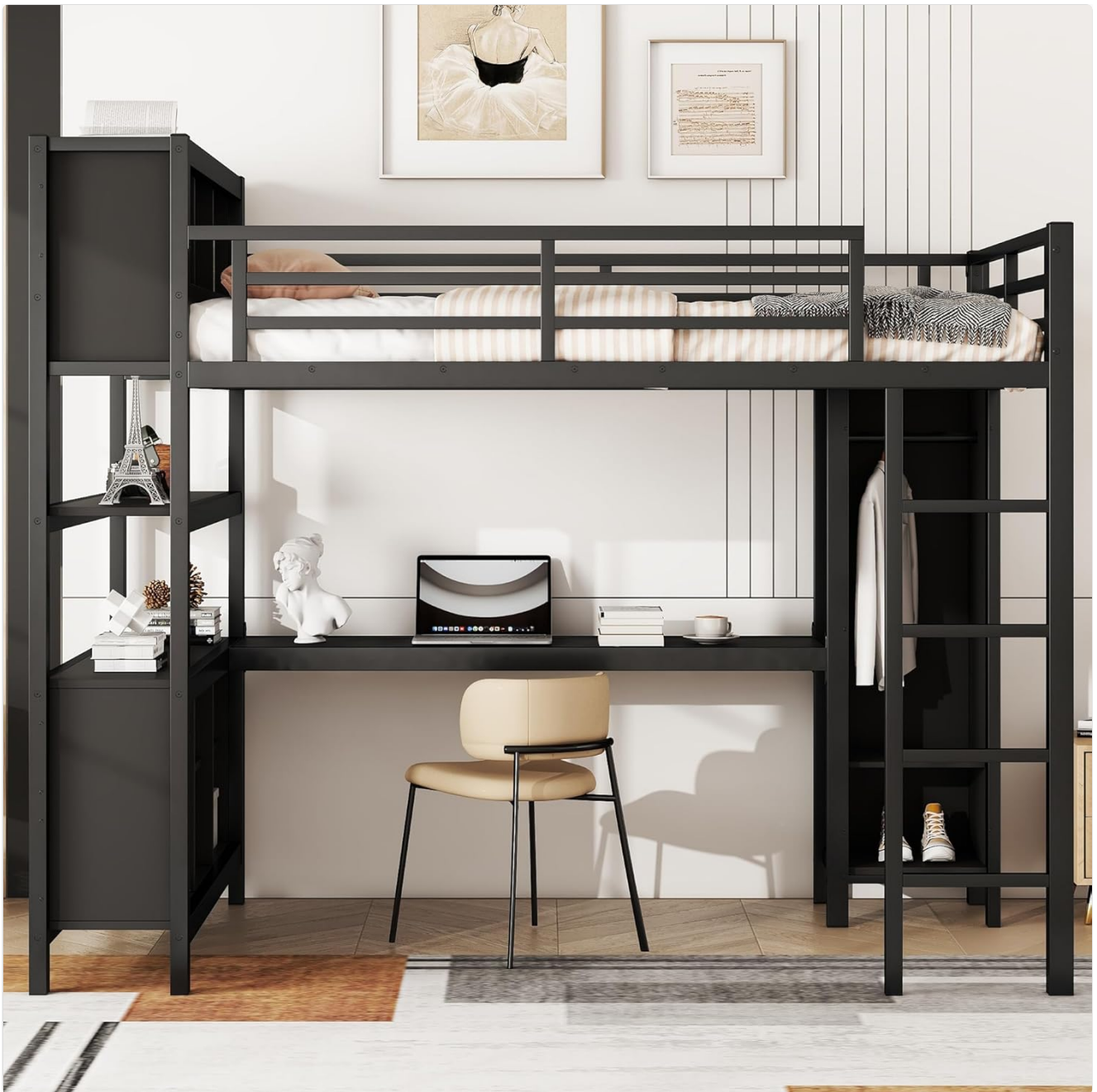
Image 5.1: View of the loft bed highlighting the L-shaped desk, suitable for a laptop and other study or work essentials.