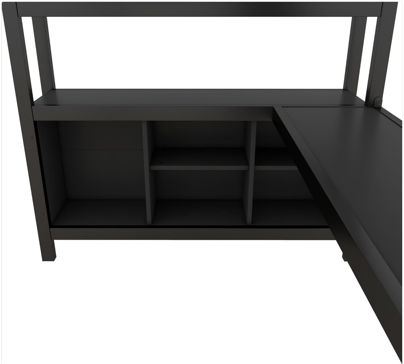
Image 5.2: Detailed view of the storage cubes and shelves, demonstrating their capacity for various items.