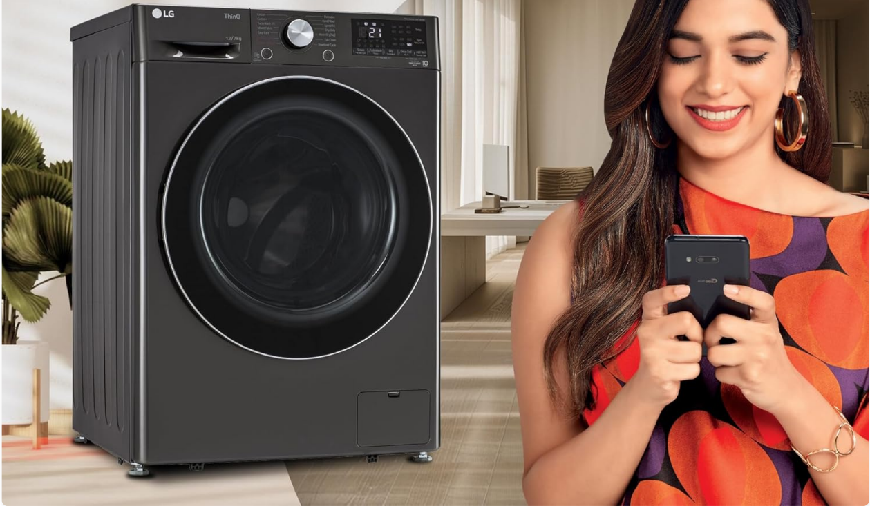
Figure 12: A user utilizing the Smart Diagnosis feature via the LG ThinQ app to identify and resolve appliance issues.