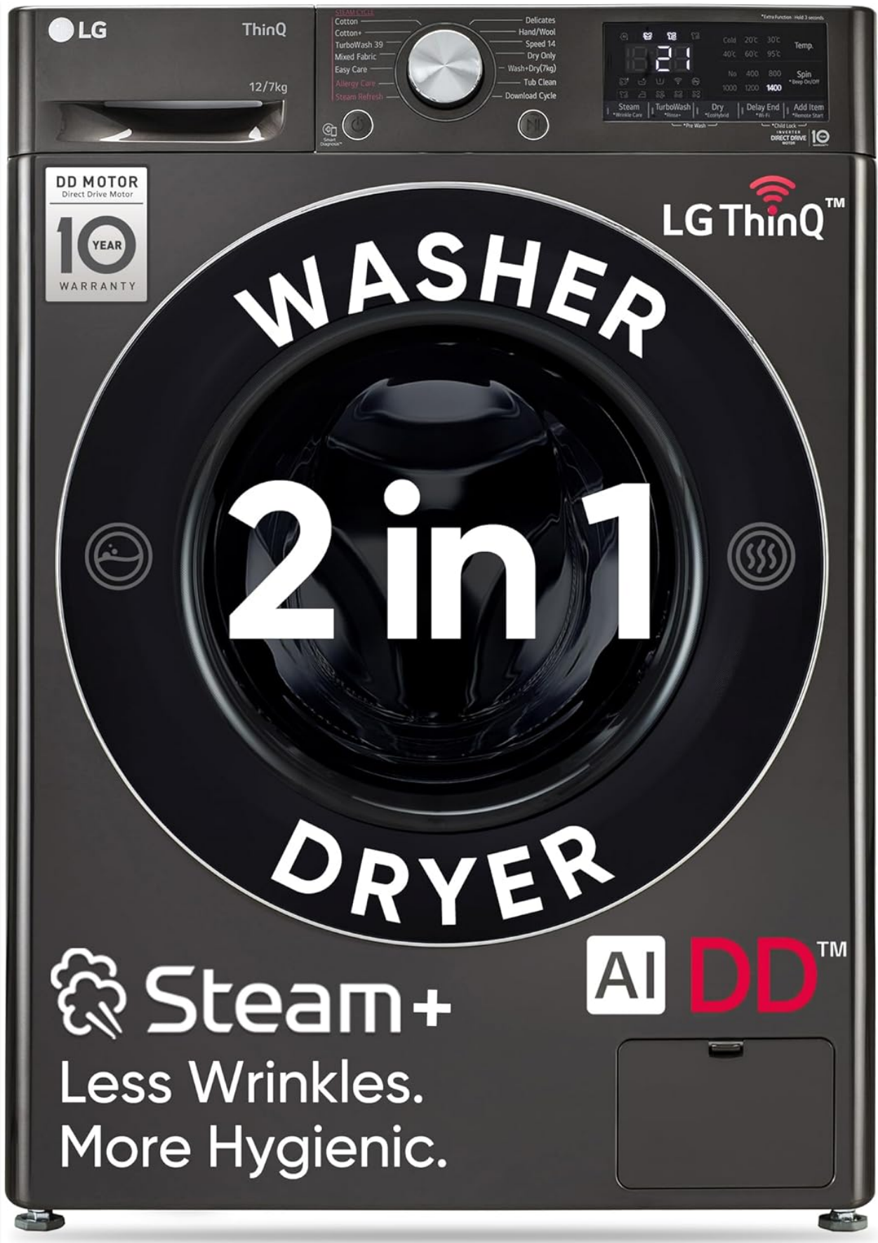
Figure 1: LG FHD1207STB Front Load Washer Dryer, Platinum Black finish.