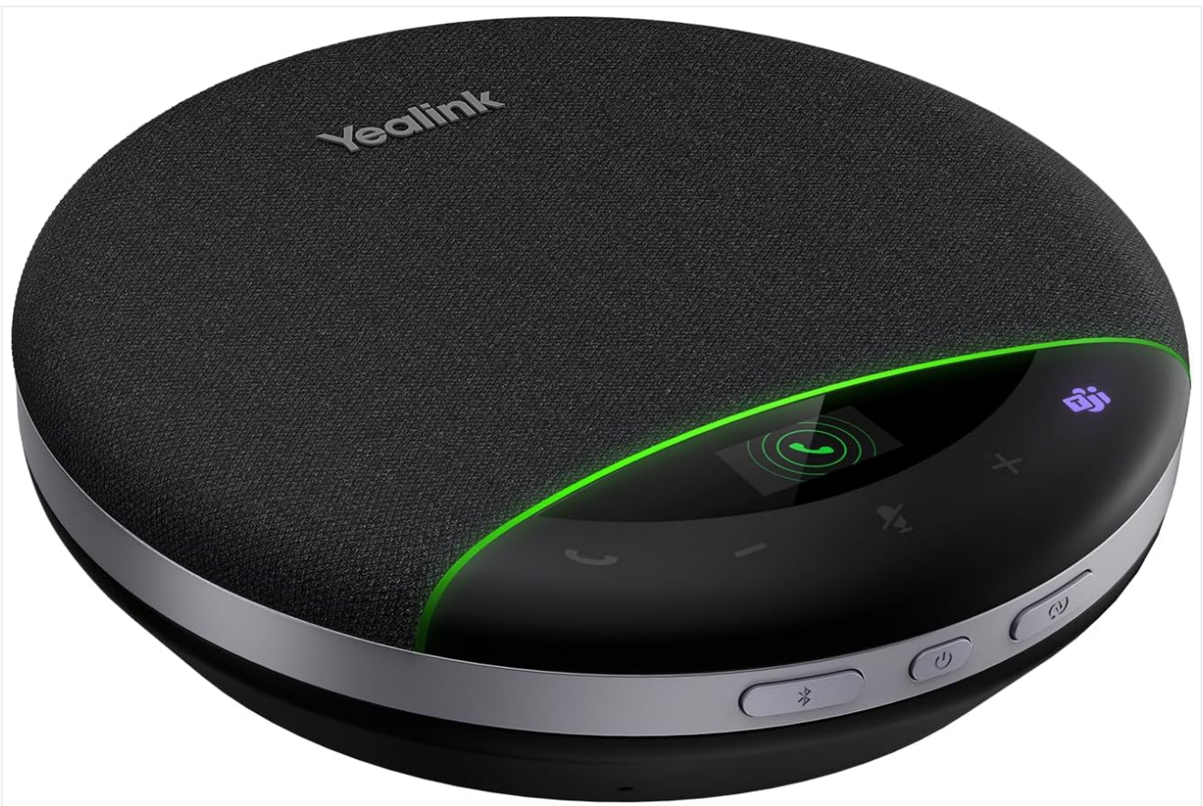
The Yealink SP96 speakerphone, showcasing its compact and user-friendly design.

The Yealink SP96 features a sleek, compact design with intuitive controls. The top surface is covered with a durable fabric, while the base houses the speaker and microphone array. An integrated LCD screen provides real-time status updates, and touch-sensitive buttons allow for easy call management, volume control, and mute functions.