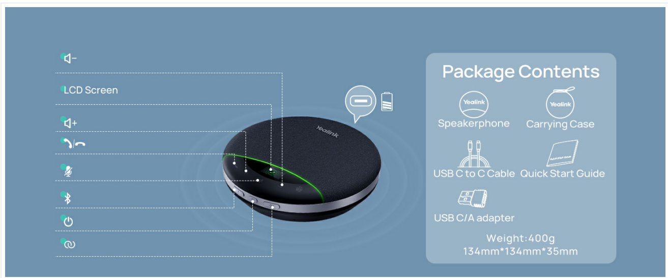
Illustration of the SP96 package contents, including the speakerphone, carrying case, USB-C to C cable, quick start guide, and USB C/A adapter.