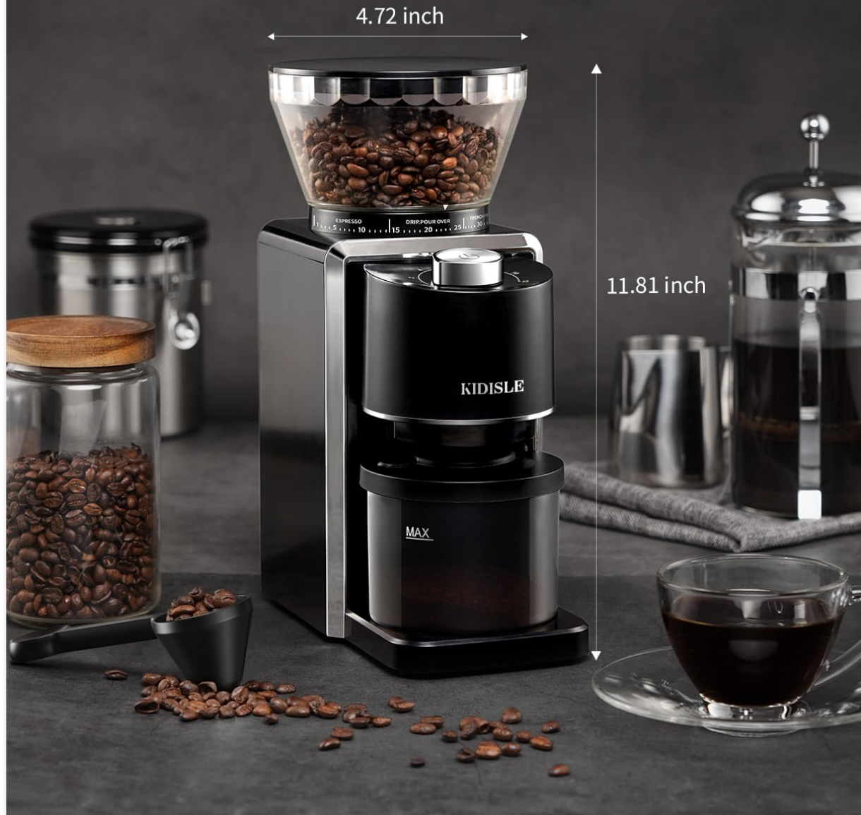
Image: The KIDISLE coffee grinder showcasing its compact dimensions on a kitchen counter.