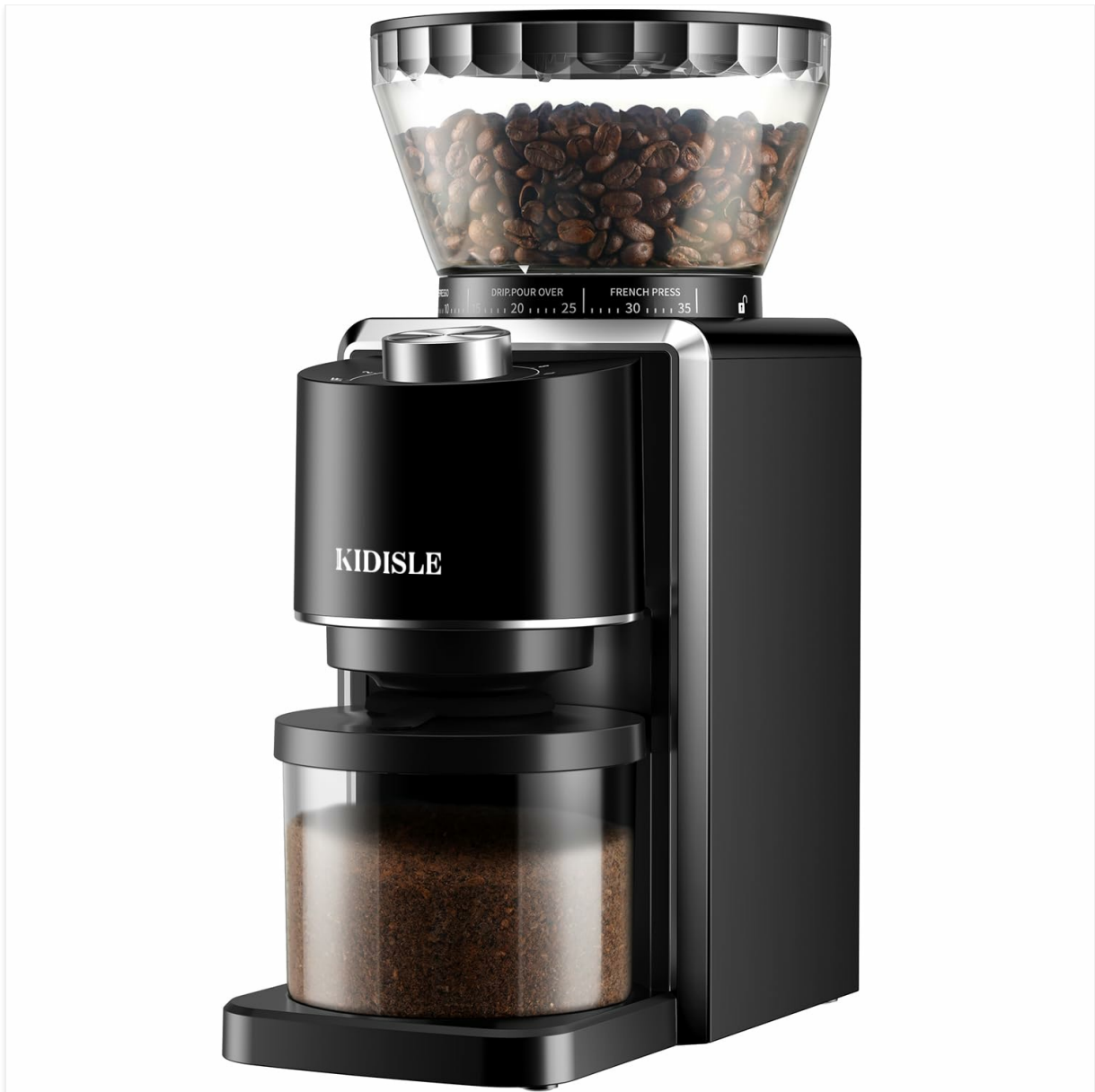
Image: The KIDISLE Conical Burr Coffee Grinder, a sleek black appliance designed for home use.