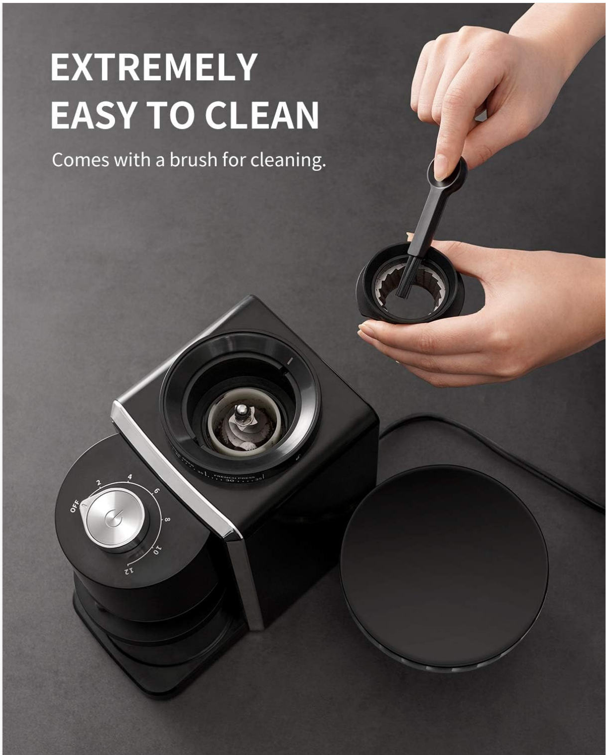
Image: A hand using the provided brush to clean the removable burr of the KIDISLE coffee grinder.