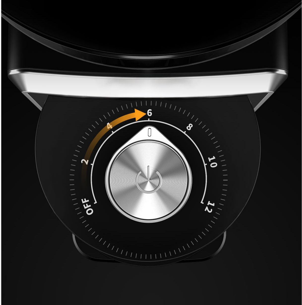
Image: Close-up of the cup selector dial on the KIDISLE coffee grinder, showing settings from 2 to 12 cups.