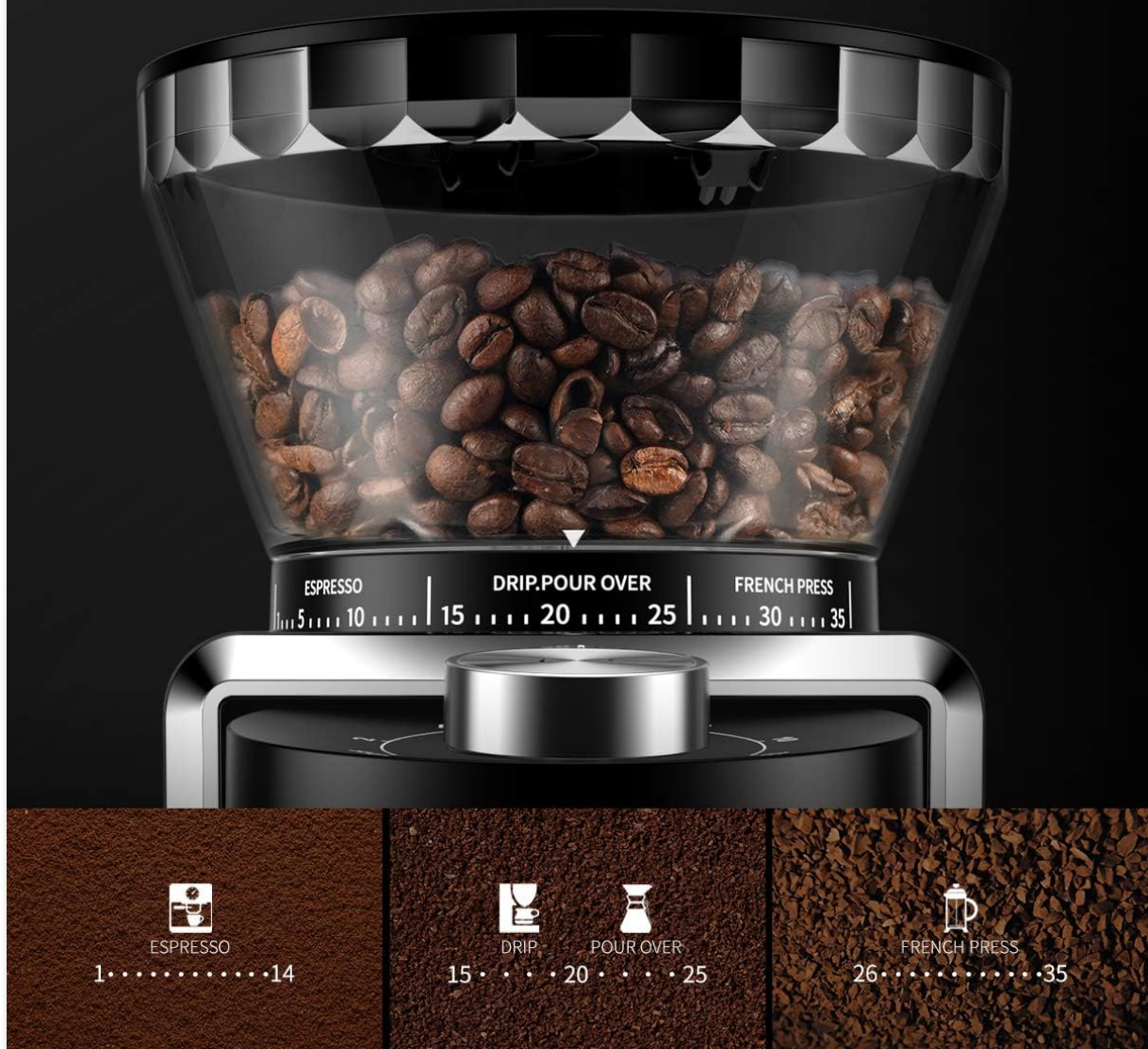
Image: The grind settings dial on the KIDISLE coffee grinder, indicating ranges for Espresso, Drip/Pour Over, and French Press.

Can grind super-fine to super-coarse with ease.