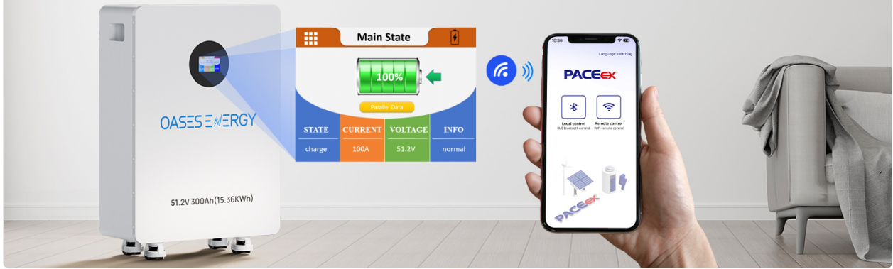
Figure 5.1: The smart touch-screen interface on the Oasesenergy battery, showing real-time battery status, alongside a mobile application for remote monitoring.

The touchable LCD monitor provides real-time information about the battery's state, current, voltage, and other critical parameters. When multiple batteries are connected in parallel, you can monitor information for each individual cell and each battery unit. The user-friendly interface allows for easy navigation and data access.