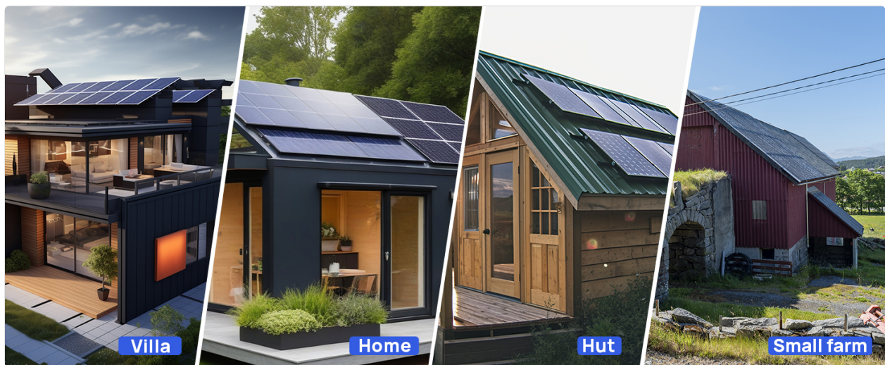
Figure 3.3: Illustrates diverse applications including villas, homes, huts, and small farms, demonstrating the battery's versatility for various energy storage needs.