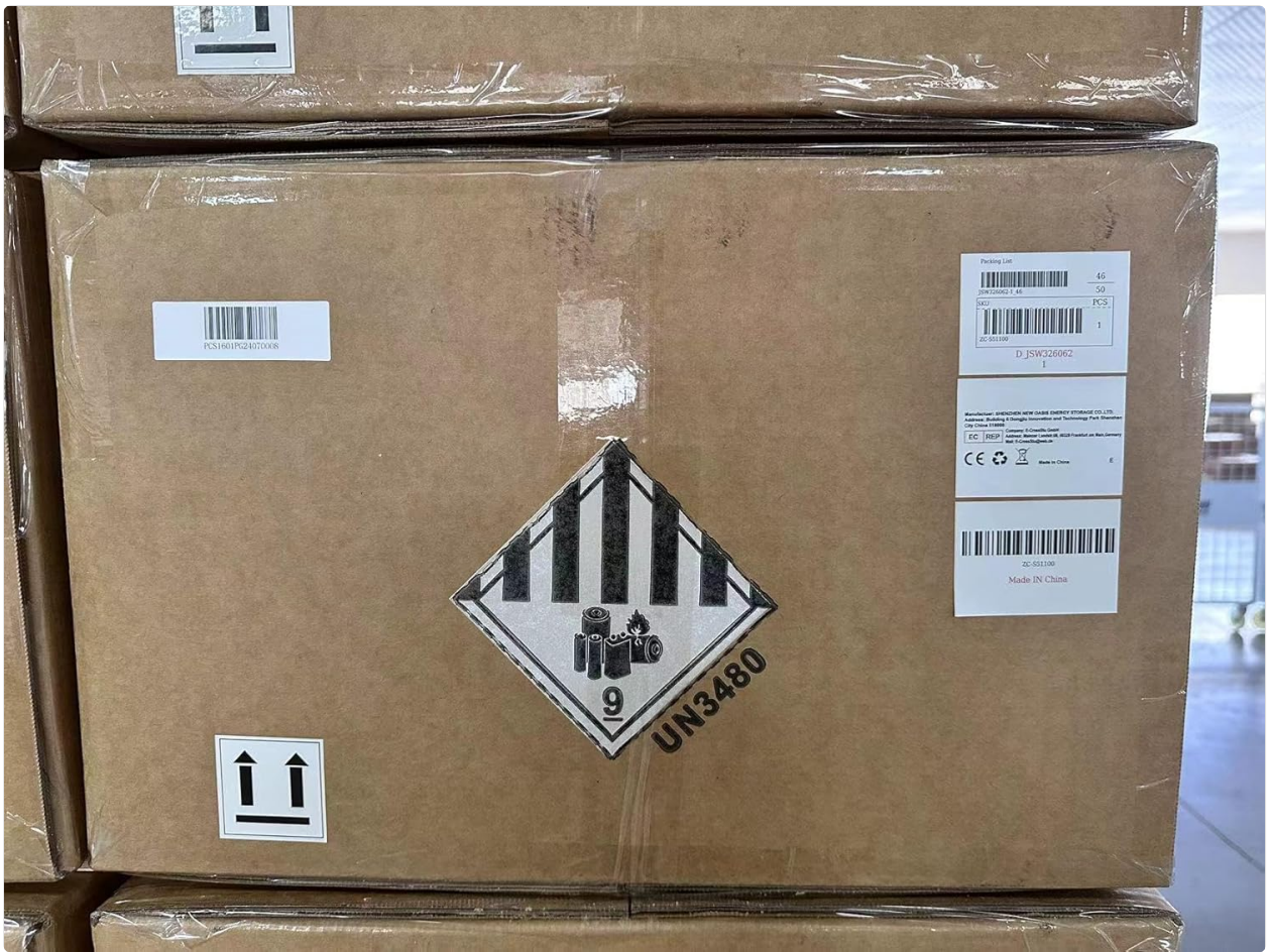
Figure 4.1: The shipping box for the Oasesenergy LiFePO 4 battery, displaying hazardous material labels (UN3480) for safe transport.

Carefully unpack the battery from its packaging. Inspect for any signs of damage during transit. Report any damage to your supplier immediately.