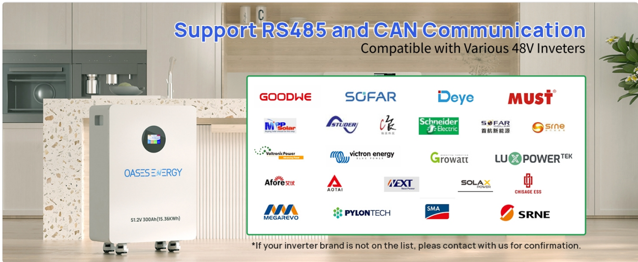
Figure 5.3: The Oasesenergy battery in a modern kitchen environment, emphasizing its seamless integration and communication capabilities with a wide range of 48V inverters.

The battery supports RS485 and CAN communication, enabling intelligent interaction with compatible 48V inverters. Refer to your inverter's manual for specific connection and configuration details. This communication allows for optimized charging, discharging, and system management.