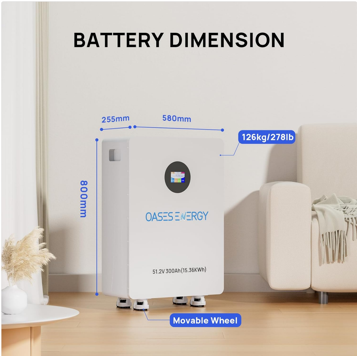
Figure 8.1: Dimensional drawing of the Oasesenergy 48V 300Ah LiFePO4 battery, indicating its height, width, depth, and weight, along with the movable wheels.