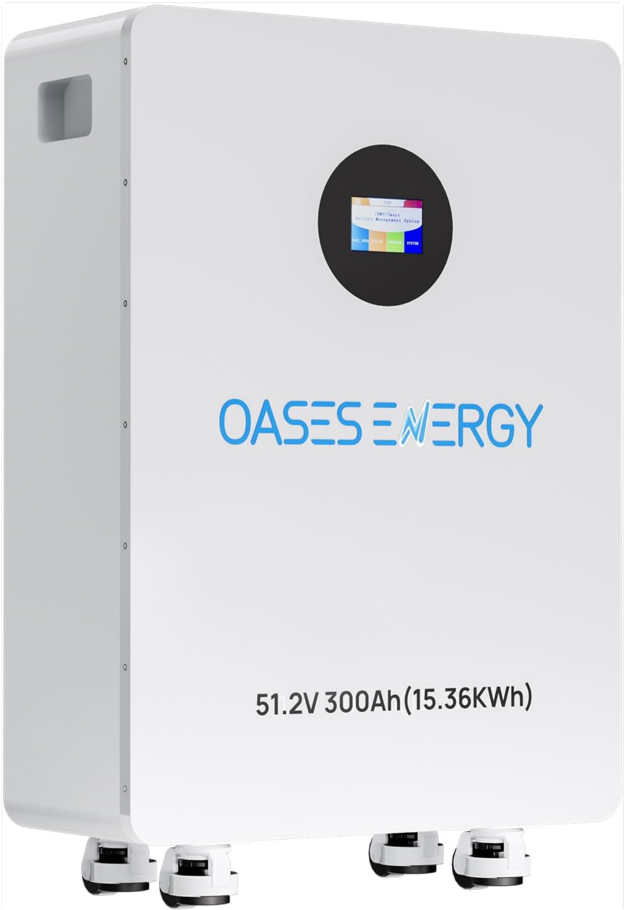
Figure 3.1: Front view of the Oasesenergy 48V 300Ah LiFePO4 Lithium Battery, showcasing its compact design and integrated LCD screen.