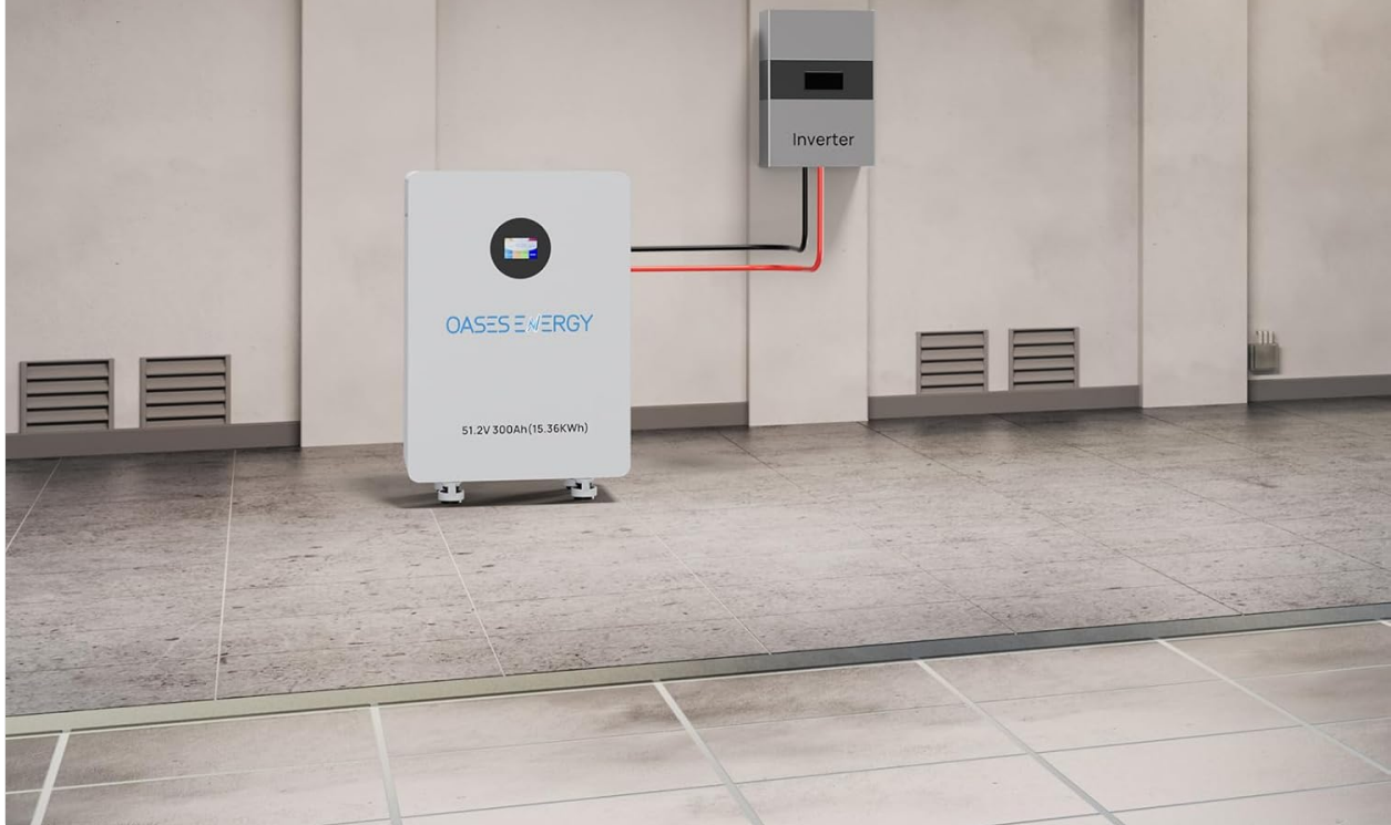
Figure 4.3: The Oasisenergy battery connected to an inverter, demonstrating a typical setup for home energy storage or off-grid applications.

Connect the battery to your inverter system using appropriate cables and connectors. Ensure all connections are secure and correctly polarized. The battery supports parallel connection of up to 16 units for increased capacity. Serial connection is not supported.