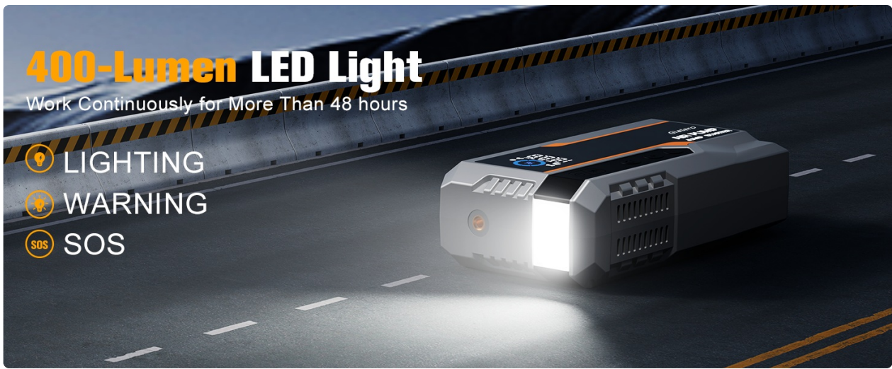
Image: 400-Lumen LED Light