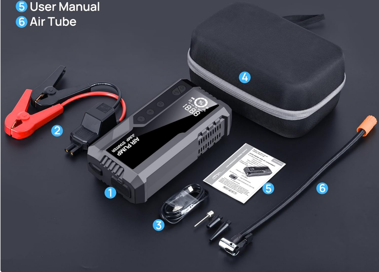
Image: Package Contents