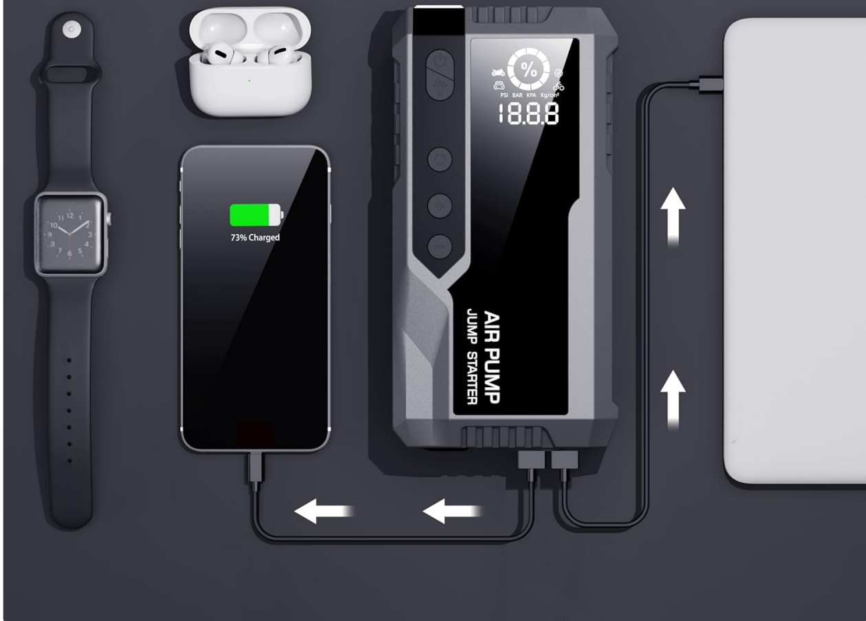
Image: Portable Power Bank Function