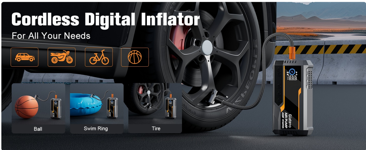
Image: Cordless Digital Inflator Applications

Warning: Do not use the air pump function continuously for prolonged periods. If the compressor becomes seriously hot, allow it to cool down for a few minutes before continuing operation.