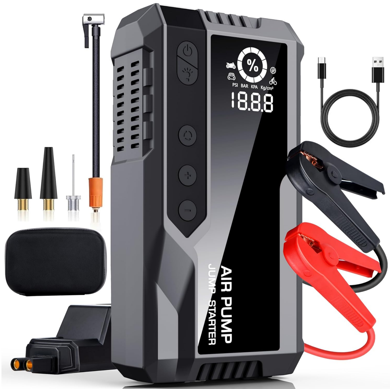
Image: giatero 4000A Jump Starter and Accessories