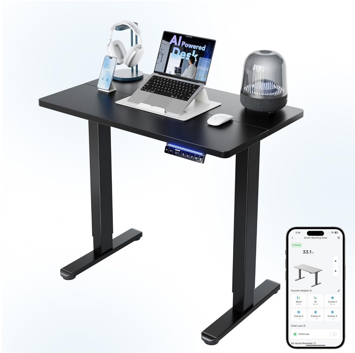
Figure 3: The HUANUO AI-Powered Electric Standing Desk with its accompanying smartphone application for smart control.

recommended ergonomic seat height adjustments based on your height and weight.