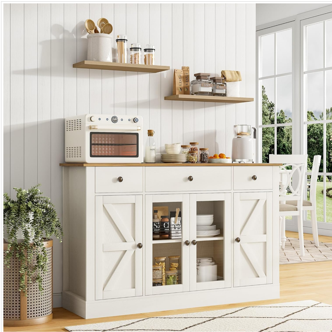
Figure 1: Assembled 4 EVER WINNER 55-inch Coffee Bar Cabinet in a dining room setting.