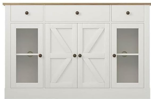
Figure 4: Detailed view highlighting the farmhouse barn door, glass cabinet door, and adjustable interior shelves.