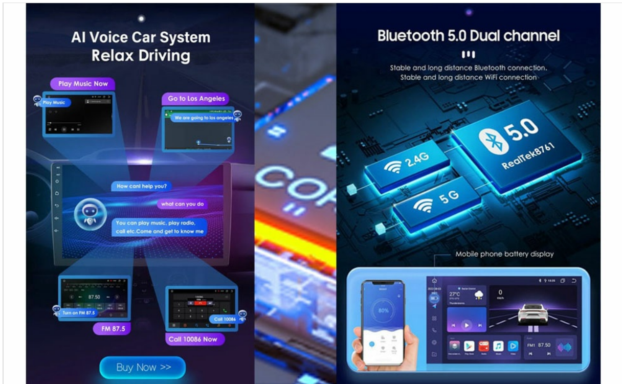
Figure 3.1: Installation Example - This image displays the WXWBFAO car stereo seamlessly integrated into a Ford Ecosport dashboard, showcasing various operational screens like radio, navigation, and application interfaces.