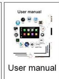
Figure 4.1: Main User Interface - This image displays the primary screen of the car stereo, featuring large, colorful icons for navigation, music, and radio functions, along with status indicators at the top.