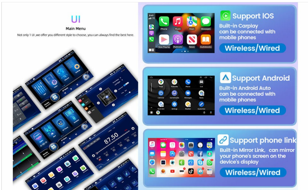
Figure 4.3: Carplay and Android Auto - This image illustrates the user interfaces for both Apple Carplay and Android