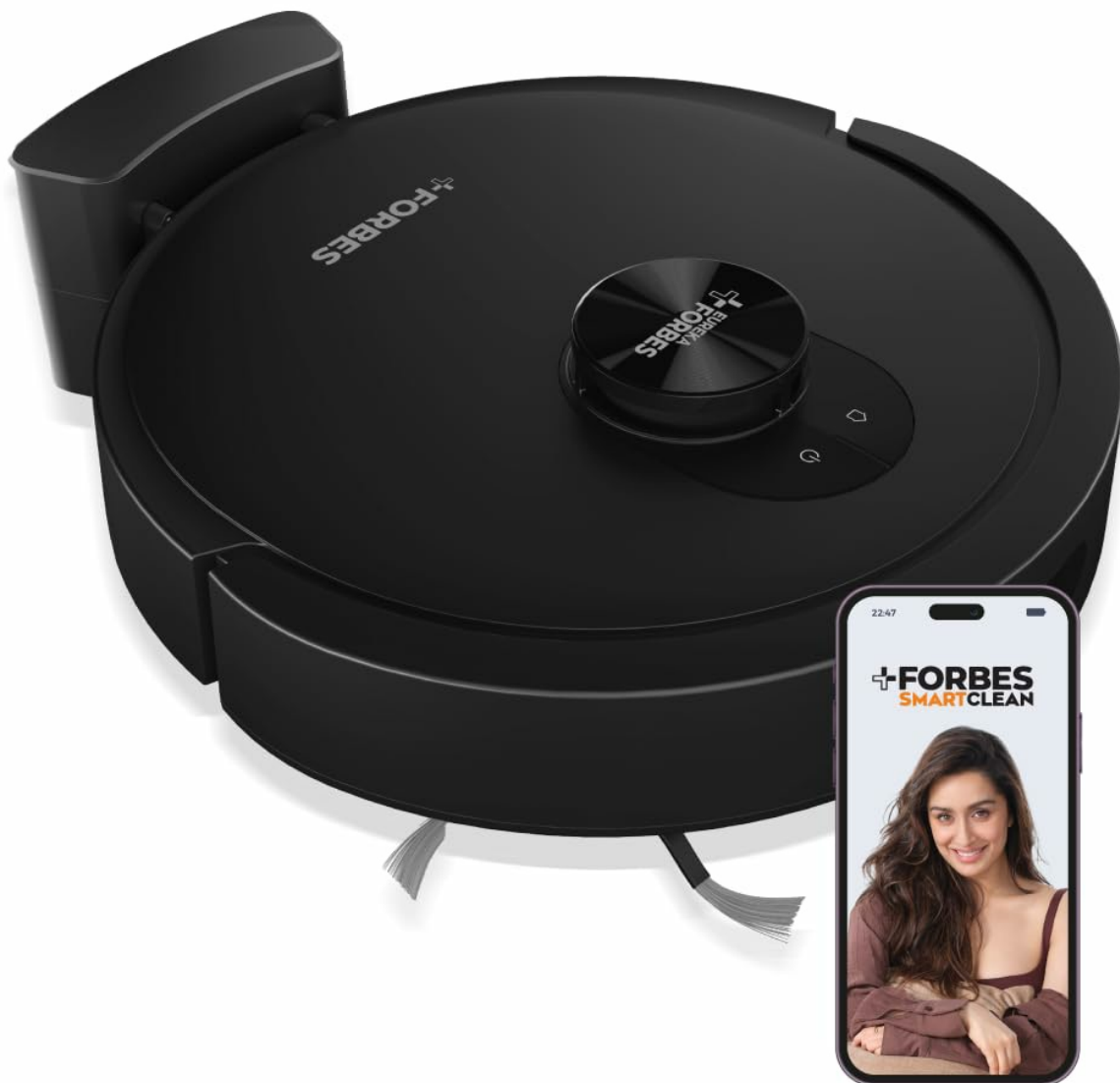
Image: The robotic vacuum cleaner, its charging dock, and a smartphone displaying the companion app.

The Eureka Forbes SmartClean Home Mapping Turbo is a sophisticated robotic vacuum cleaner designed for comprehensive home cleaning. It features advanced LiDAR 3.0 navigation for precise mapping and efficient cleaning paths.