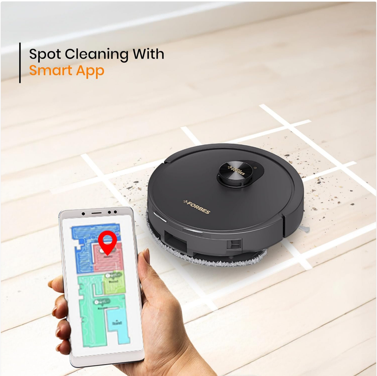
Image: The robotic vacuum cleaner performing spot cleaning on a marked area, with the Smart App interface showing the cleaning zone.