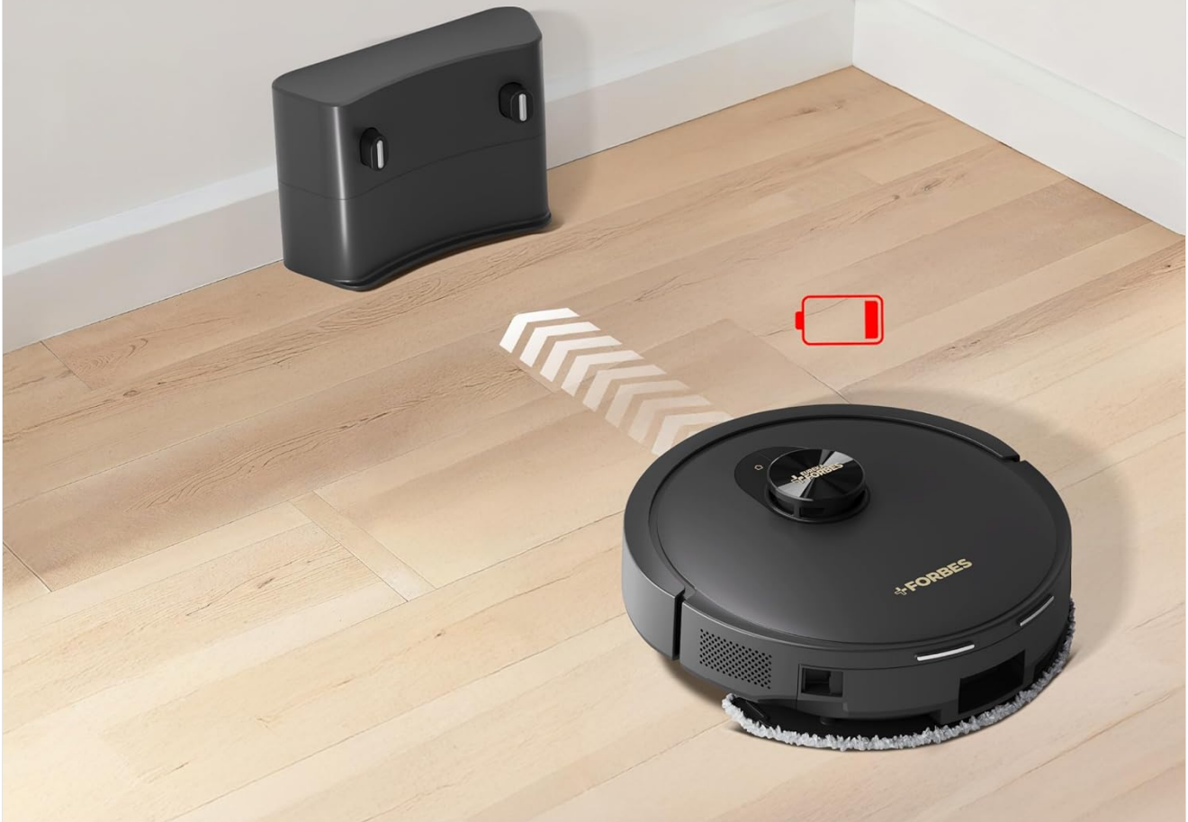
Image: The robotic vacuum cleaner automatically navigating back to its charging station for self-charging.