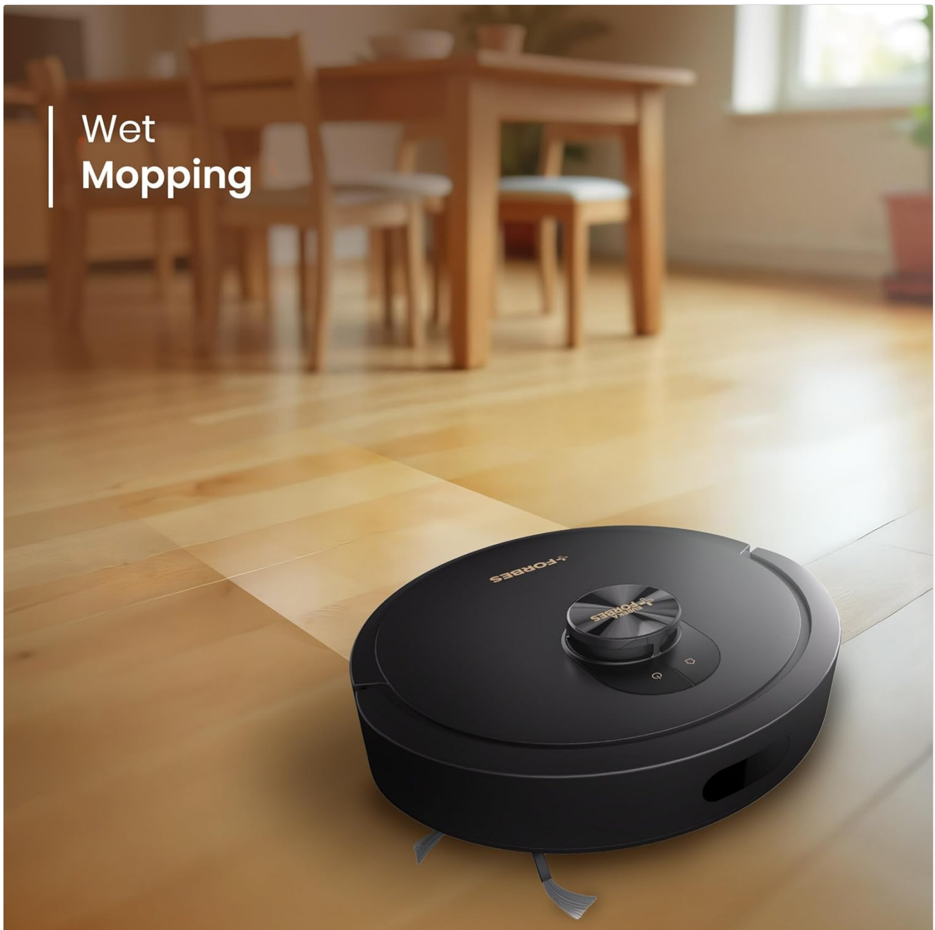
Image: The robotic vacuum cleaner actively performing wet mopping on a clean wooden floor.