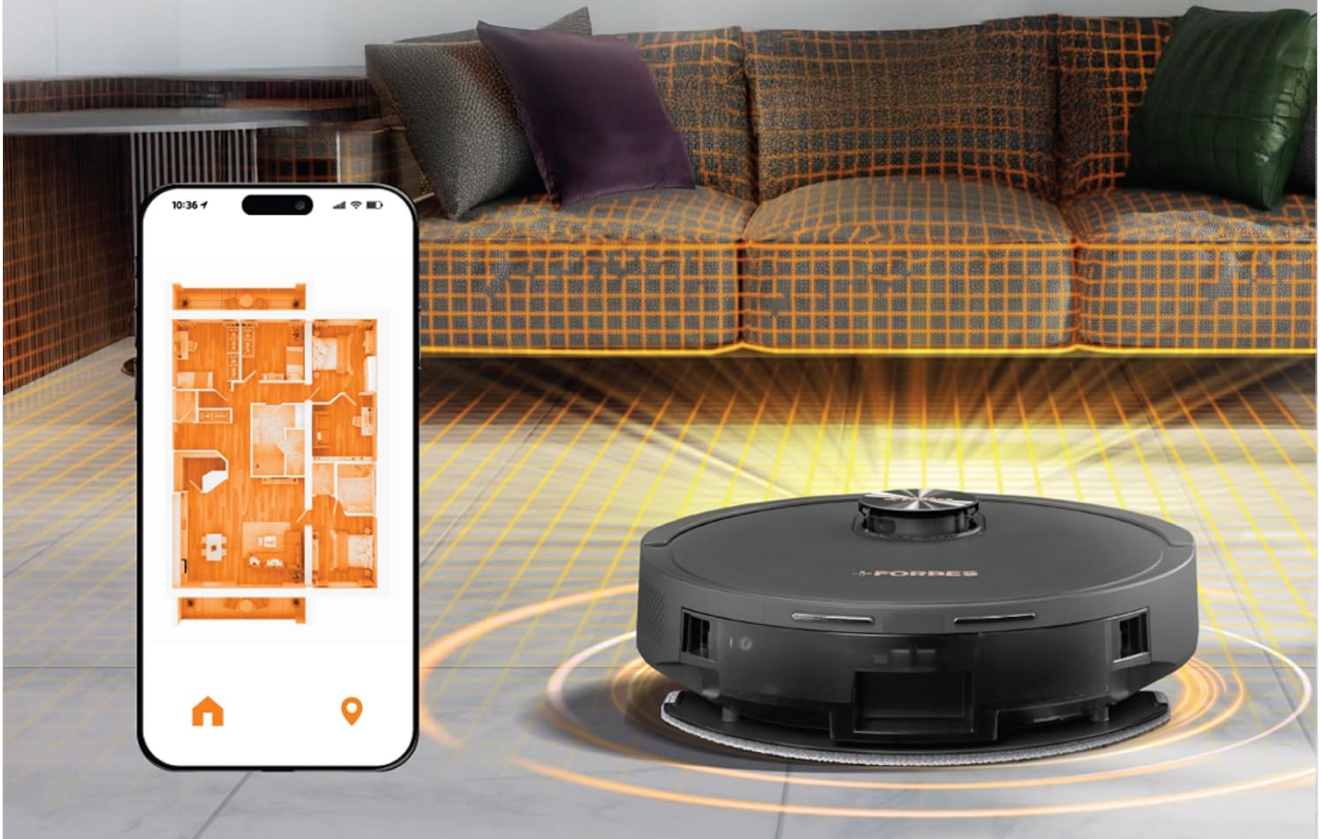
Image: The robotic vacuum cleaner actively mapping a room using LiDAR 3.0 technology, with the resulting floor plan visible on a smartphone screen.