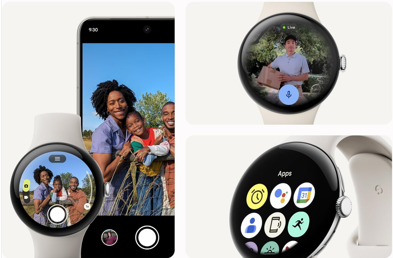
Image: Examples of Google services integration on the Pixel Watch 3, including camera control and Nest Cam viewing.

Access Maps offline and use Wallet for payments, transit, access, and more 6