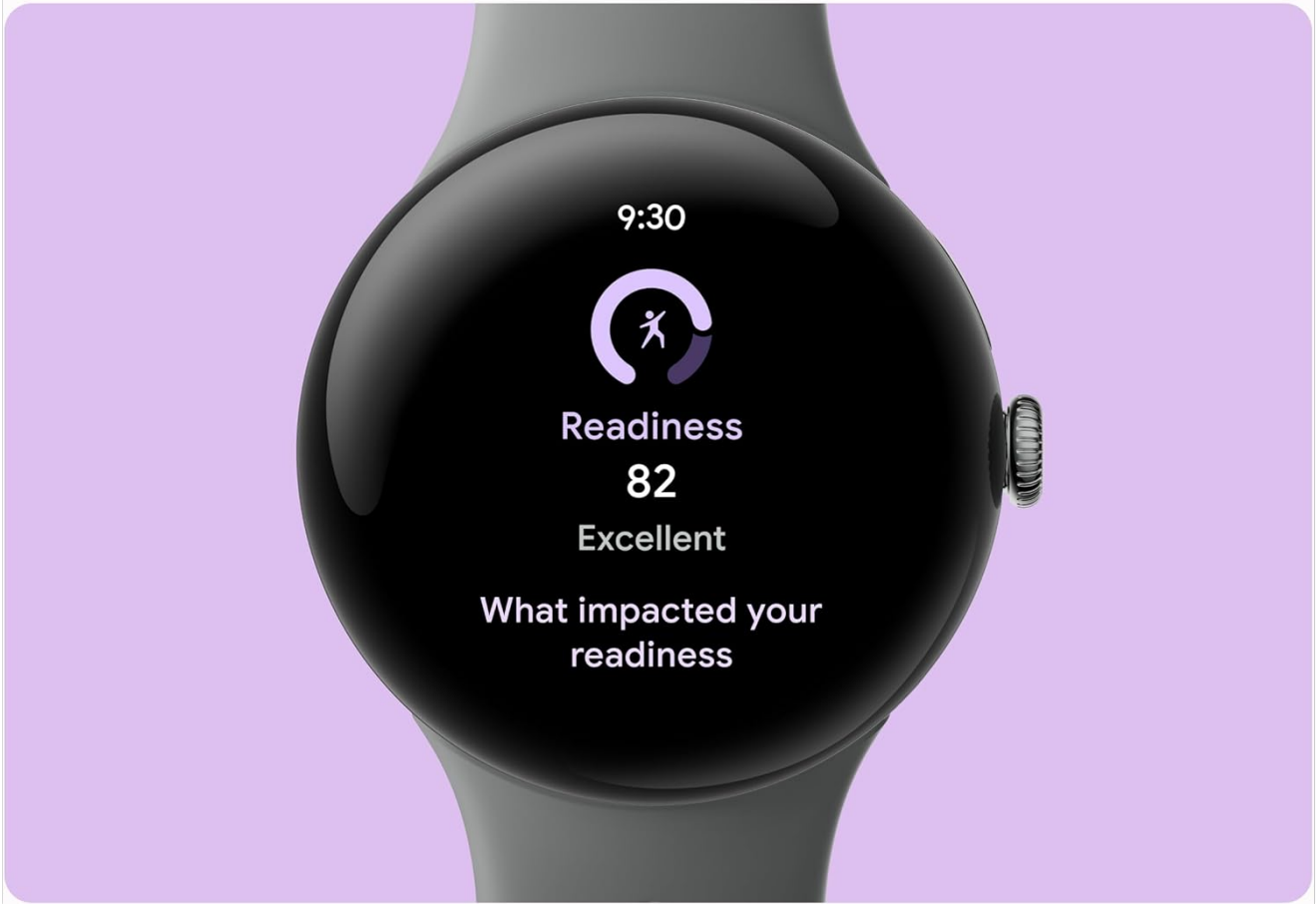
Image: The Readiness feature on the Pixel Watch 3, providing insights into your body's recovery status.

Readiness uses sleep, resting heart rate, and heart rate variability to show when you're ready to take on a tough workout or prioritize recovery. 3