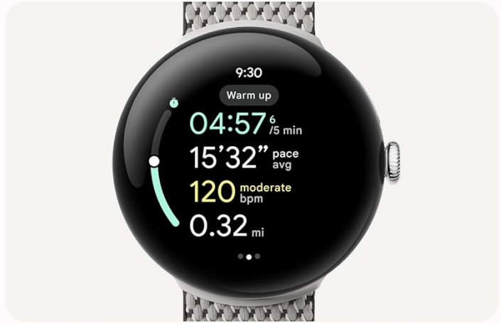
Image: Advanced running features on the Pixel Watch 3, including real-time guidance and form tracking.