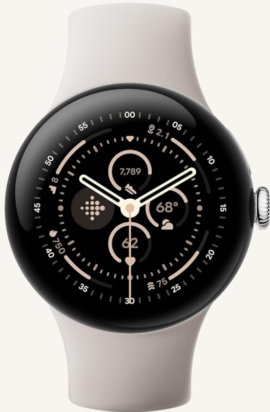
Image: Comparison of Pixel Watch 3 (45mm) and Pixel Watch 2 (41mm) screen sizes. The 45mm display offers 40% more screen area than the Pixel Watch 2.