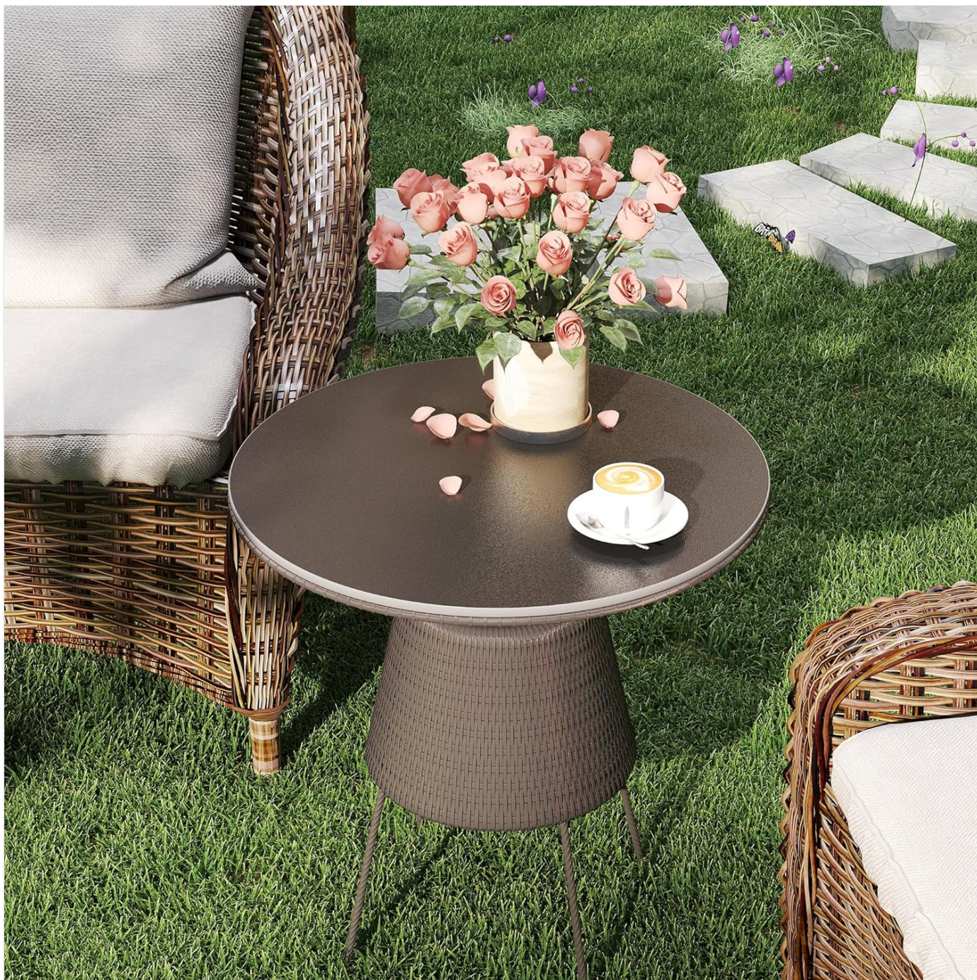
Image: Visual representation of the table top's key features: scratch-resistance, heat-resistance, and ease of cleaning.