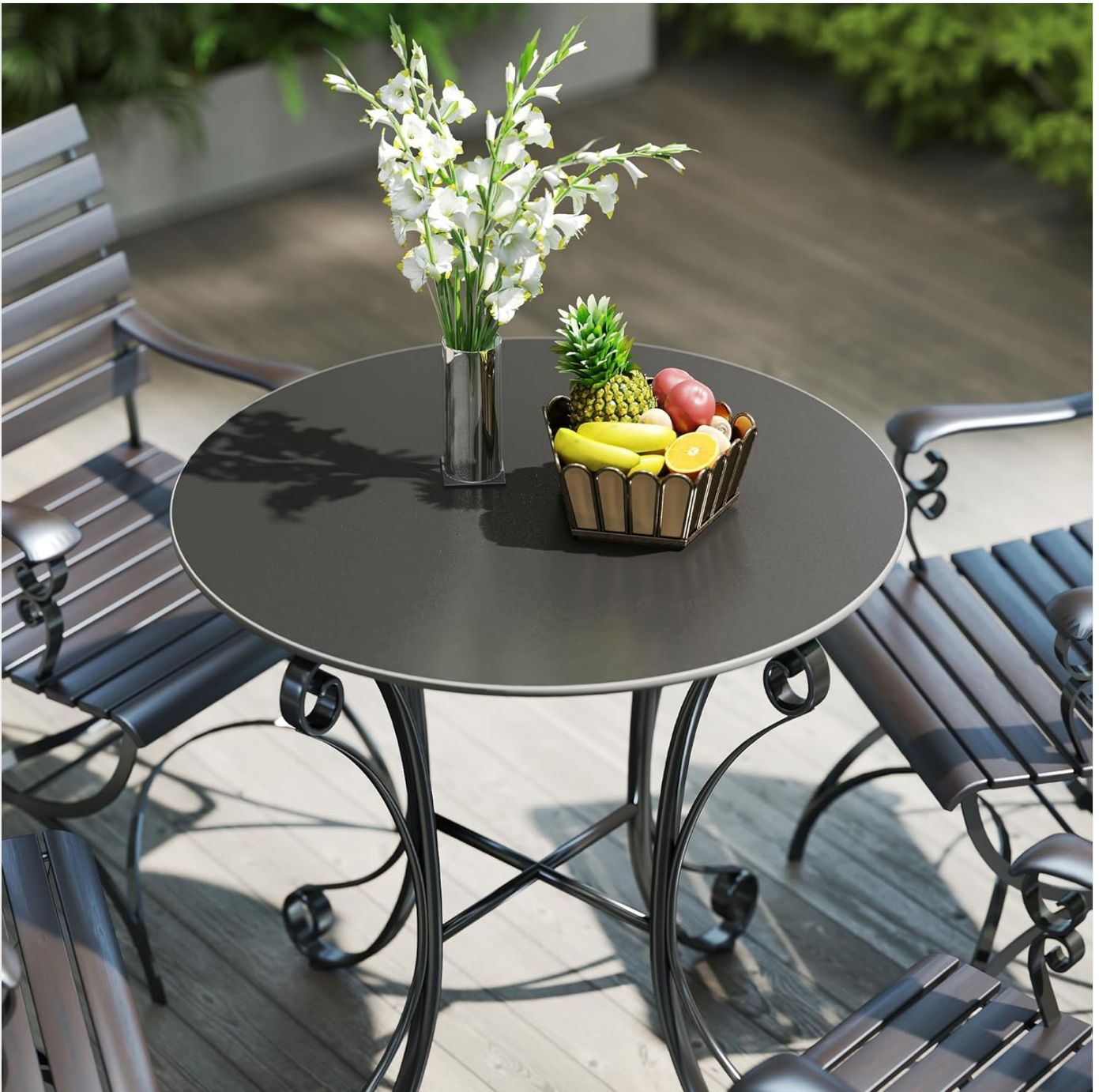
Image: The table top positioned in an outdoor setting, emphasizing its suitability for patios and balconies.