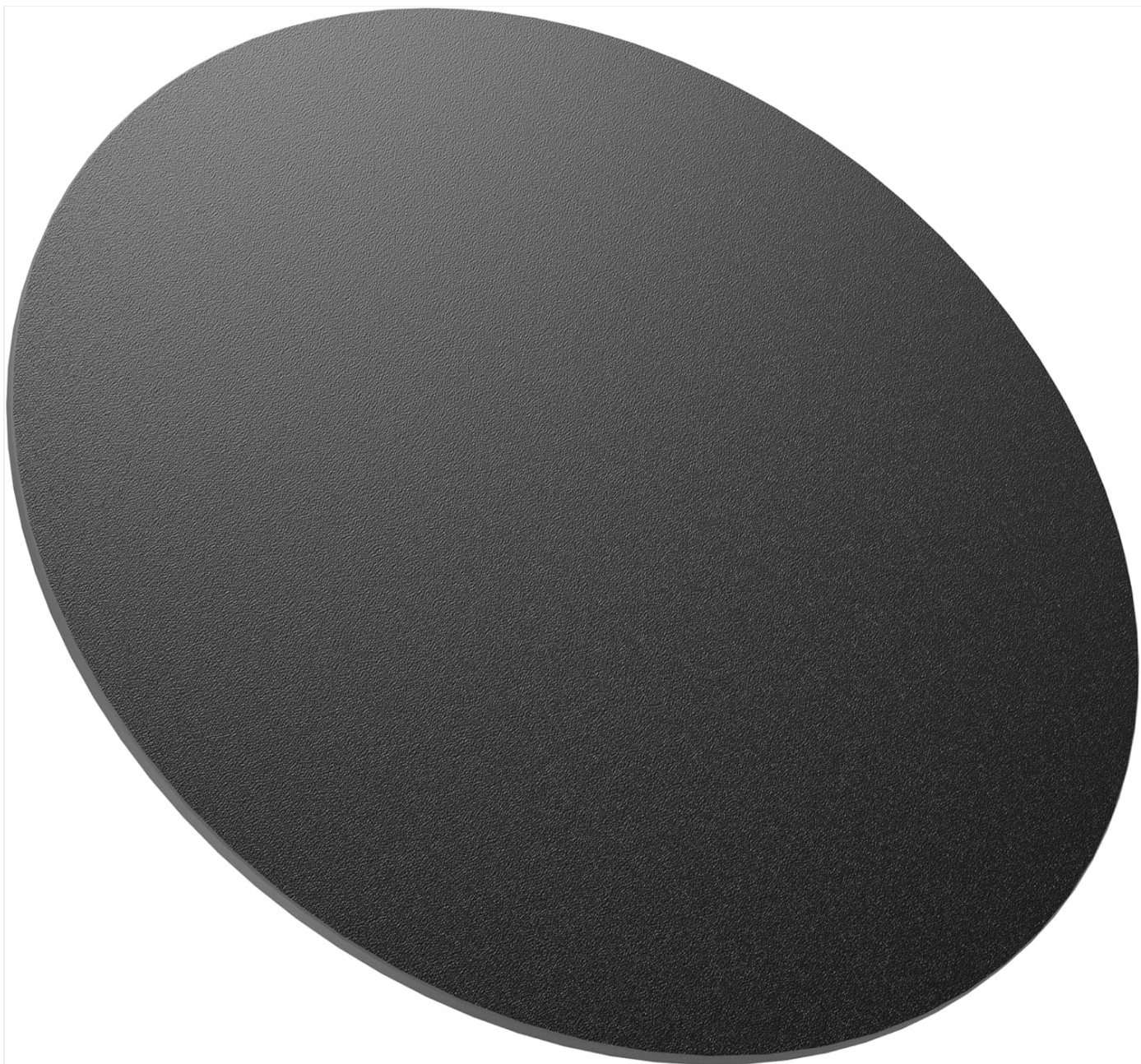
Image: ZL ZELing Round Sintered Stone Table Top, showcasing its sleek design and black finish.