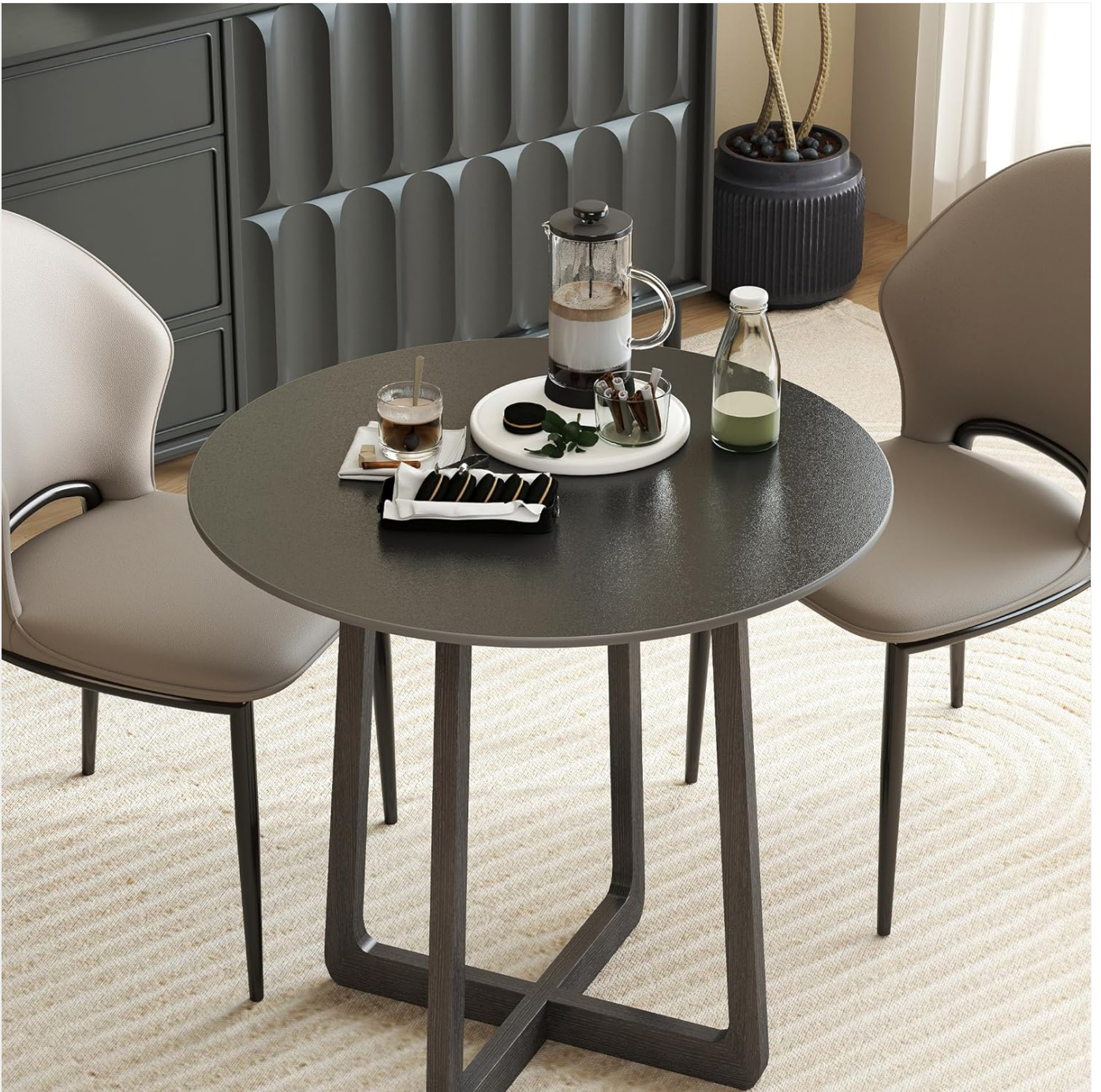
Image: The table top used in a cafe environment, demonstrating its adaptability for commercial spaces.