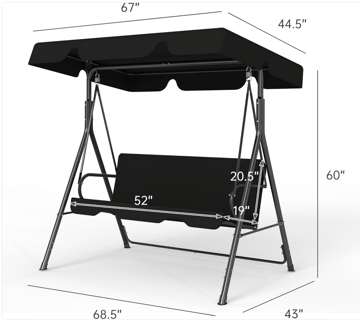
Figure 4.1: This diagram illustrates the overall dimensions of the swing chair, including height, width, and depth, as well as seat and canopy measurements. Refer to these dimensions for placement and space requirements.