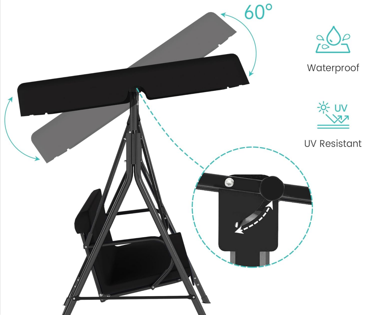
Figure 5.1: The canopy can be adjusted up to 60 degrees to provide optimal shade and protection from sun or light rain. It is made from waterproof and UV-resistant material.