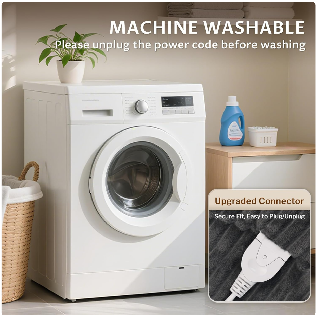
This image shows the electric blanket being washed in a machine, illustrating its easy-care design. A callout highlights the 'Upgraded Connector' for secure fit and easy plug/unplug before washing.