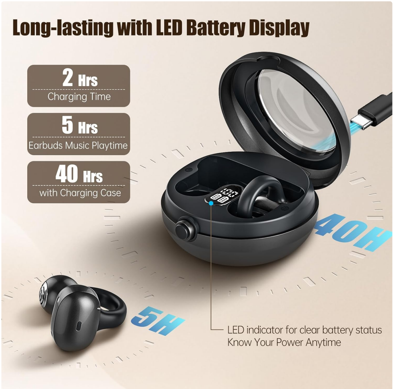
Figure 4.1: Earbuds Charging and Battery Display.

This image illustrates the charging process, showing the Type-C cable connected to the case and the LED display indicating battery status. It also highlights the 2-hour charging time, 5 hours of earbud music playtime, and 40 hours of total playtime with the charging case.