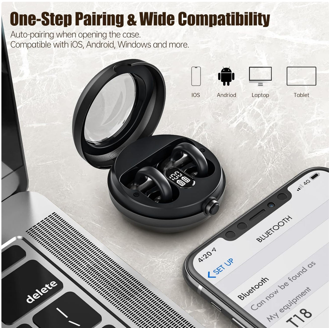
Figure 4.2: One-Step Pairing and Wide Compatibility.

This image demonstrates the automatic pairing process when opening the case and highlights compatibility with iOS, Android, laptops, and tablets.