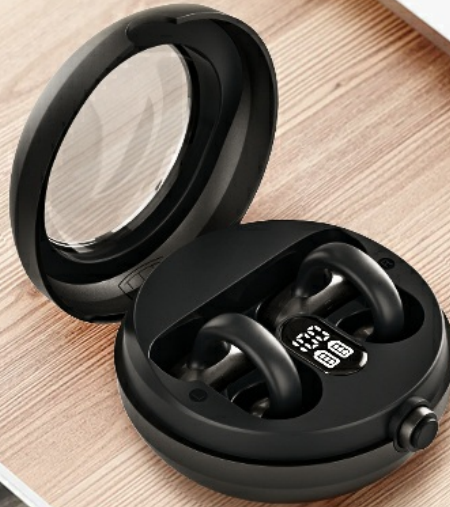
Figure 4.3: How to Wear Clip-On Earbuds.

This image provides a visual guide on how to securely clip the earphone onto the ear and adjust it for a comfortable fit.