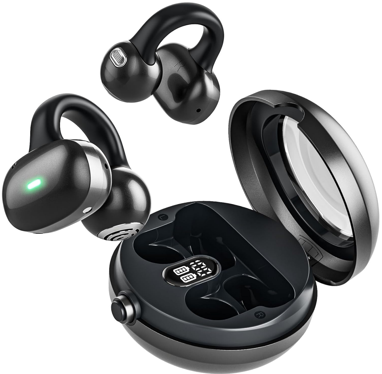
Figure 1.1: Bybyc T18 Clip On Headphones and Charging Case.

This image displays the Bybyc T18 clip-on earbuds alongside their compact charging case, which features an LED digital display for battery status.