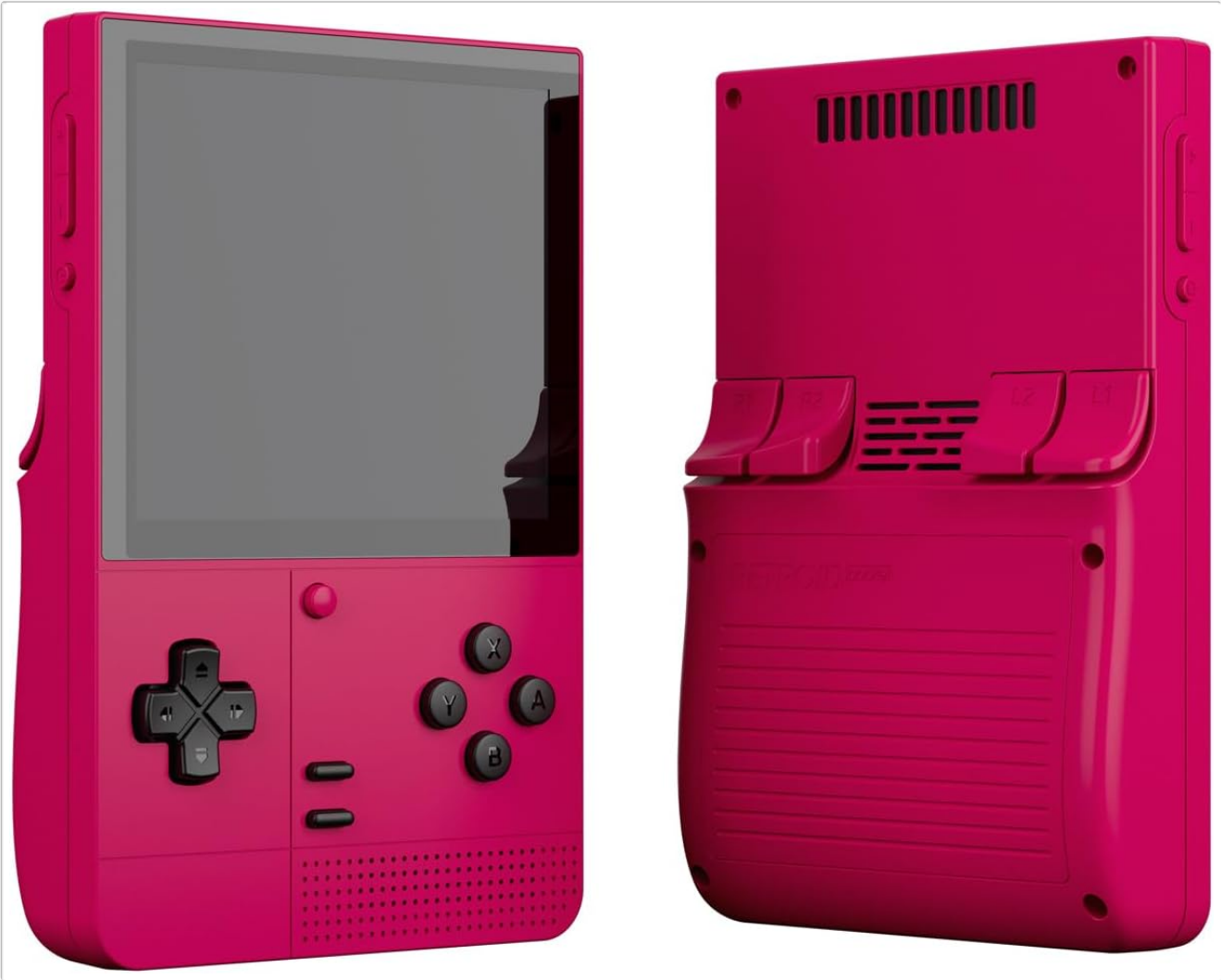
Image: Front view of the Retroid Pocket Classic handheld game console in Berry color, showcasing the screen and controls.

The Retroid Pocket Classic features a compact design with an OLED touchscreen and integrated controls for portable gaming.