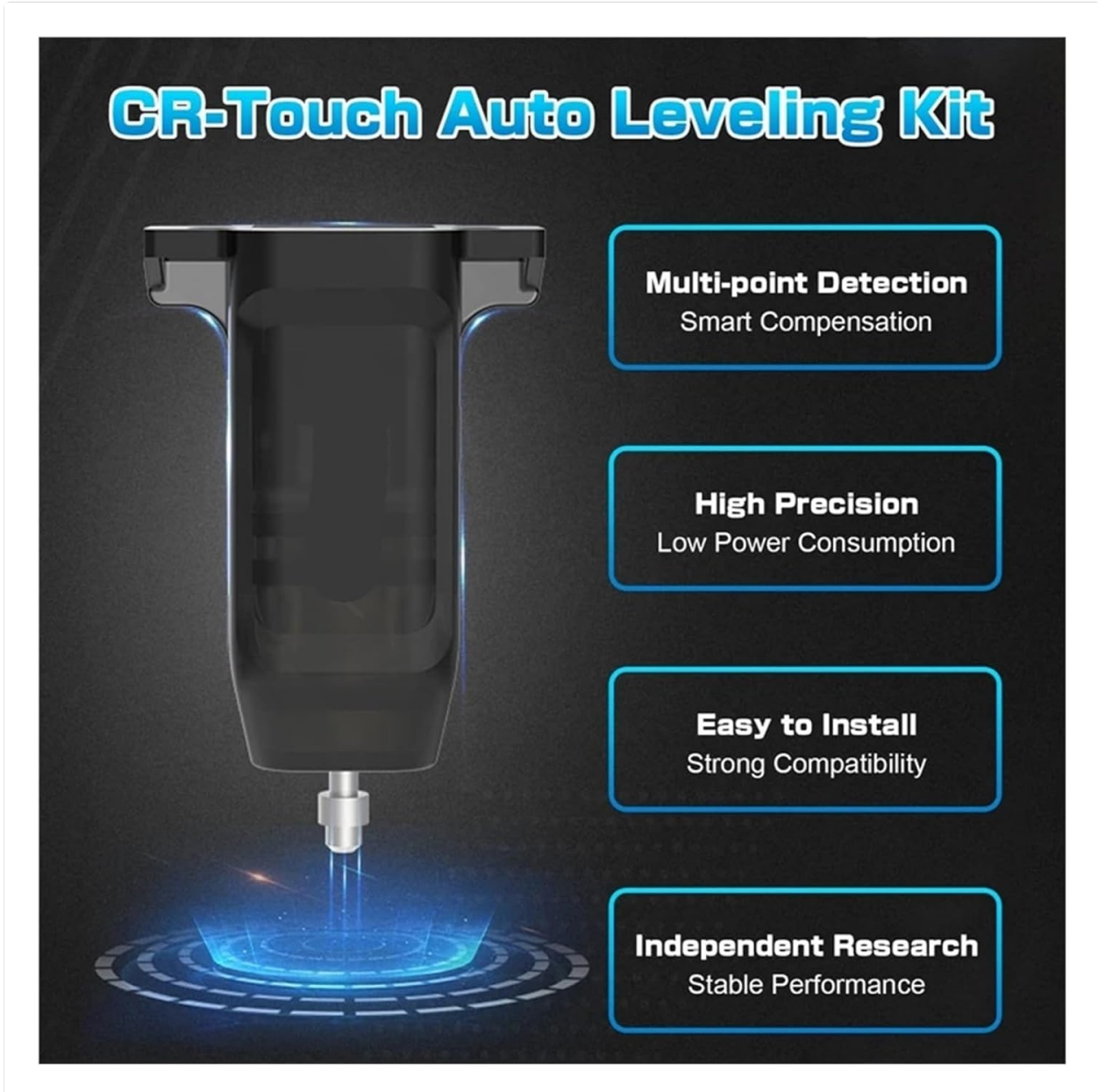
Figure 4.1: CR Touch Features. This image highlights key features of the CR Touch Auto Leveling Kit, including multi-point detection for smart compensation, high precision with low power consumption, ease of installation, and stable performance due to independent research and development.