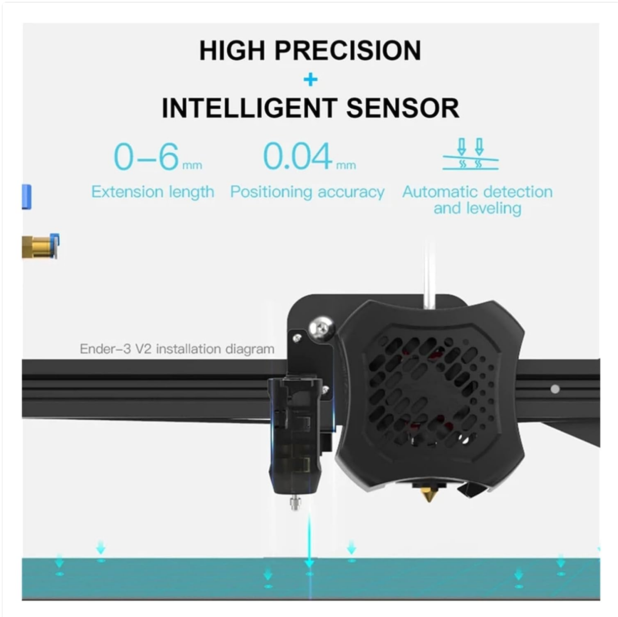
Figure 5.1: Durable Metal Probe. The CR Touch sensor features an upgraded metal probe, designed for enhanced stability and a service life exceeding 100,000 uses, offering superior durability compared to plastic probes.

The CR Touch sensor is designed for durability and requires minimal maintenance. Its metal probe ensures a long service life.