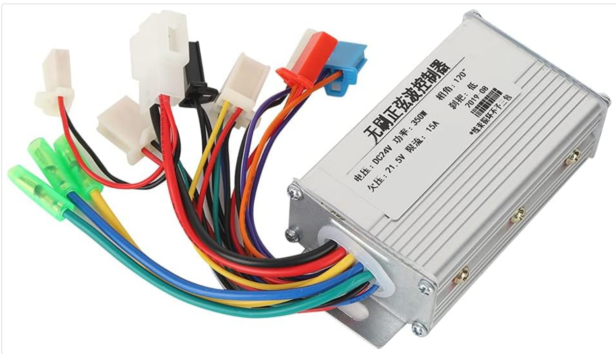
Figure 3.2: Angled view of the controller, highlighting the product label with technical details.