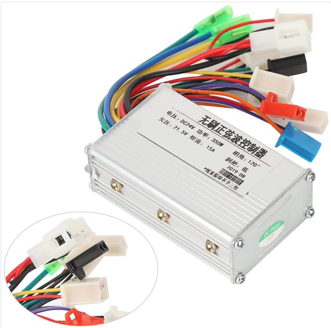
Figure 4.2: Detailed view of the various connectors for power, motor, and sensors.