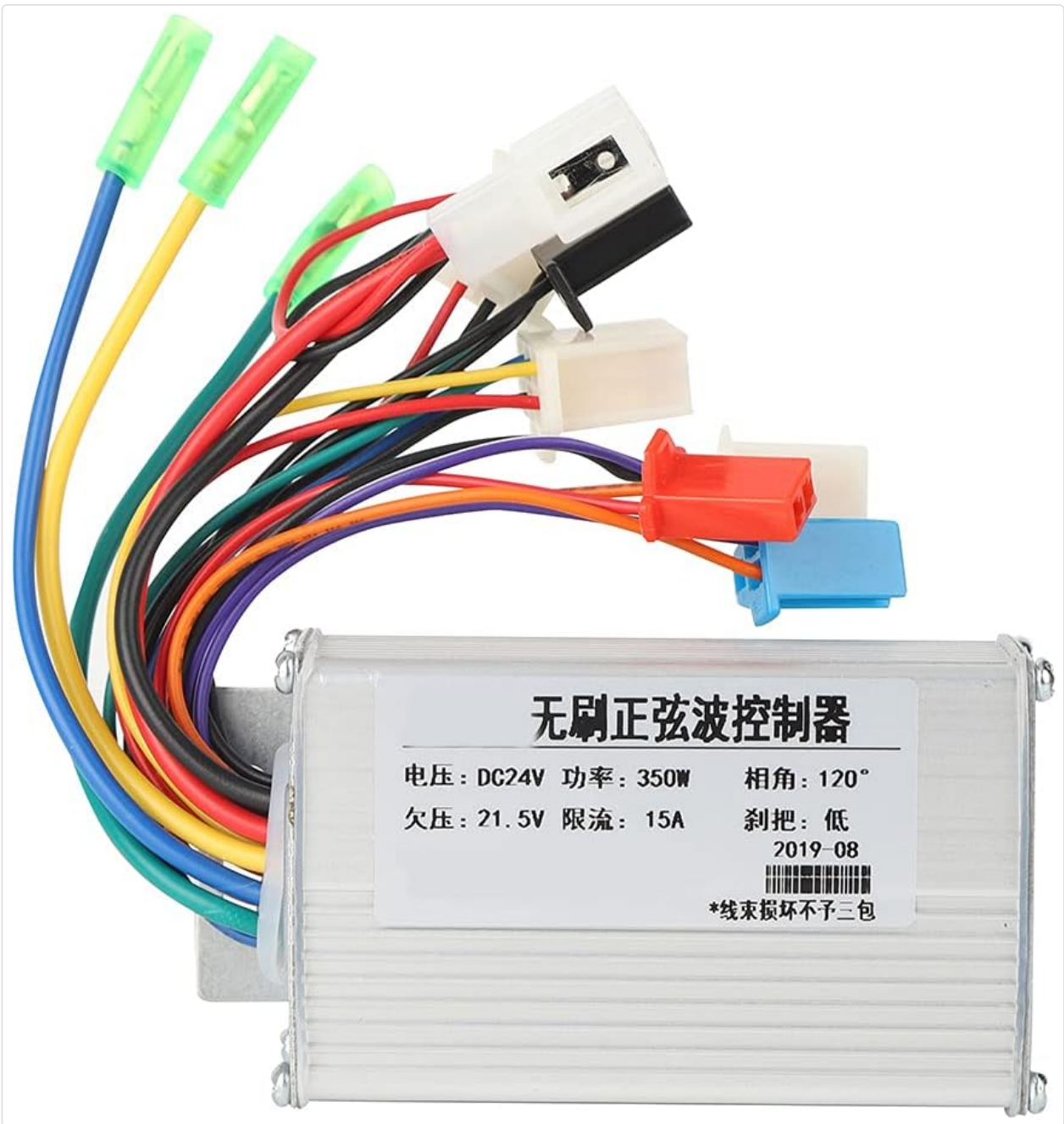
Figure 4.1: Top view illustrating the wire connections for installation.