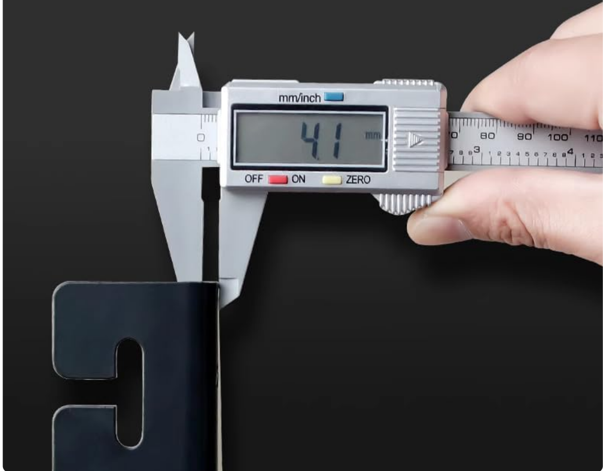
Image 4.2: Close-up of a bracket being measured, indicating its robust construction.

Provide dedicated brackets made of thickened carbon steel material, capable of bearing over 650 pounds