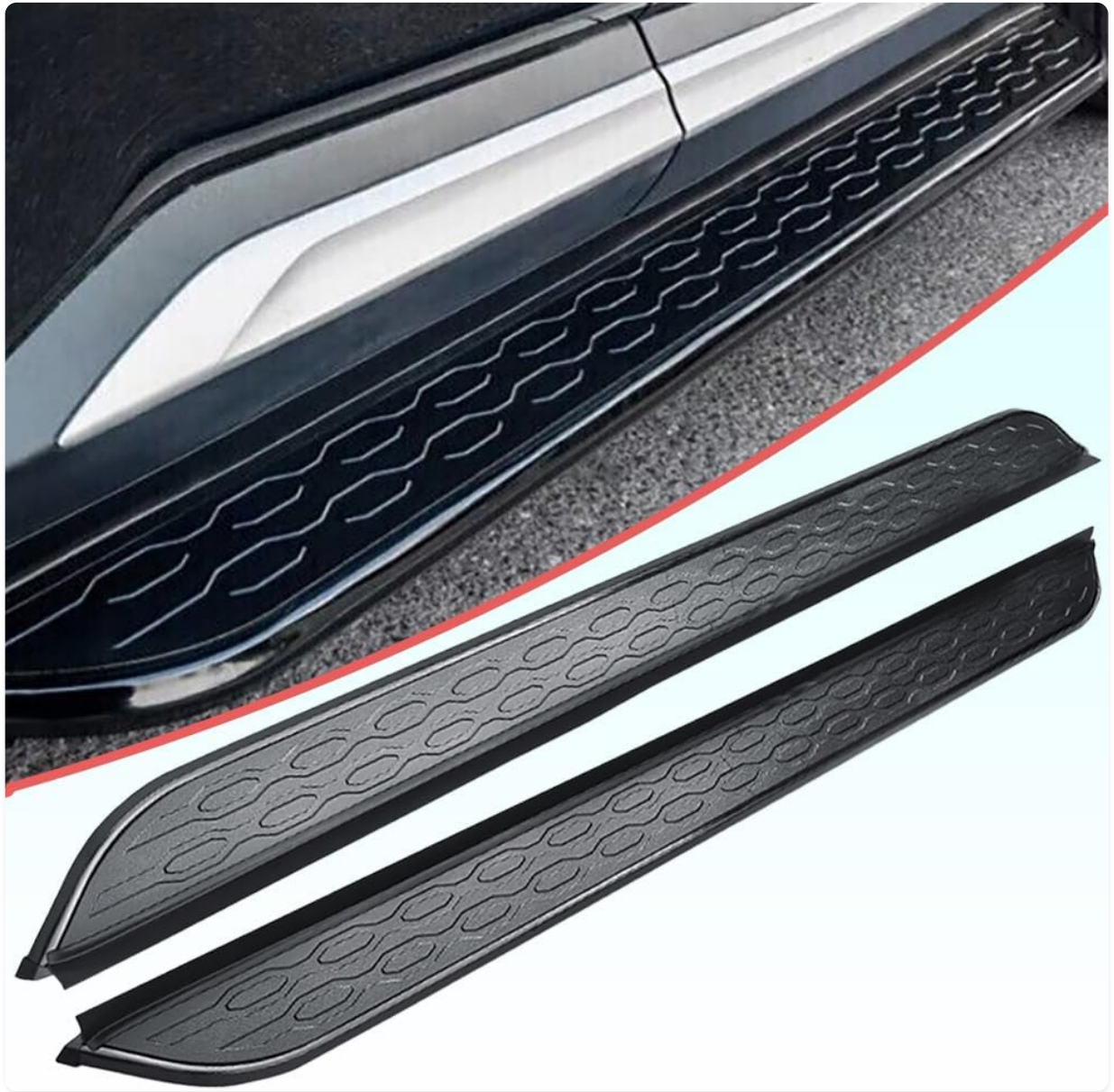
Image 2.1: Yuvezna Side Step Running Board installed on a Ford Ranger, showcasing its integrated appearance.