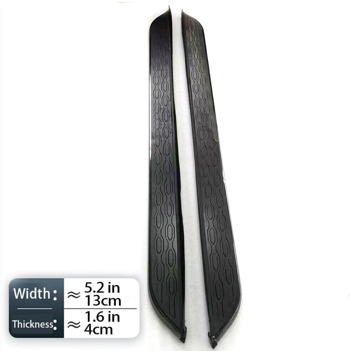
Image 4.1: Visual representation of the running board's approximate width and thickness.