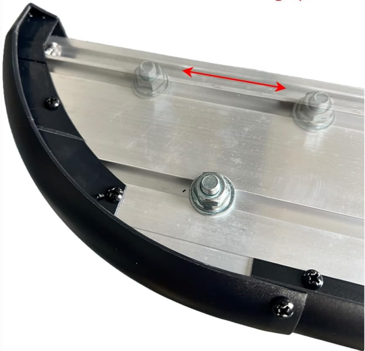
Image 5.1: Detail of the no-drill track mounting system, showing how bolts slide for adjustment.