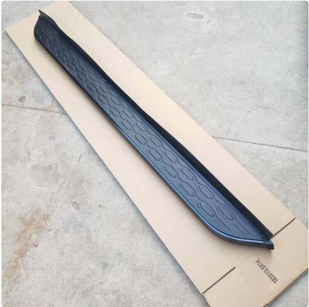
Image 3.1: One of the running boards as it appears in its packaging.