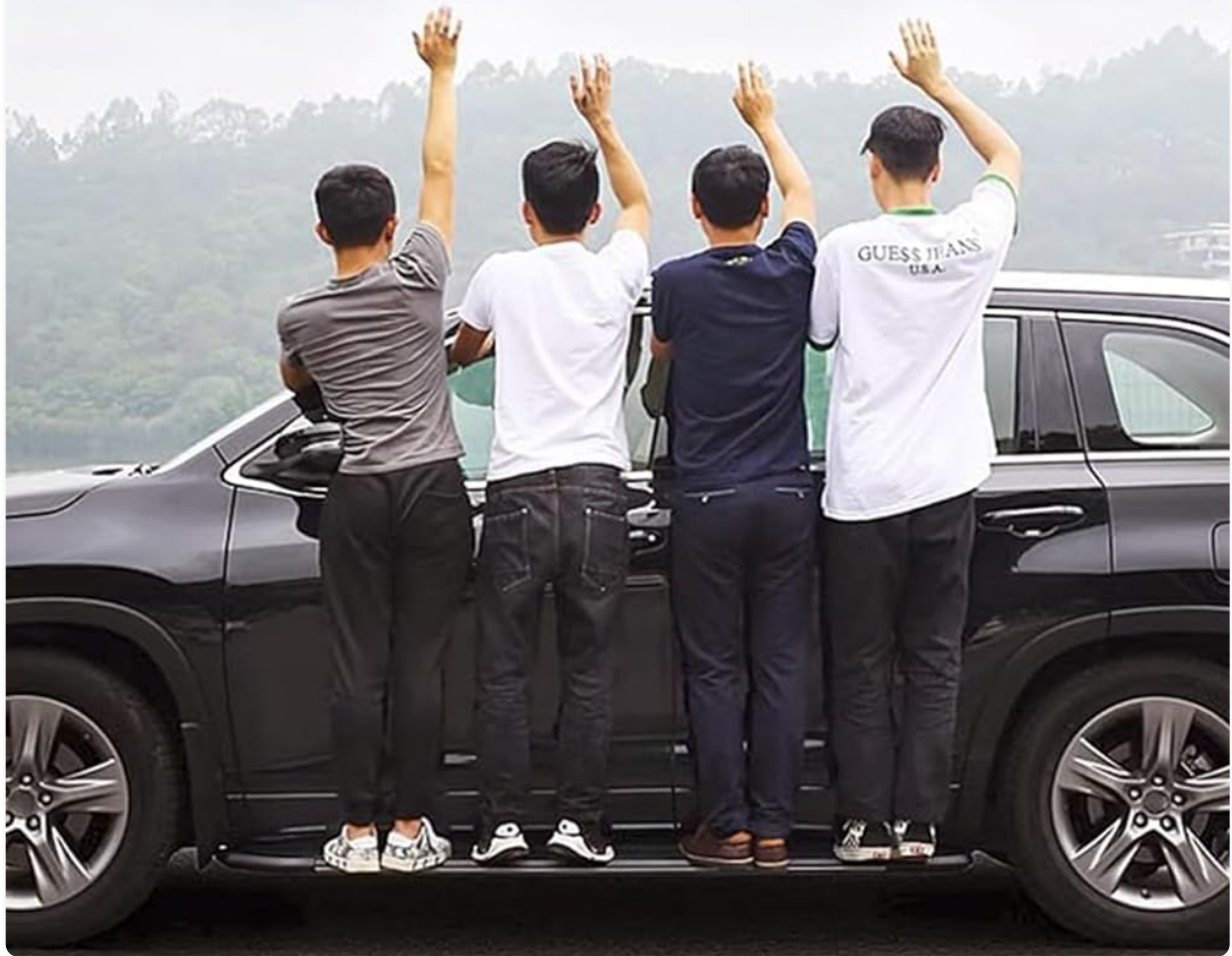
Image 2.2: Four individuals standing on the running board, illustrating its high load-bearing capacity.

High quality aluminum alloy materials can carry more than 500 pounds