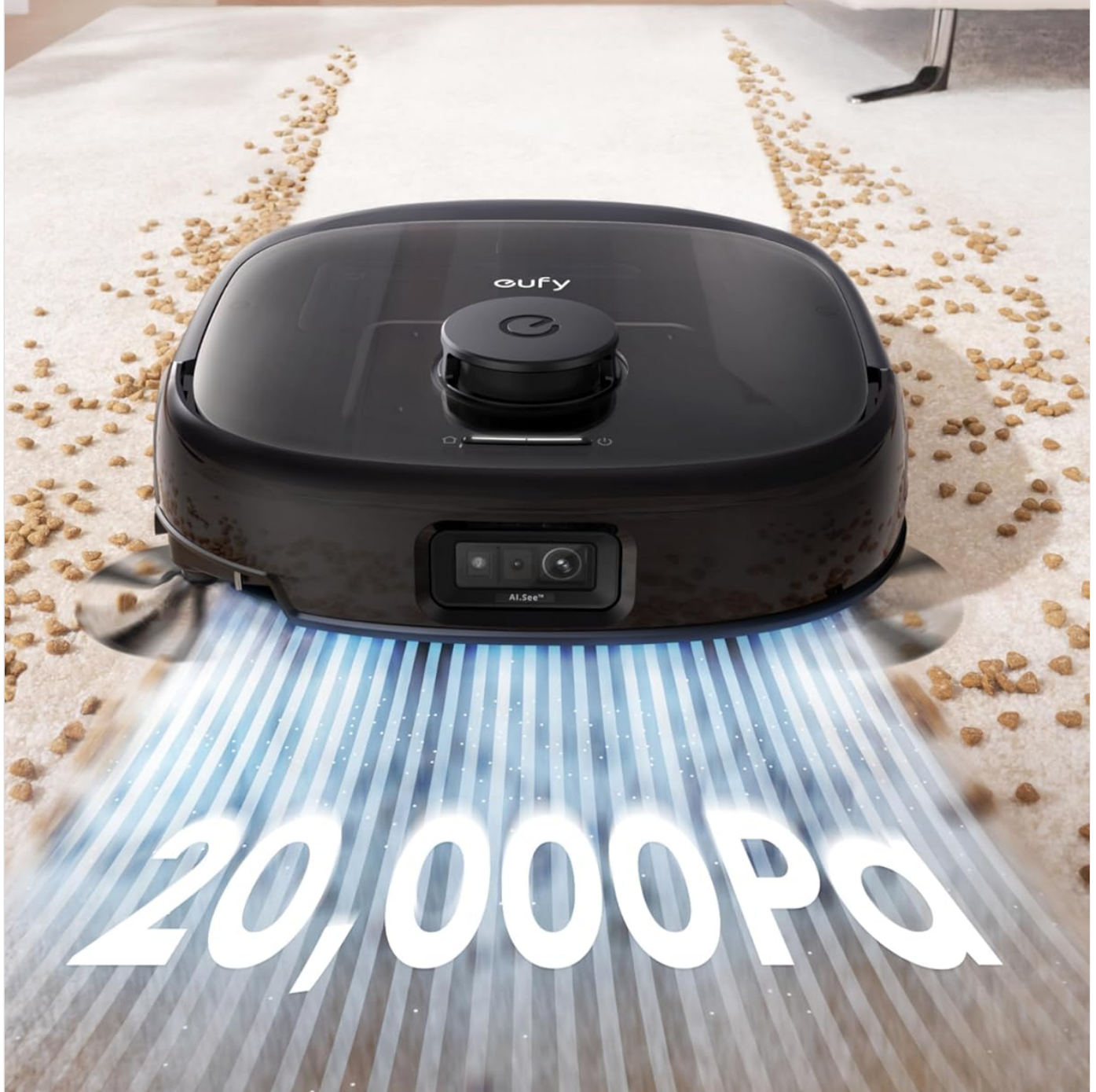
Figure 4: The eufy Omni E25 utilizing its 20,000 Pa Turbo Suction for effective debris removal.