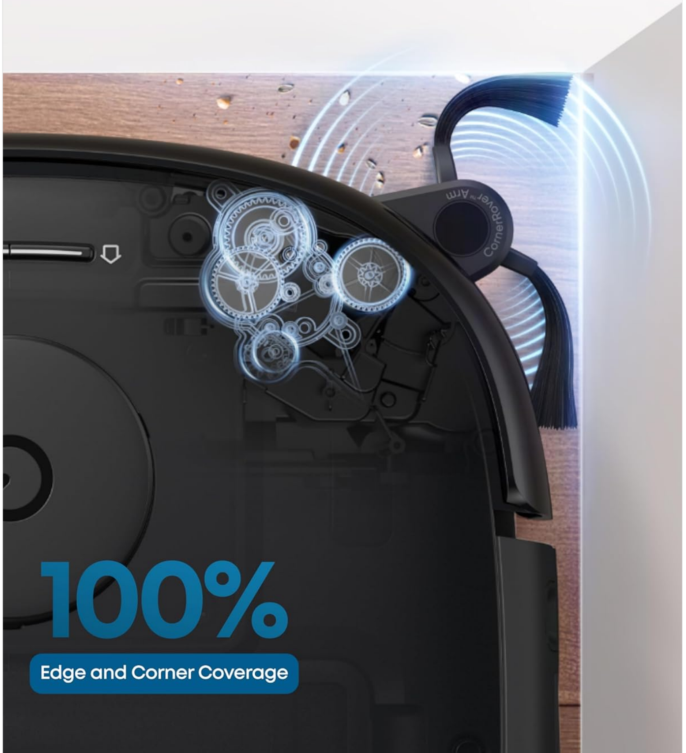
Figure 6: The CornerRover Arm ensuring complete edge and corner coverage.