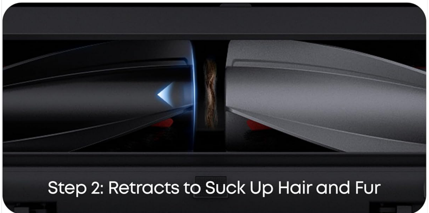
Figure 5: Illustration of the DuoSpiral Detangle Brushes, designed for zero tangling.