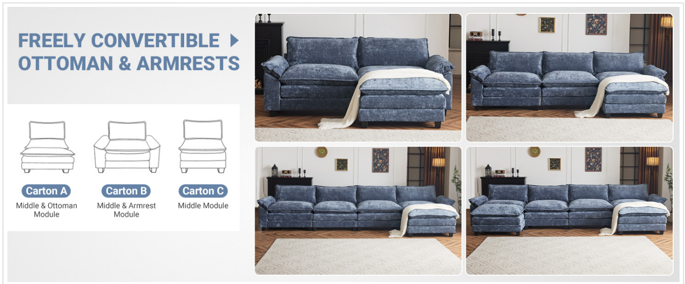
Figure 3.1: Freely Convertible Ottoman & Armrests Configurations

This image demonstrates the high degree of modularity offered by the VINGLI sofa. It shows how the different module types (Carton A, B, C) can be combined and rearranged to form various sofa layouts, including L-shaped sectionals and extended seating arrangements, highlighting the flexibility of the design.