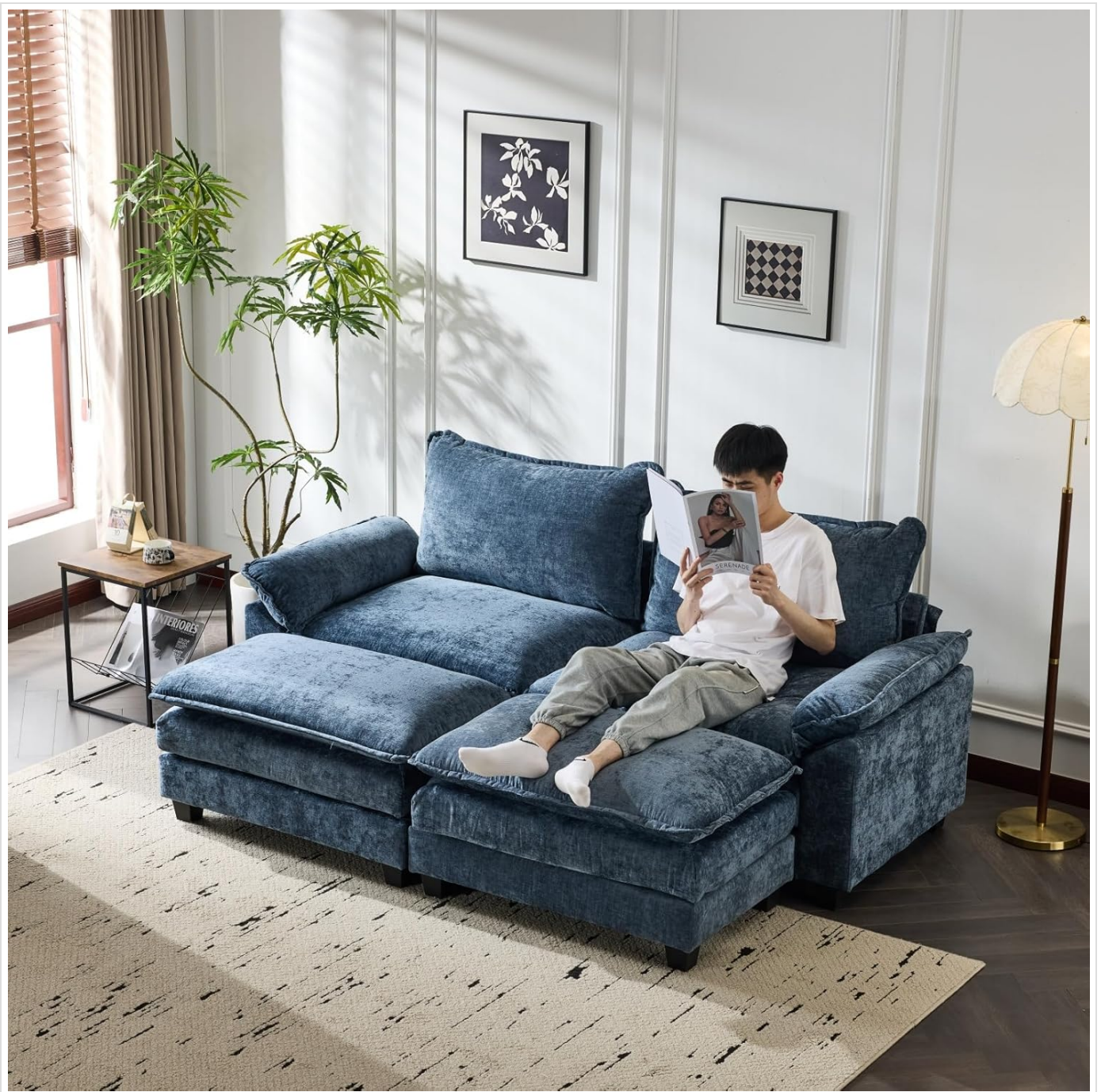
Figure 3.3: Lazy Recline Design for Ultimate Relaxation

This image illustrates the ergonomic "lazy recline design" of the VINGLI sofa, showing how the seat and back angle provide optimal support for the neck, lumbar, hips, and legs, ensuring ultimate relaxation for the user.