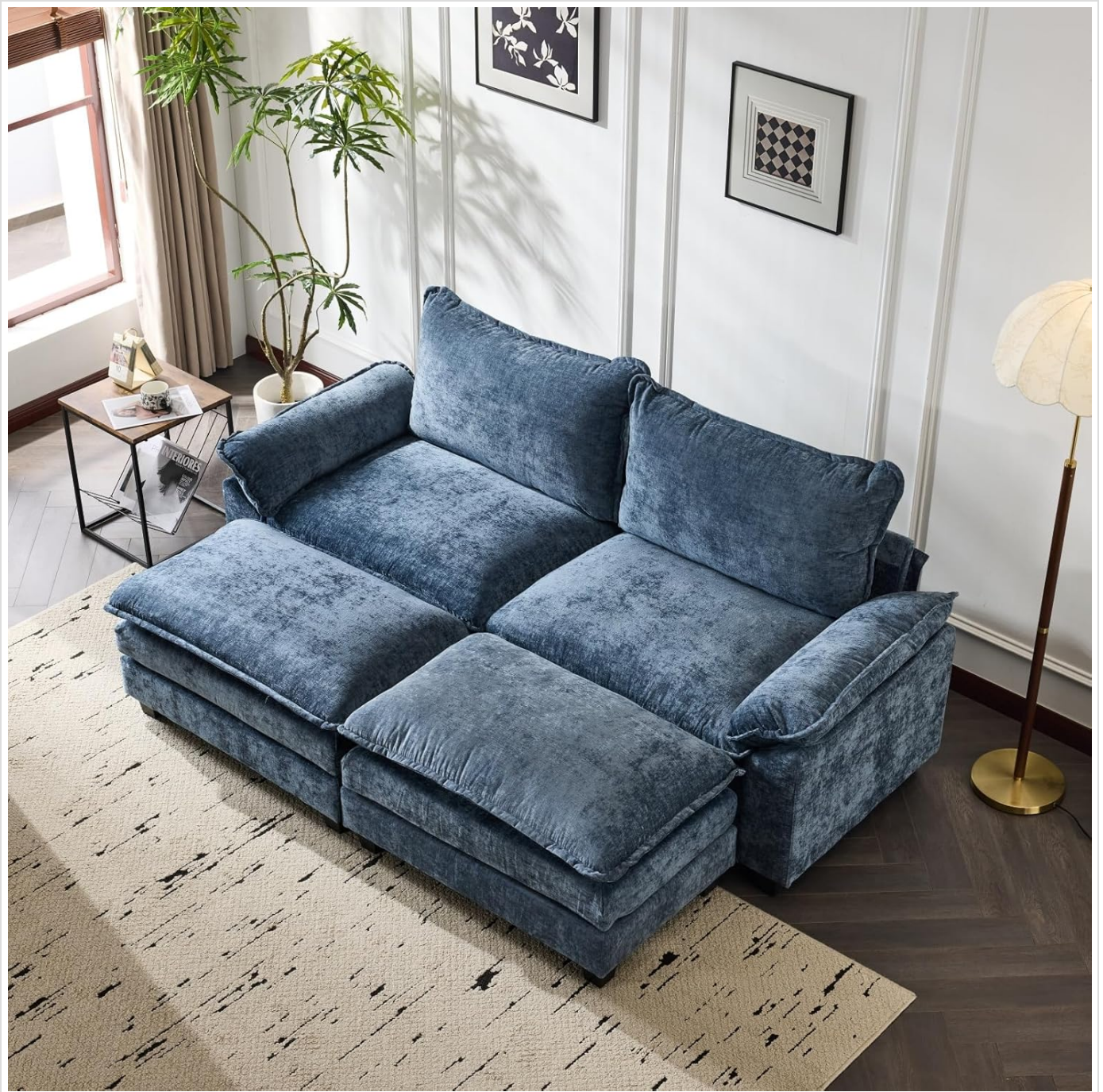
Figure 2.2: Fully Assembled Sofa Configuration Example

This image displays a common configuration of the VINGLI Convertible Sectional Sofa after assembly, featuring two main seating sections and two movable ottomans. This setup demonstrates how the modular components can be arranged to create a comfortable and functional living space.