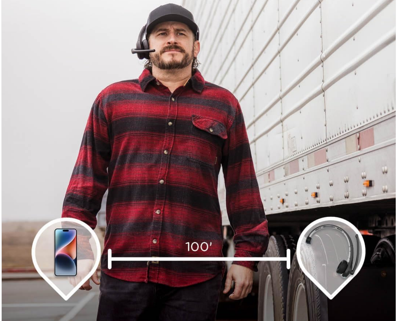
Image: A man wearing the RoadWarrior RW1 headset stands approximately 100 feet away from his phone, demonstrating the wireless range.