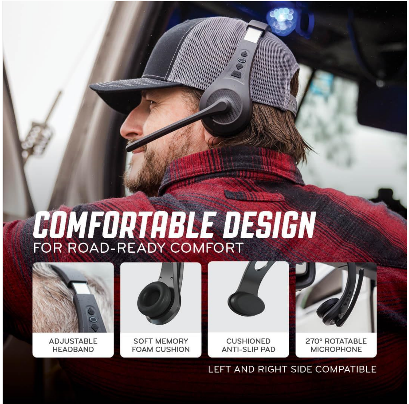
Image: A man wearing the RoadWarrior RW1 headset, showcasing its comfortable design and adjustable microphone for left or right ear use.

The RW1 headset is designed for comfort and versatility. The microphone boom can rotate 270 degrees, allowing you to wear the headset on either your left or right ear. Adjust the headband for a snug yet comfortable fit.