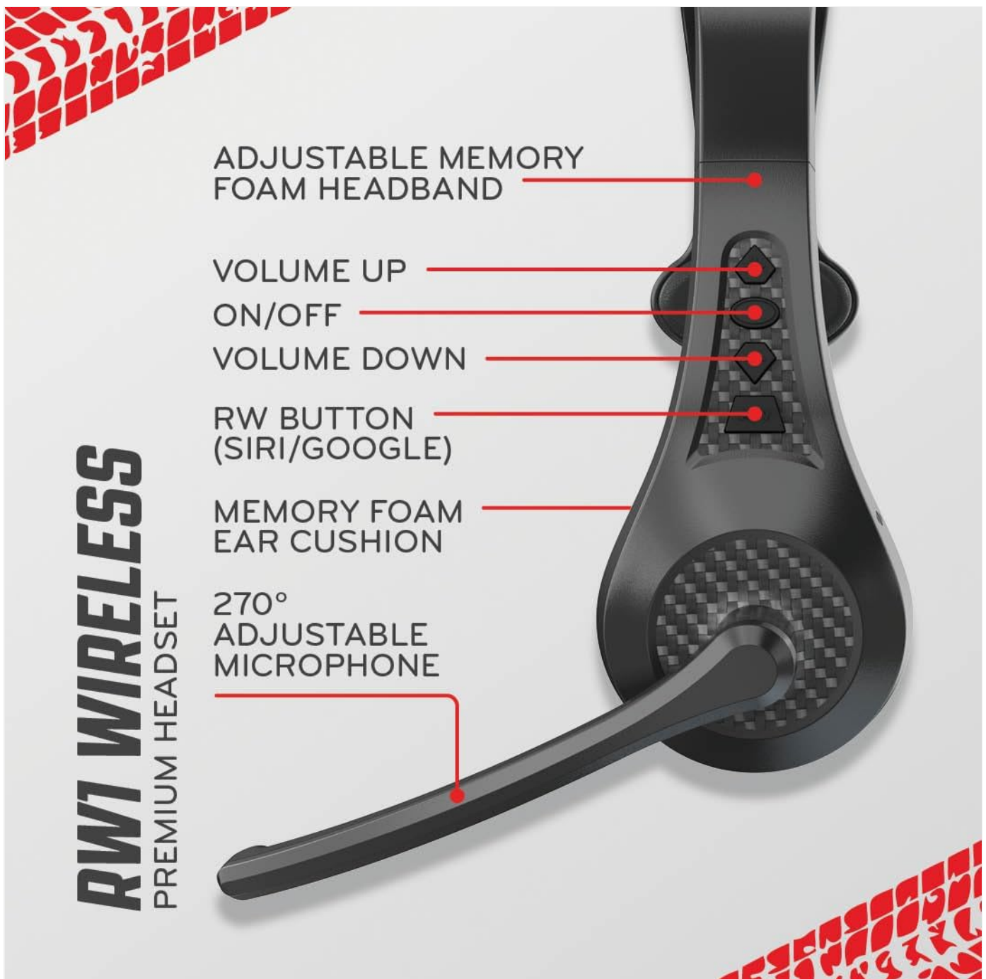
Image: RoadWarrior RW1 Headset with labeled controls. This image highlights the adjustable memory foam headband, volume up/down buttons, on/off button, RW button (for Siri/Google Assistant), memory foam ear cushion, and the 270° adjustable microphone.