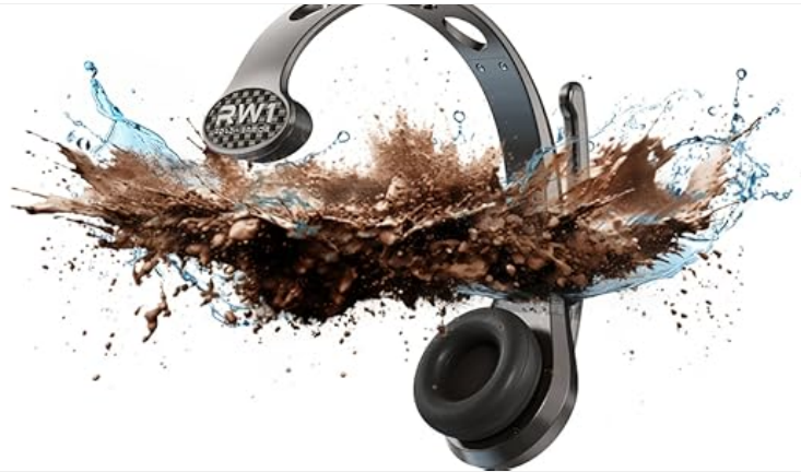
Image: RoadWarrior RW1 headset shown with water splashes and dust, illustrating its IP54 dust and water resistant rating.

With an IP54 rating, this device is fully dust-proof and splash-resistant, offering reliable protection in tough environments. Ideal for outdoor or rugged use, it's built to keep going where other devices might fail.