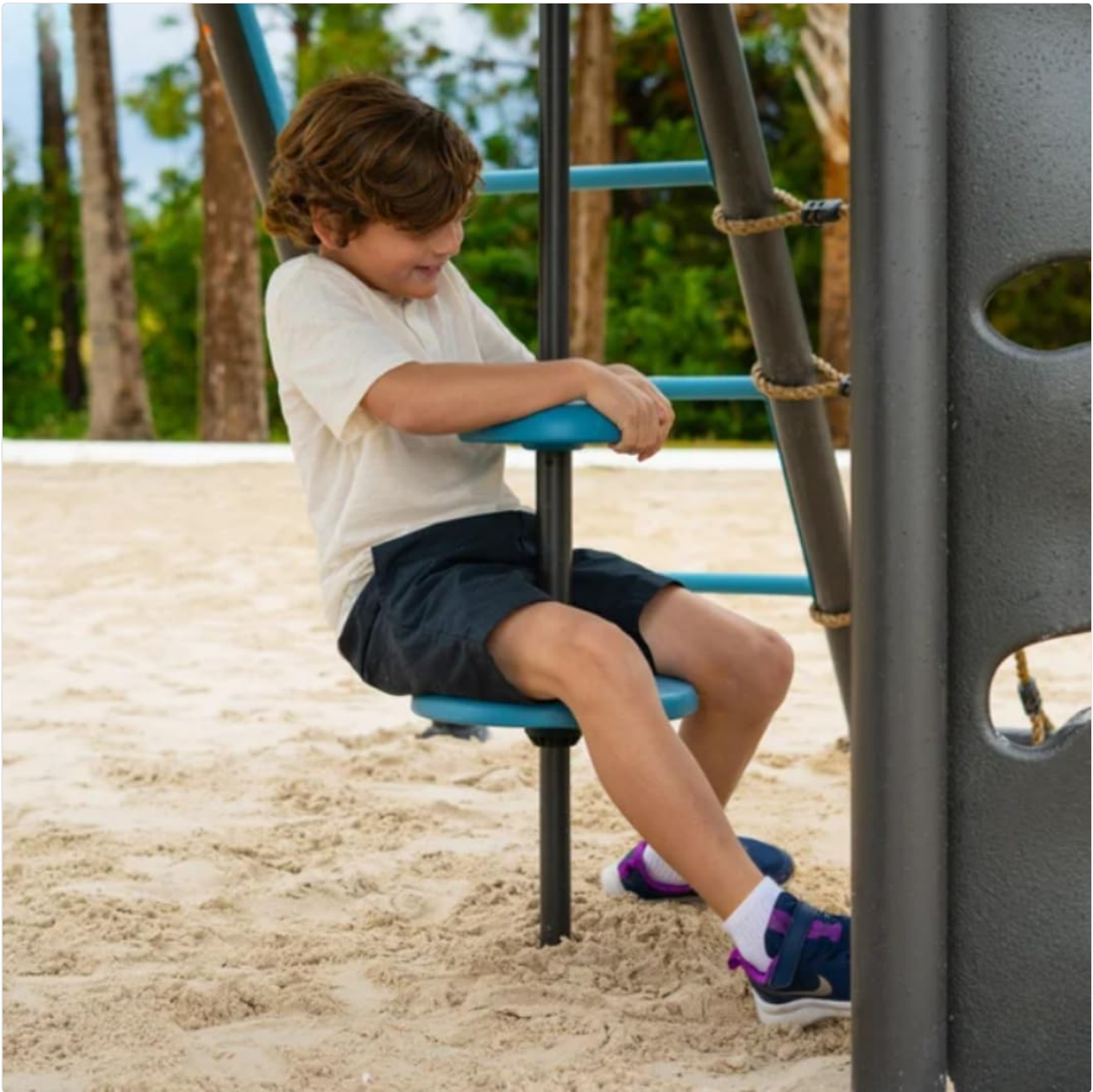
Figure 7: Child on the mini go-round swing.