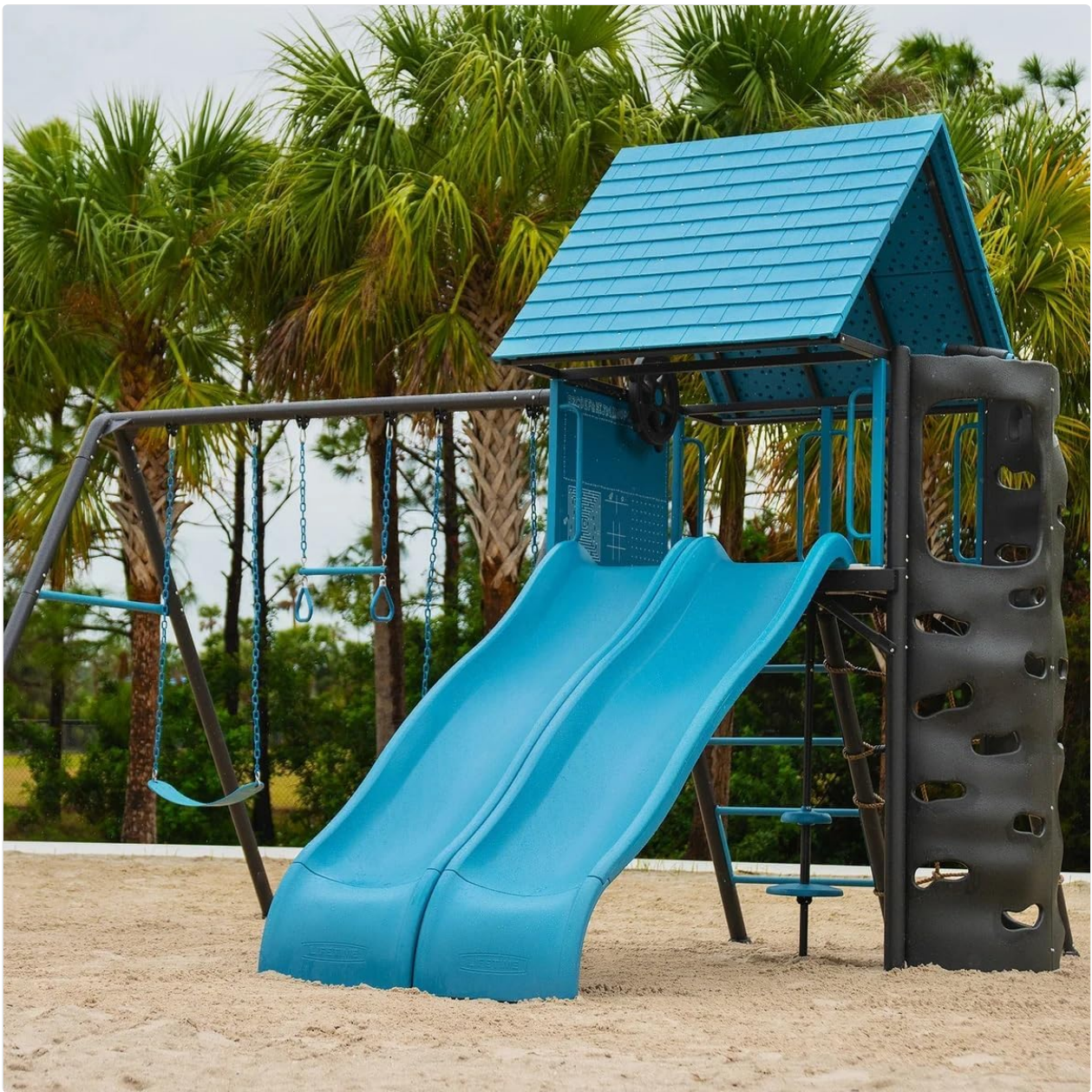
Figure 1: Fully assembled Lifetime 91382 Big Stuff Adventure Clubhouse Double Slide.