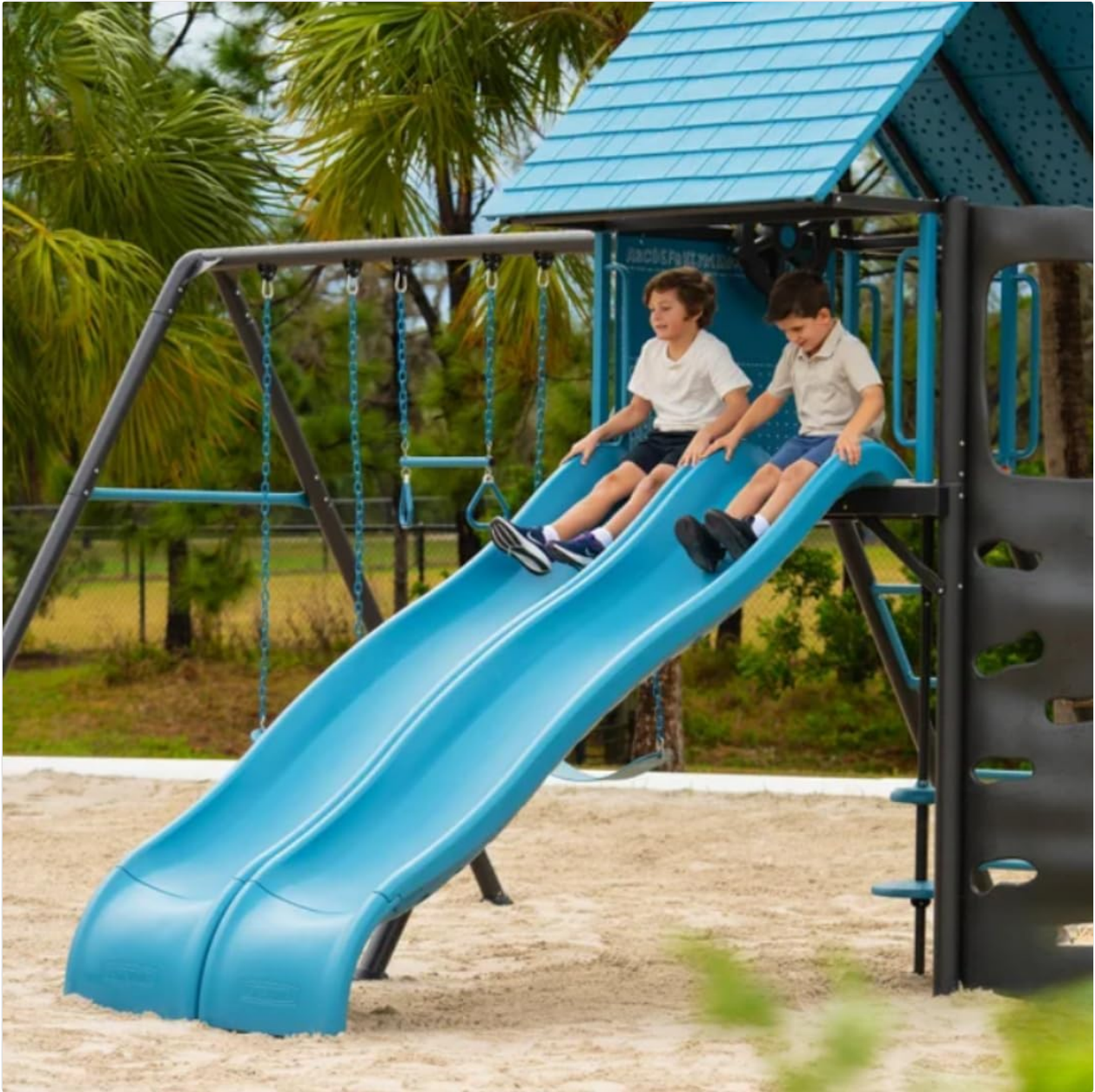
Figure 5: Children using the double wavy slides.

The playset features two 9-foot wavy slides. Children should slide feet first, one at a time, and ensure the landing area is clear before descending.