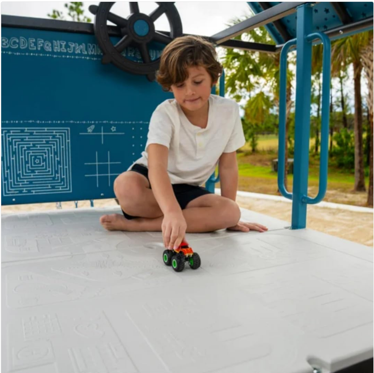
Figure 8: Child engaging in imaginative play on the clubhouse platform.