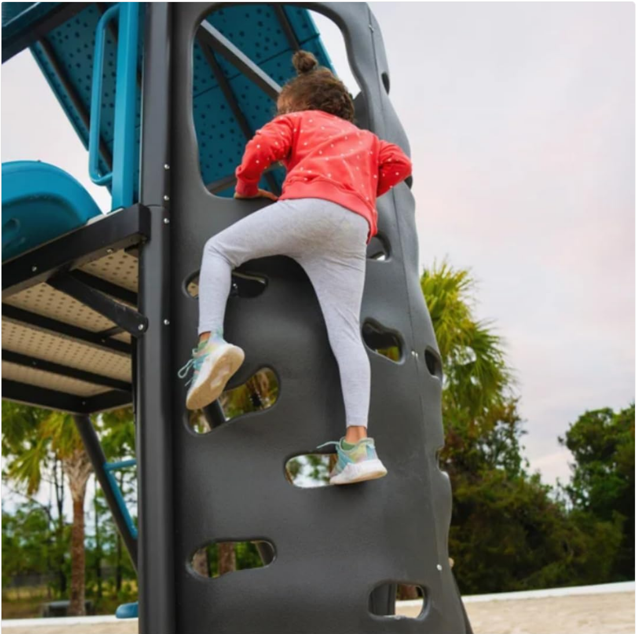
Figure 2: Alternate view highlighting the climbing wall and swing set components.