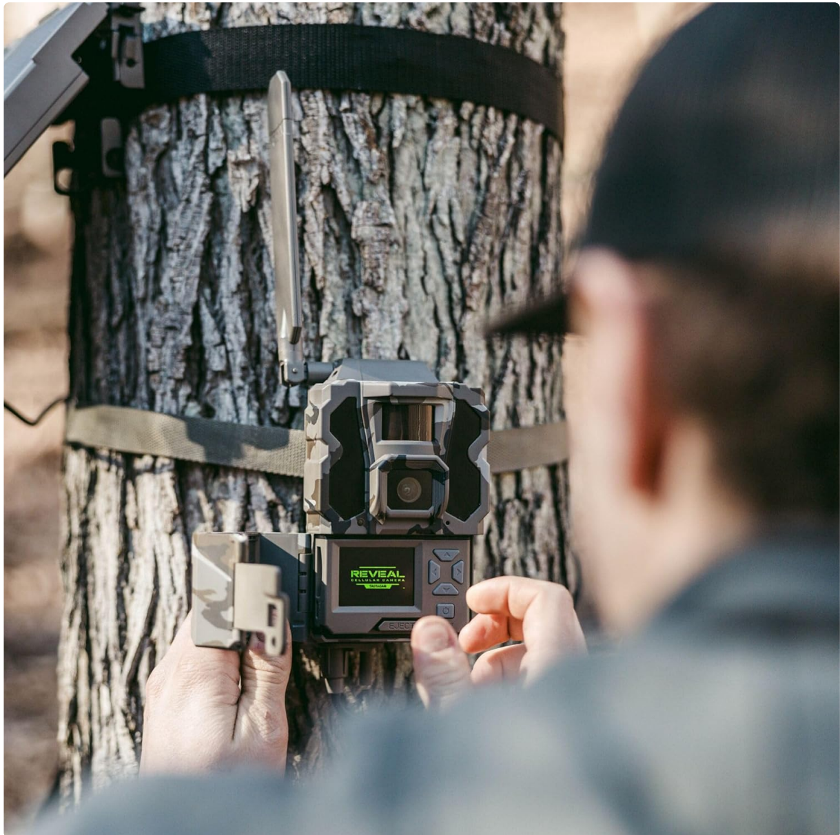
Image: Connecting the TACTACAM Battery Belt to the camera.