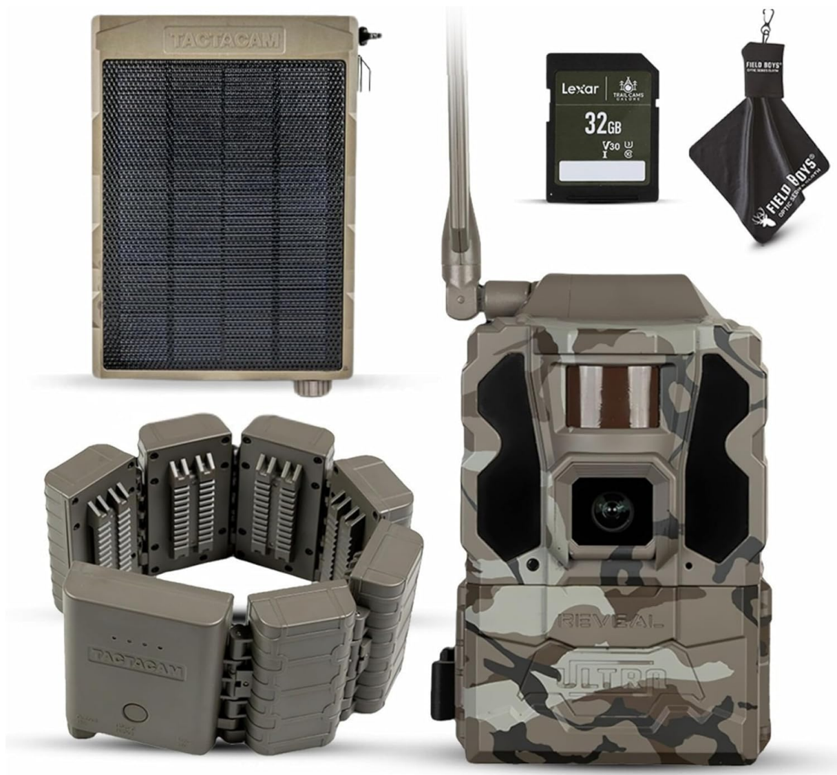
Image: TACTACAM Reveal Ultra camera with solar panel, battery belt, SD card, and cleaning cloth.