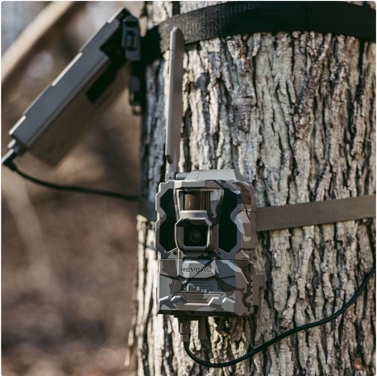
Image: TACTACAM Reveal Ultra camera with solar panel for continuous power.