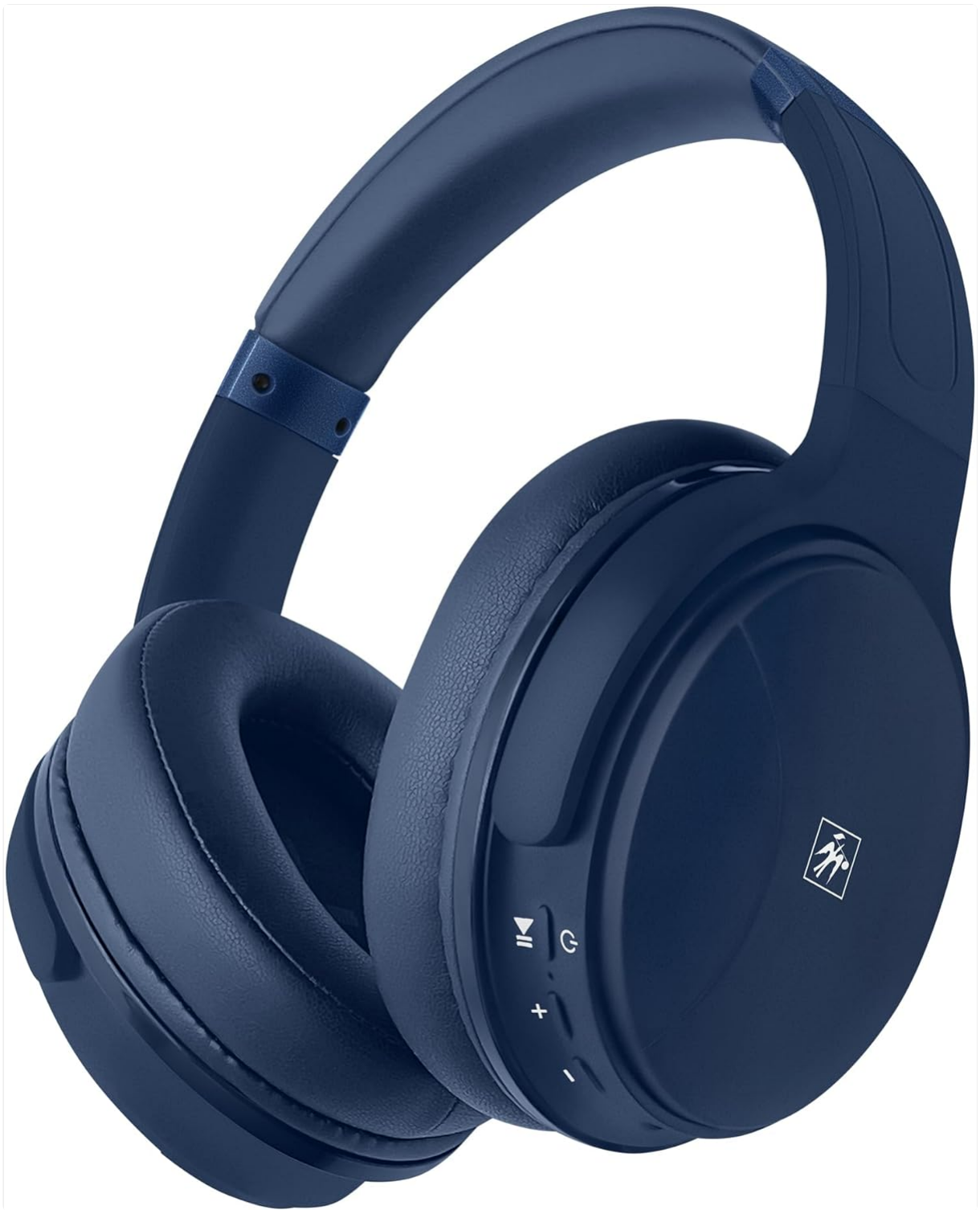
Image 1.1: Fisher Pro Active Noise Cancelling Headphones (Navy Blue)

This image displays the Fisher Pro Active Noise Cancelling Headphones in Navy Blue, showcasing their over-ear design and sleek finish.