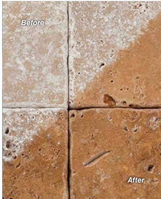
Image 5.1: Visual comparison of tile and grout before and after cleaning with the product.