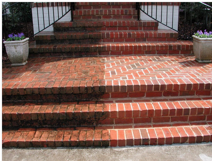
Image 5.3: A visual comparison showing brick stairs before and after cleaning, demonstrating the product's effectiveness on masonry.