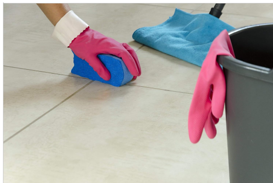
Image 5.2: A person wearing pink gloves cleaning tile grout with a blue sponge and the cleaner.