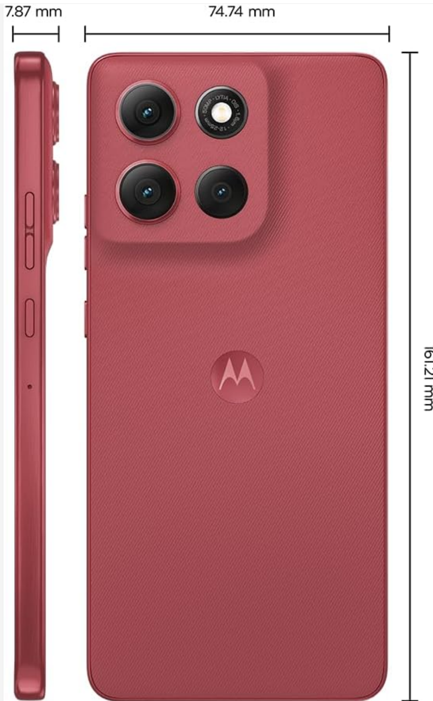
Figure 7.1: Dimensional diagram of the Motorola Moto g86 5G, showing height, width, and thickness measurements.