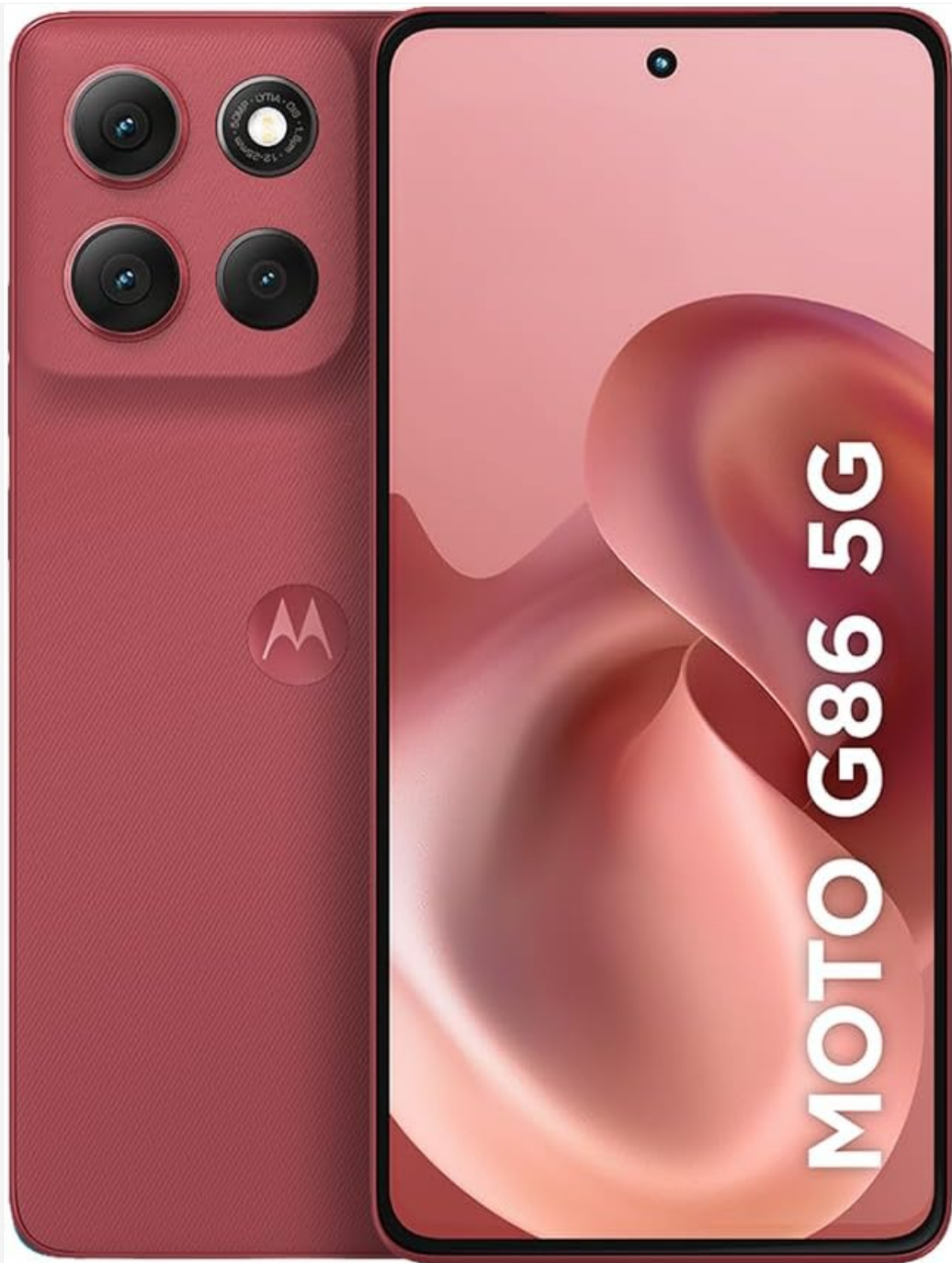
Figure 2.1: Front and back view of the Motorola Moto g86 5G smartphone, showcasing its sleek design and camera module.