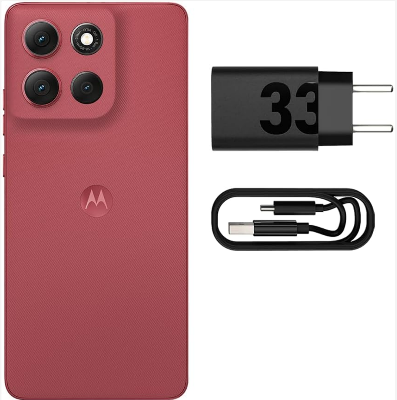
Figure 3.1: The Motorola Moto g86 5G smartphone alongside its 33W TURBOPOWER charger and USB-A to USB-C cable.