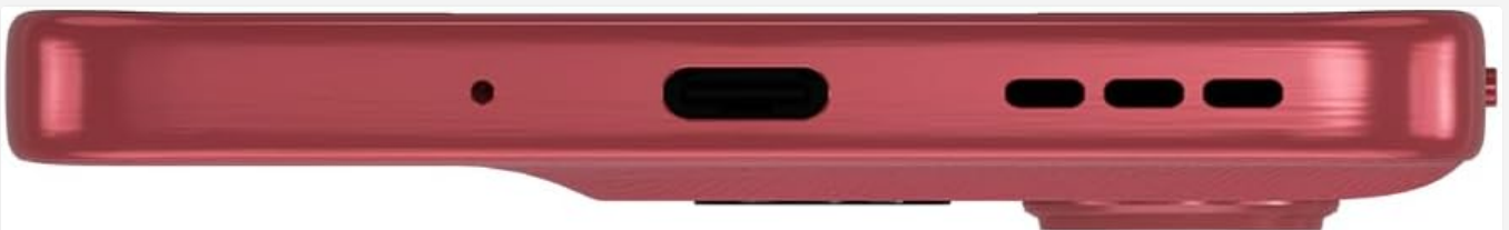
Figure 2.4: Bottom view of the device, illustrating the USB-C charging port and speaker grille.