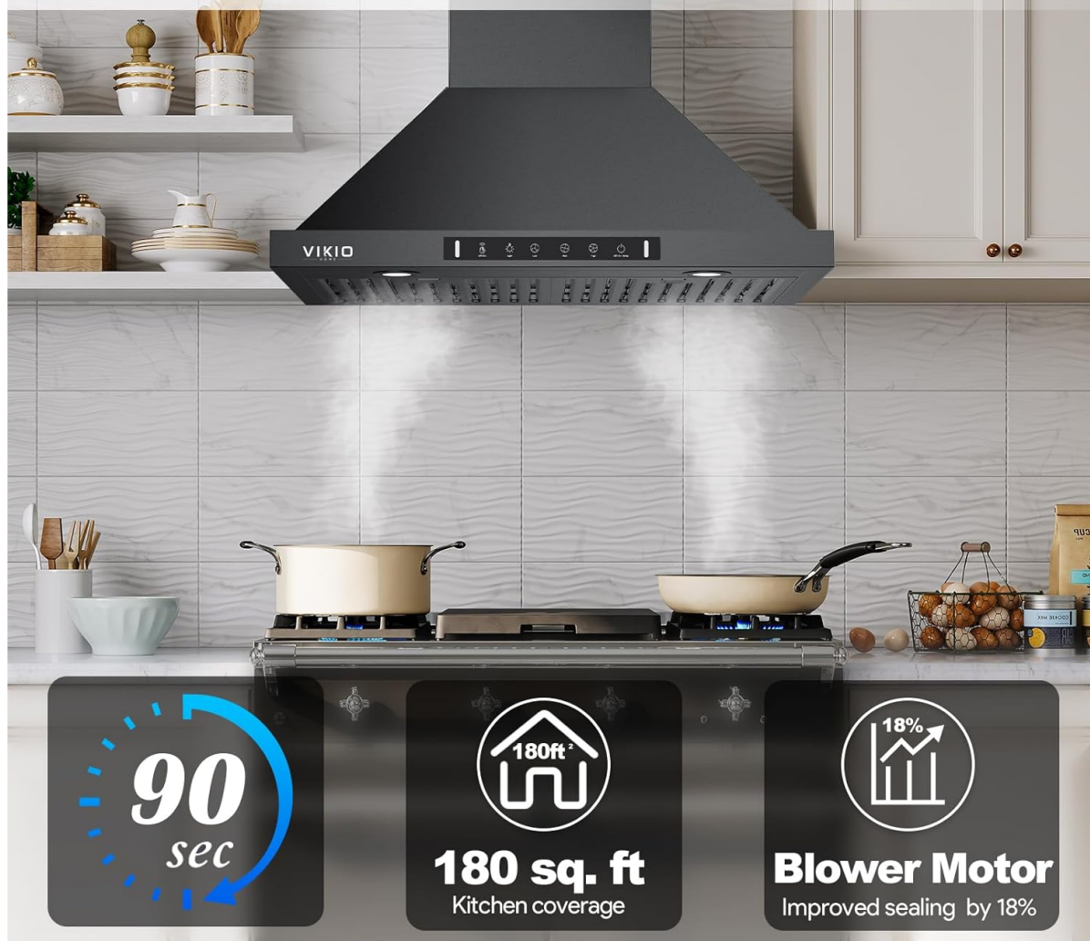
Figure 3.2: Illustration of the 980 CFM suction power, refreshing 180 sq. ft. of kitchen air every 90 seconds, with an 18% improved blower motor sealing.

980 CFM suction, refreshes 180 sq. ft. of kitchen air every 90 seconds.