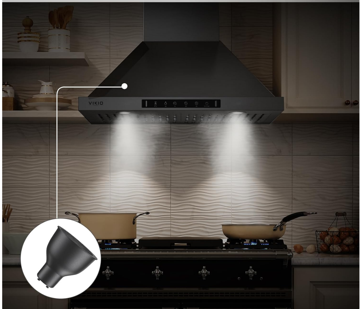
Figure 5.4: The 4500K LED lights provide bright and natural illumination for your cooking surface.

Enjoy clear, natural light that brings out the true colors of your ingredients. GU10 LED bulbs are easy to find and replace at your local hardware store.