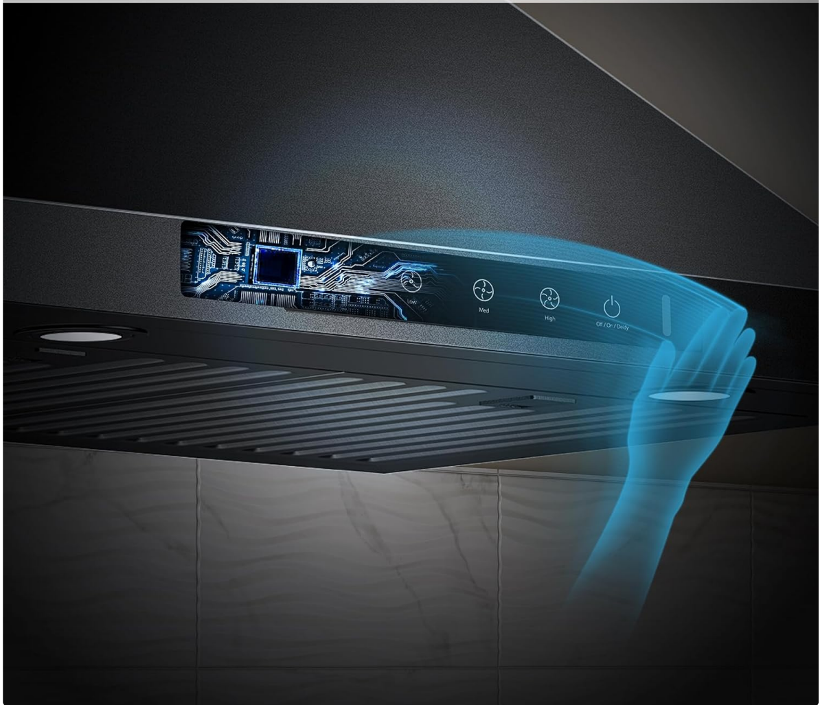
Figure 5.1: The 2.0 Next-Level Range Hood Control Panel, demonstrating gesture sensing capability.

25% better sensor accuracy, 99.5% detection rate per 1000 gestures. 3 speed levels for any cooking environment.