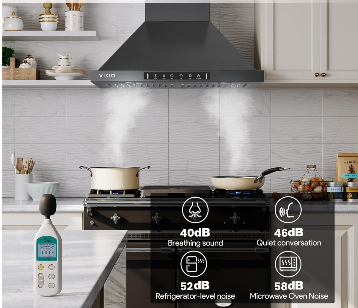
Figure 3.3: Noise level comparison, showing ultra-quiet comfort at lower speeds (40-64 dB range).

Experience ultra-quiet comfort on the first 2 speed settings, with even the highest setting quieter than a microwave