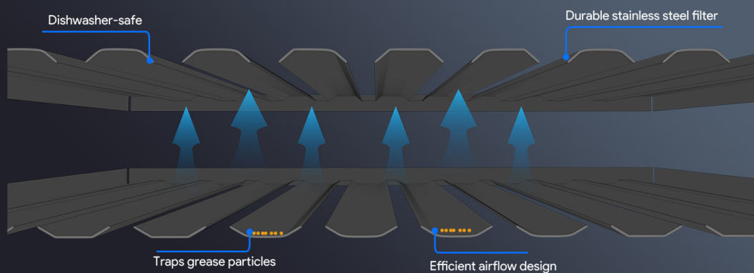
Figure 6.2: The durable stainless steel baffle filter design efficiently traps grease particles and ensures optimal airflow.

VIKIO Home stainless steel high-efficiency filter increases airflow by 10%, reduces grease buildup on the motor and impeller, and prevents suction loss due to clogs.