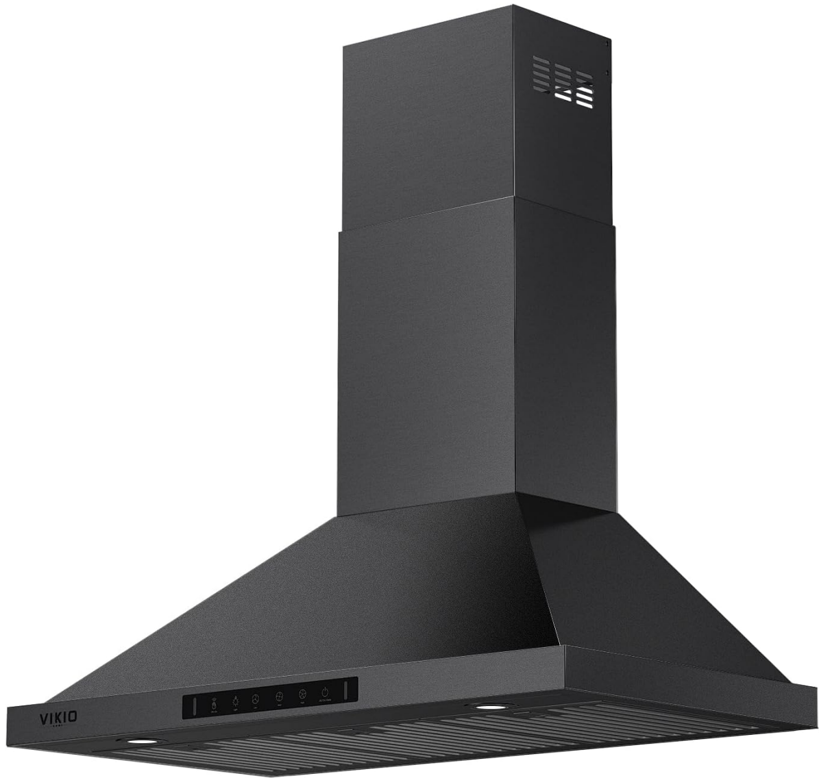
Figure 3.1: Front view of the VIKIO HOME 36-inch Kitchen Range Hood.