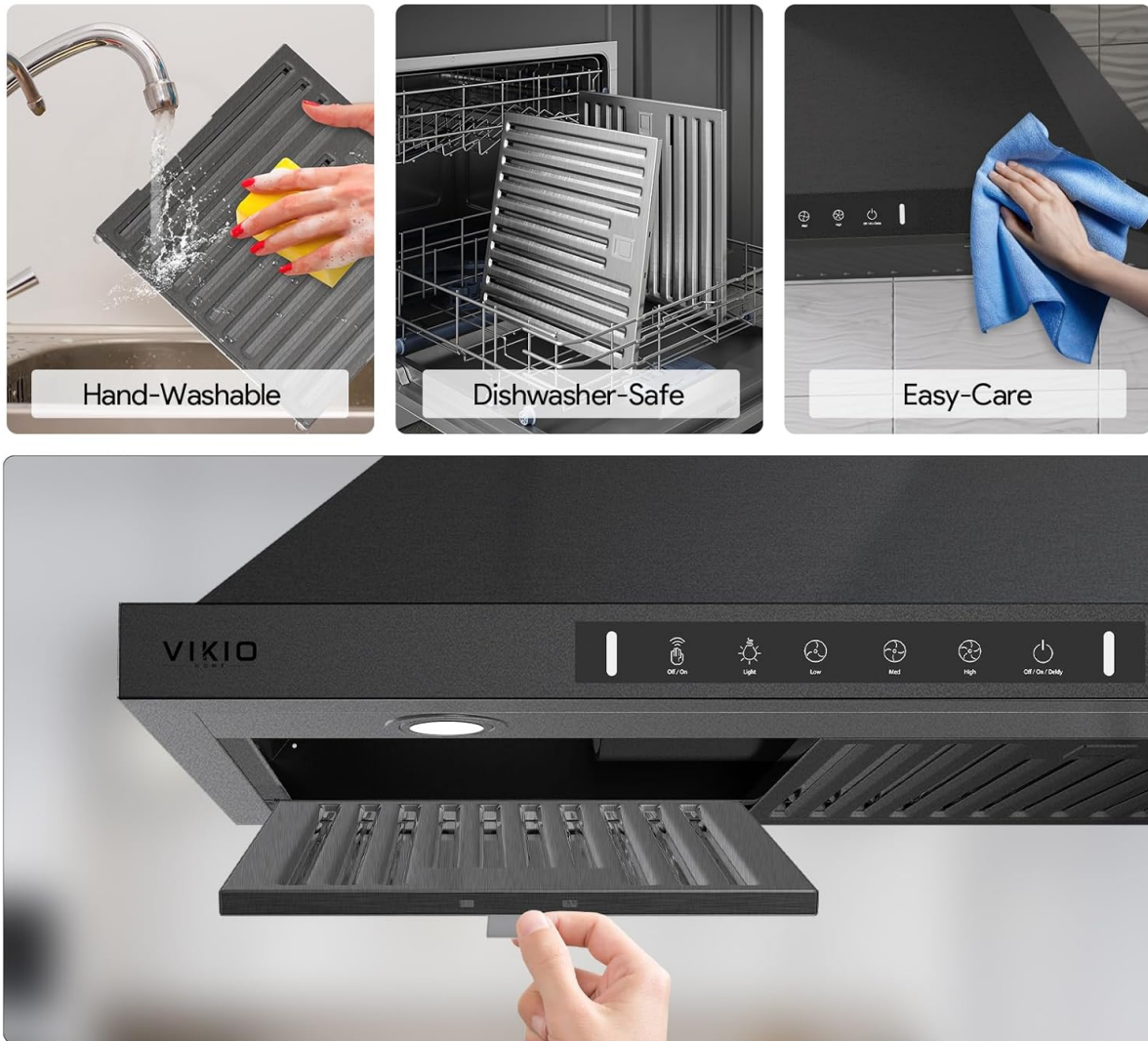
Figure 6.1: The quick detachable baffle filters are easy to clean by hand or in a dishwasher.