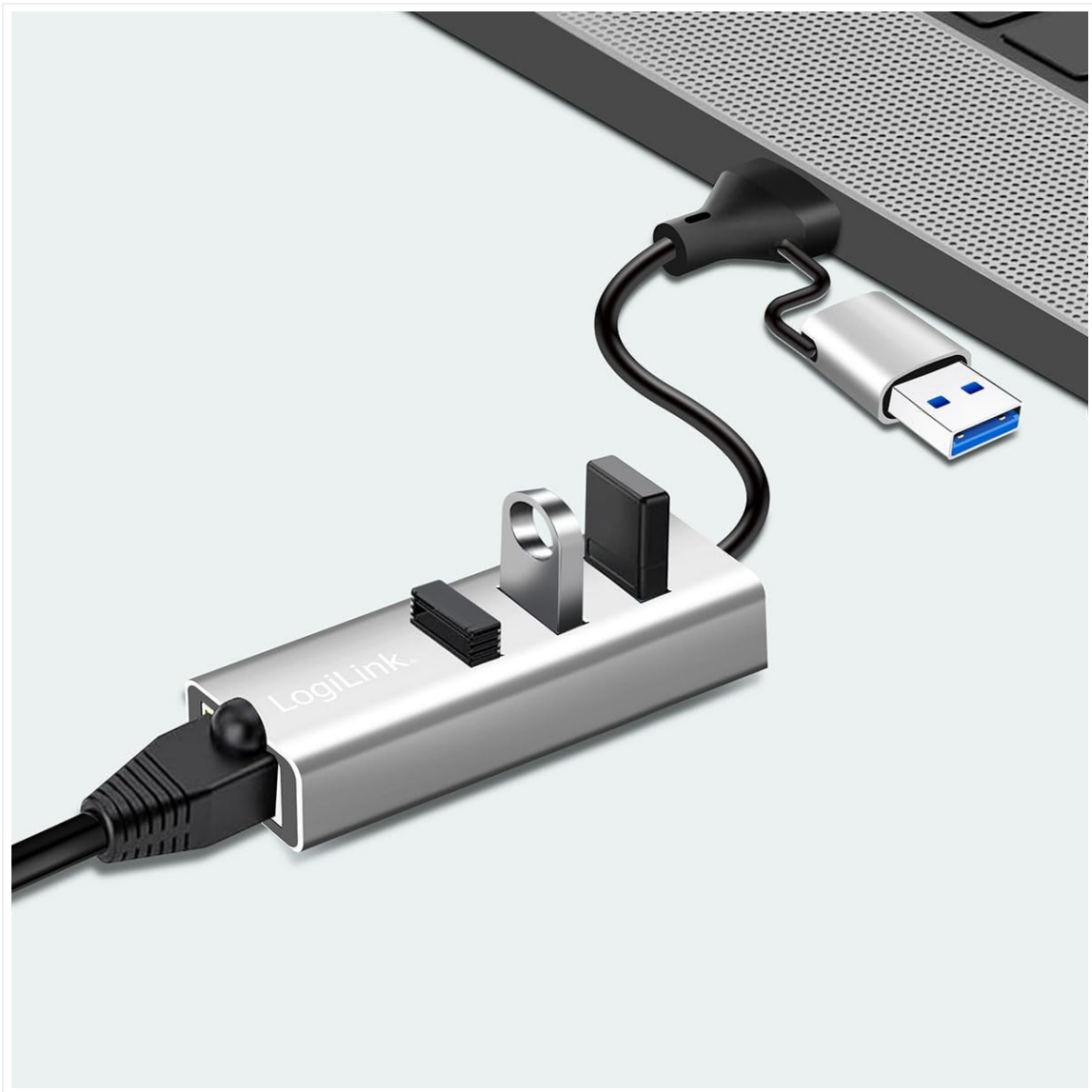
Figure 3: Hub connected to a laptop via USB-A. The image shows the hub's cable connected to a laptop's USB-A port, with the USB-C adapter cap removed and resting nearby.