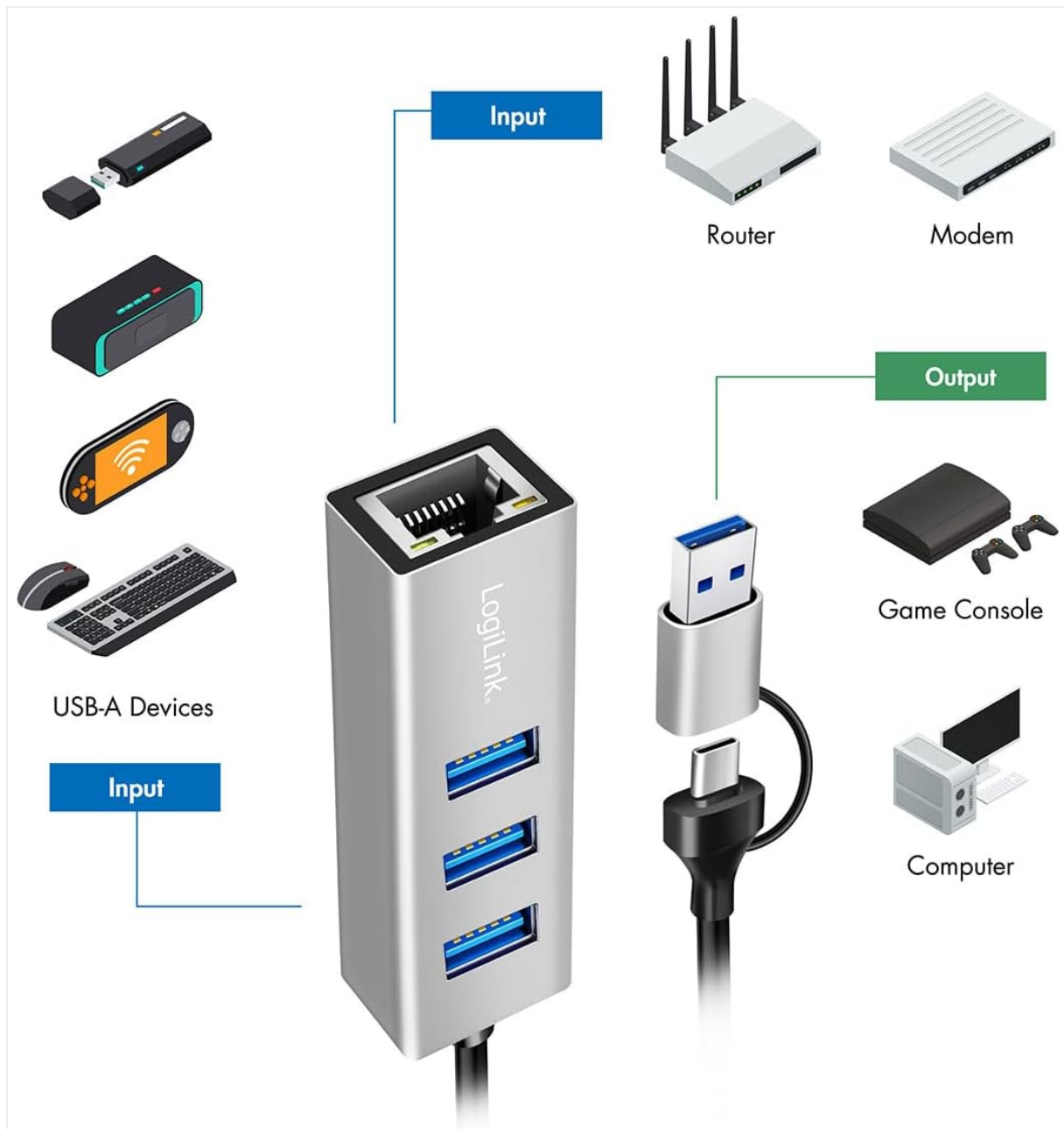
Figure 1: Input and Output Device Connectivity Diagram. This image illustrates various USB-A devices (like USB drives, speakers, game controllers, mouse, keyboard) as inputs, and the hub connecting to a router/modem for network output, and to a game console or computer via its 2-in-1 USB-C/USB-A cable.