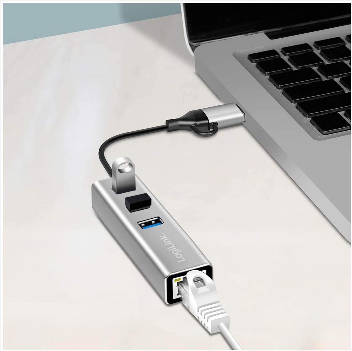
Figure 4: Hub connected to a laptop with an Ethernet cable. This image shows the LogiLink UA0440 hub connected to a laptop's USB-C port, with an Ethernet cable plugged into the RJ45 port on the hub.

Ensure your host device's network settings are configured to use the Ethernet adapter if it doesn't automatically switch from Wi-Fi.