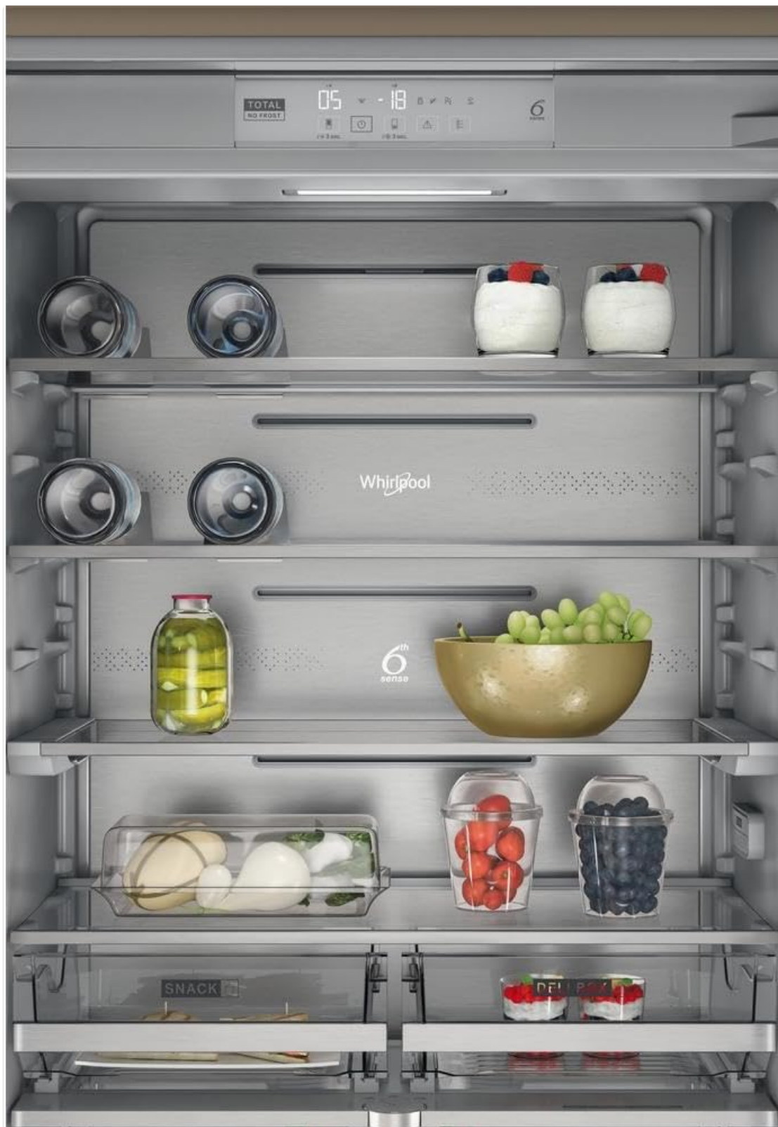
Figure 3.1: This image highlights the touch control panel located at the top of the refrigerator interior, displaying temperature settings and the Whirlpool 6th SENSE technology logo, along with upper shelves.