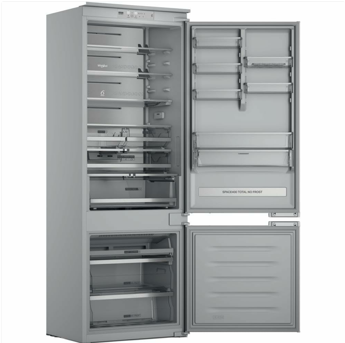
Figure 3.2: This image shows the Whirlpool WH SP70 T262 P built-in refrigerator with both the refrigerator and freezer doors open, displaying the internal layout, shelves, drawers, and door bins.