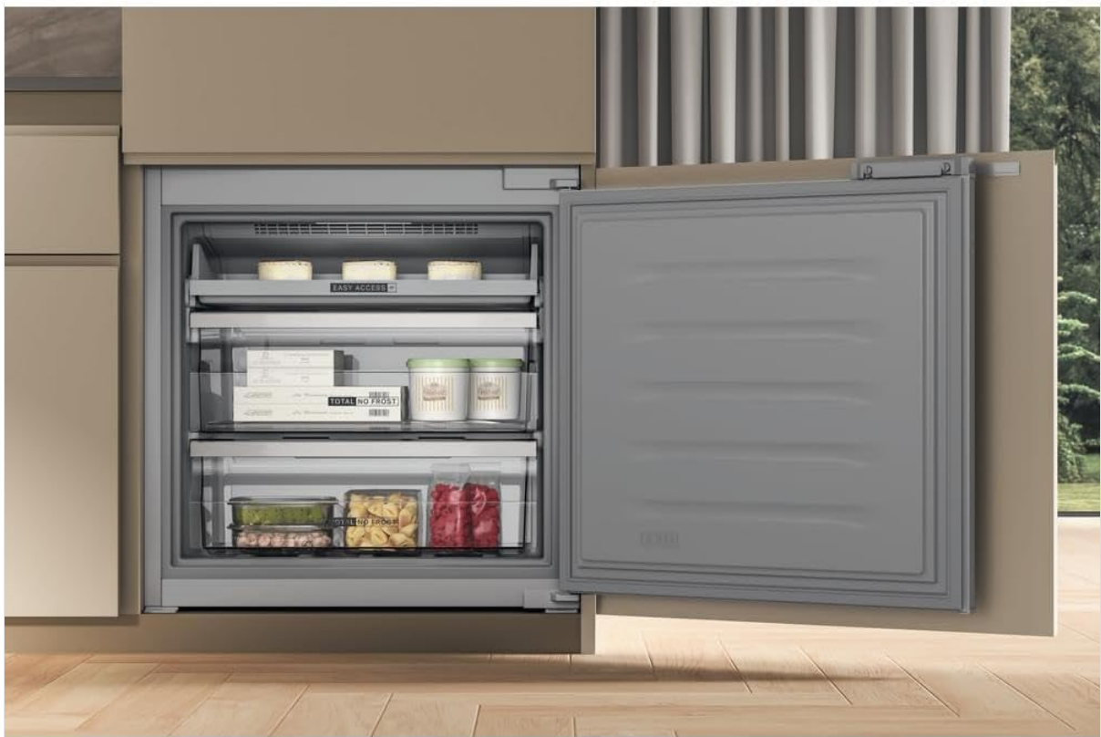
Figure 3.4: This image focuses on the freezer compartment, illustrating the pull-out drawers designed for organized storage of frozen goods, with 'TOTAL NO FROST' visible.