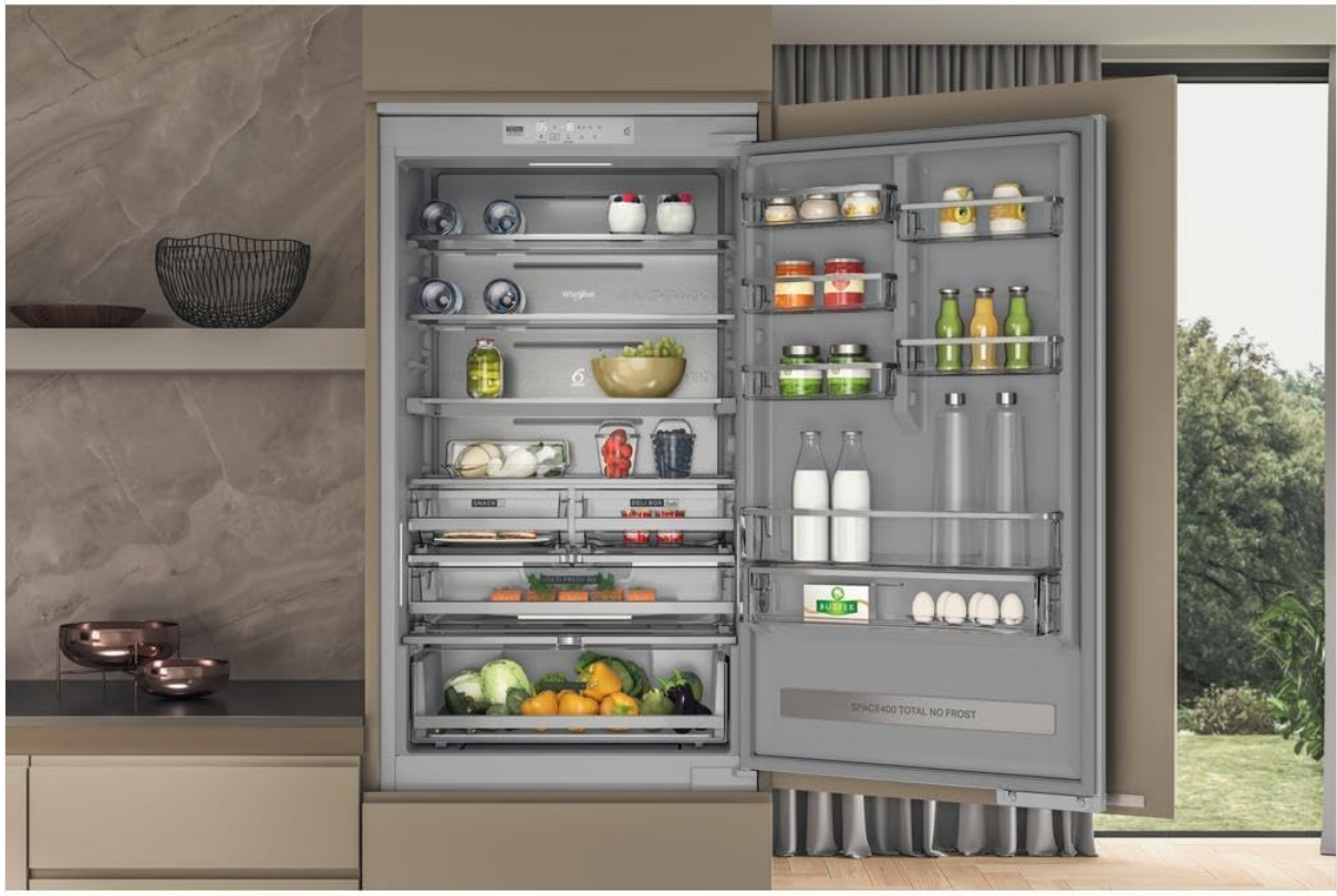
Figure 3.3: A detailed view of the upper refrigerator compartment, showcasing the adjustable glass shelves, door bins, and various food storage options, including the 6th SENSE sensor area.