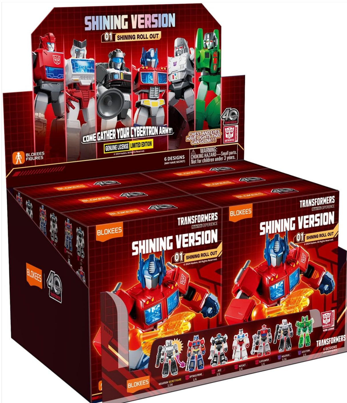
This image shows the retail display box for the BLOKEES Transformers Shining Version 01 collection, featuring several individual blind boxes and examples of the assembled figures.