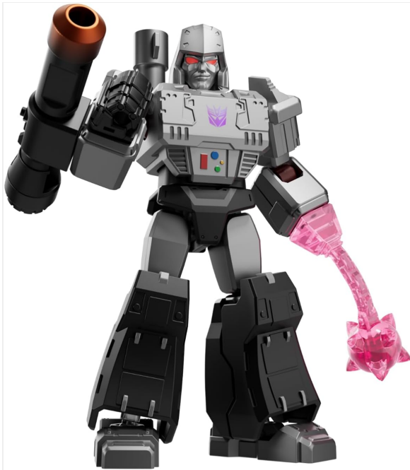
A detailed view of the assembled Megatron figure, showcasing its gray and black color scheme and weapon.