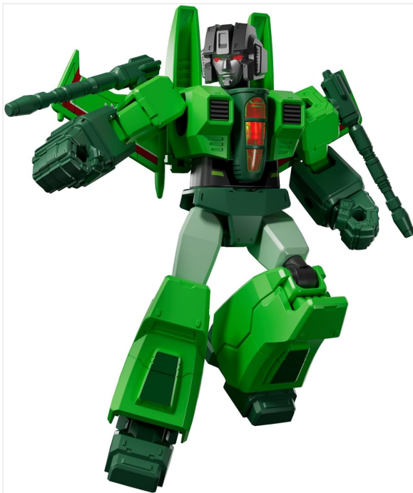
A detailed view of the assembled Acid Storm figure, characterized by its vibrant green color and jet-mode elements.