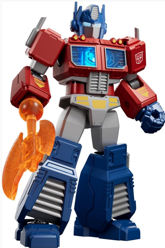
A detailed view of the assembled Optimus Prime figure, featuring its iconic red and blue design and translucent orange weapon.