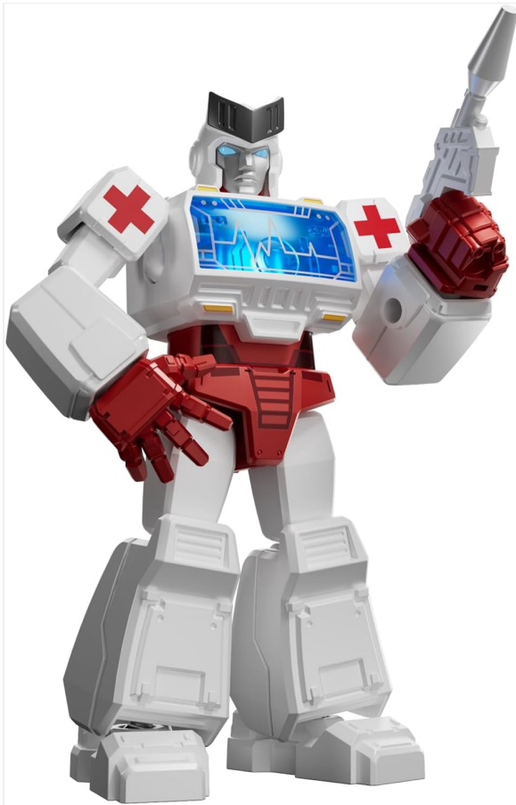
A detailed view of the assembled Ratchet figure, in its white and red medical vehicle inspired colors.