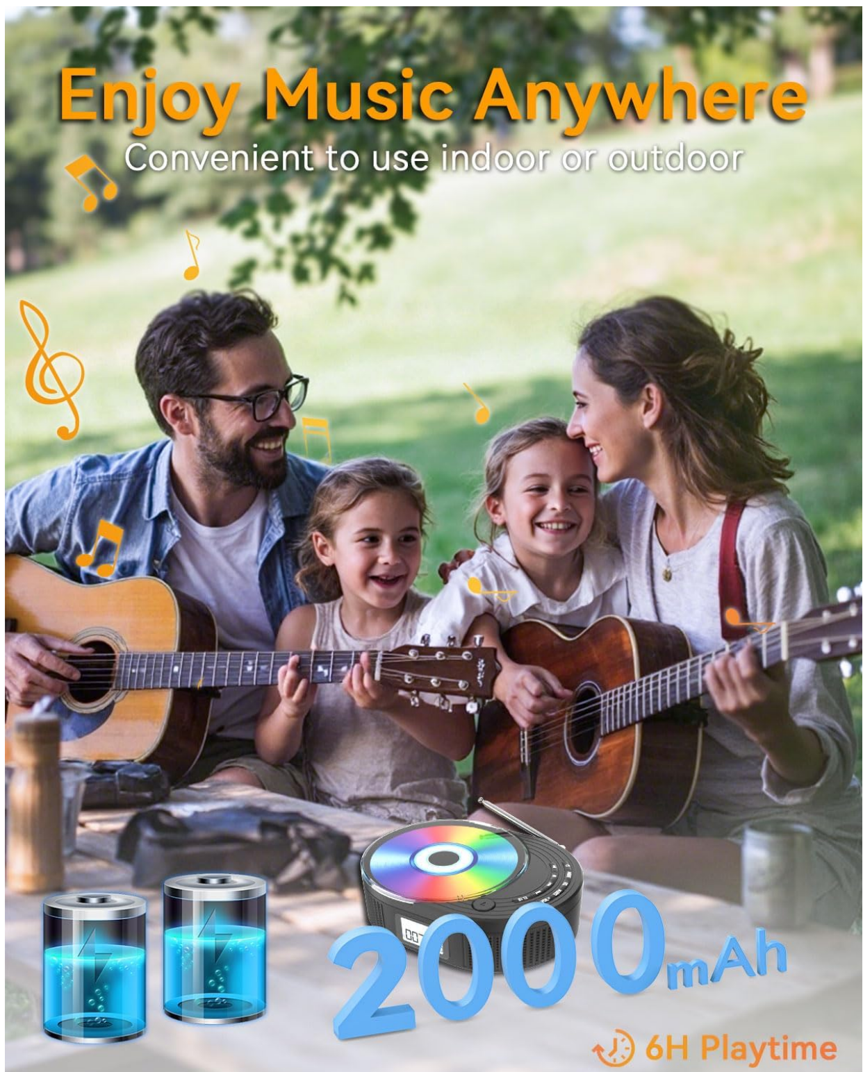
Image: The MD706 CD player highlighting its 2000mAh battery for portable use.