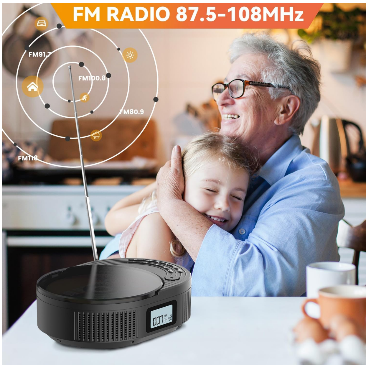
Image: The MD706 CD player in FM radio mode, with its antenna extended, indicating its use for listening to various broadcasts.