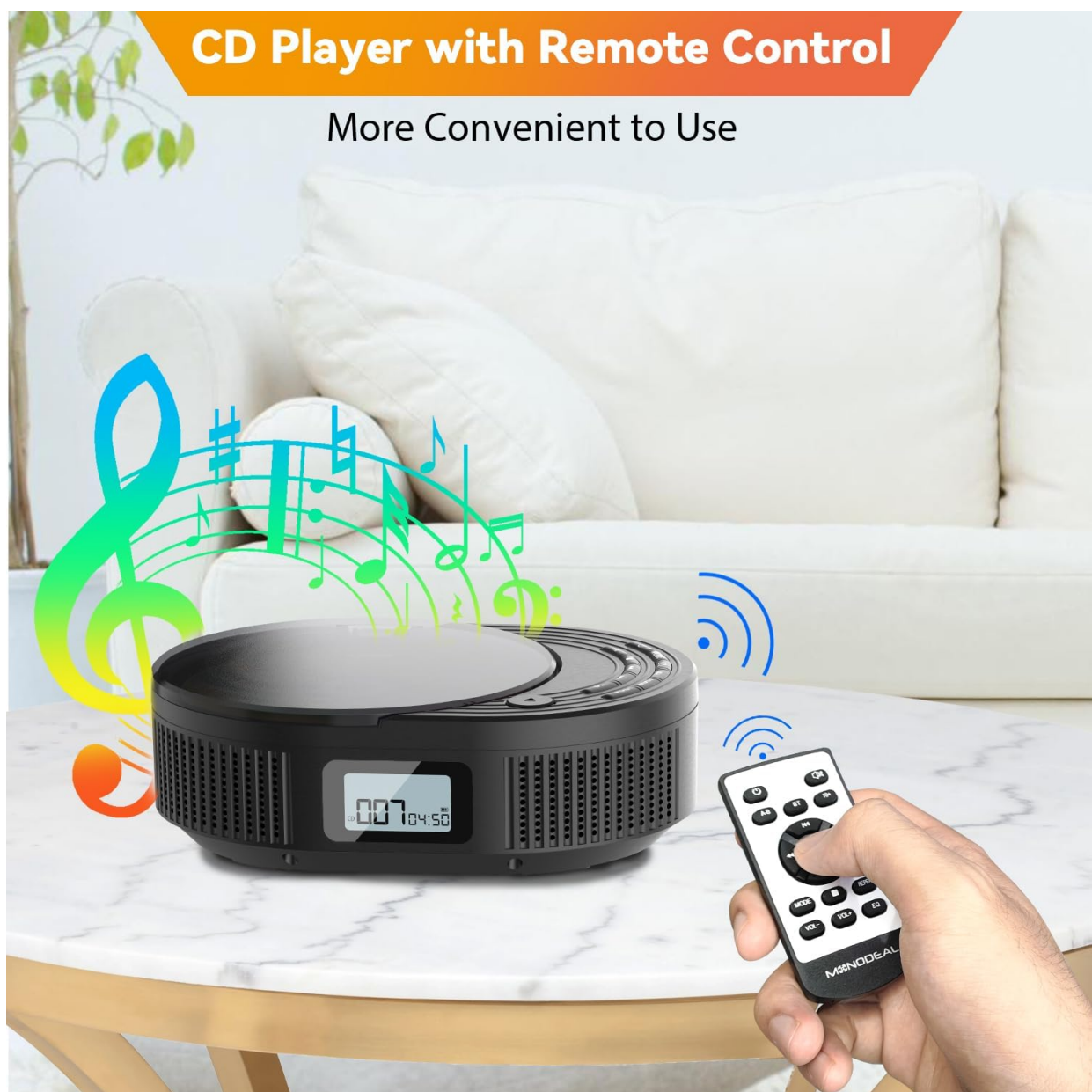
Image: The MD706 CD player being controlled by its remote, highlighting the convenience of remote operation.