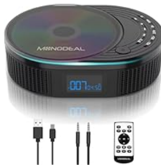
Image: The MD706 CD player shown with its Type-C charging cable, AUX cable, and remote control.

Carefully remove all components from the packaging. Ensure you have the MD706 CD player, Type-C charging cable, AUX cable, remote control, and this instruction manual.