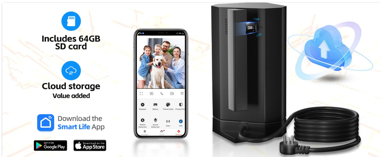
Image: Visual representation of the included 64GB SD card, cloud storage option, and the Smart Life App interface for managing the camera.