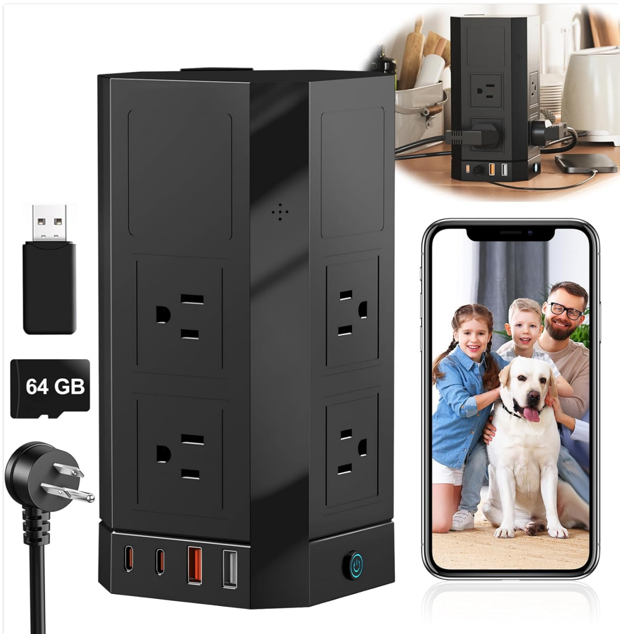
Image: Main unit of the TBCR WiFi Camera Power Strip, showing its hexagonal design, AC outlets, USB ports, and the included 64GB Micro SD card and power plug.