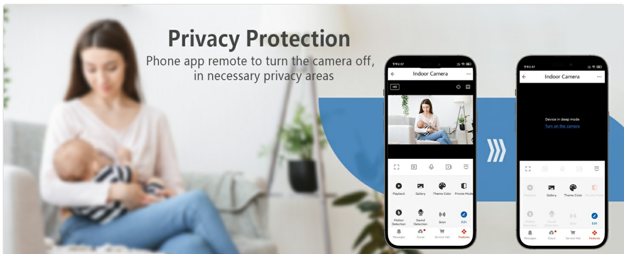
Image: A smartphone displaying the camera app interface, showing the option to activate 'Private Mode' to turn off the camera for privacy.