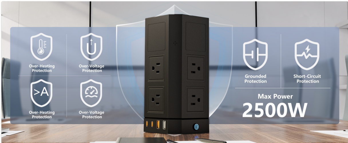
Image: Icons illustrating the comprehensive safety features of the power strip, including over-heating, over-voltage, grounded, and short-circuit protection, with a maximum power rating of 2500W.