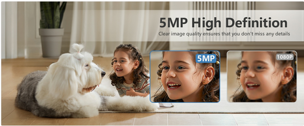
Image: A visual comparison demonstrating the superior clarity of 5MP high-definition video compared to 1080P, highlighting the camera's ability to capture fine details.