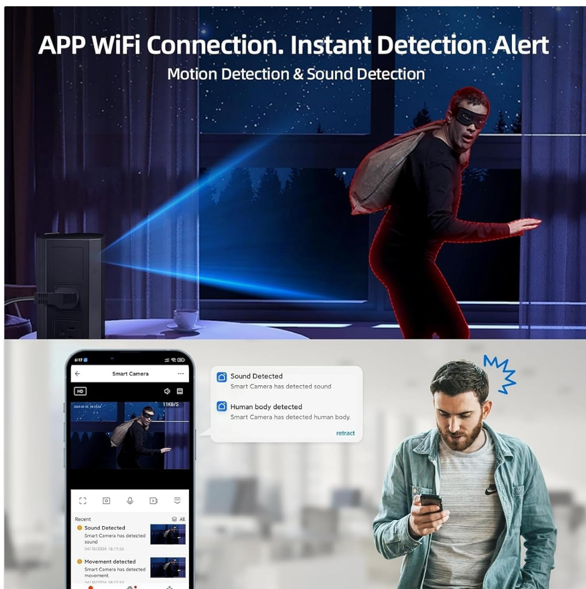
Image: A smartphone screen showing notifications for sound and human body detection from the smart camera, indicating