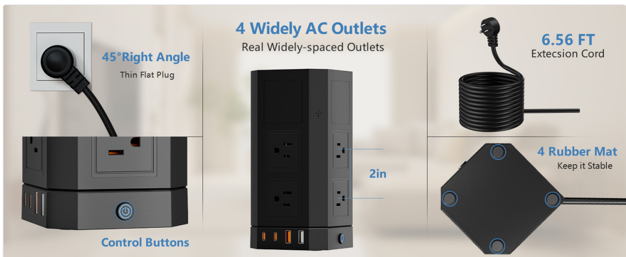
Image: Detailed view of the power strip's features, including four widely spaced AC outlets, a 6.56-foot extension cord, control buttons, and a rubber mat for stability.