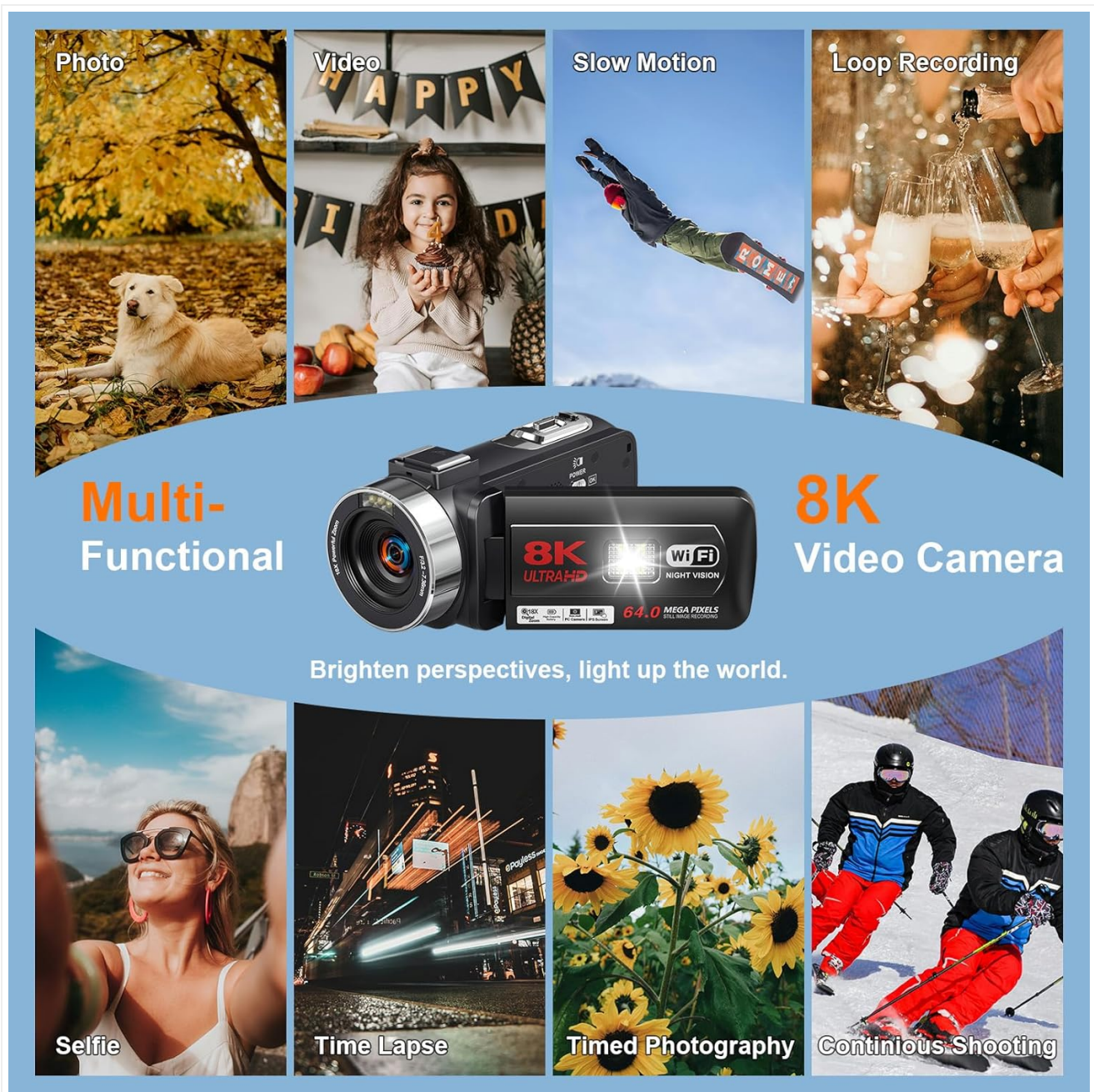
Image: Overview of the camcorder's multi-functional capabilities.