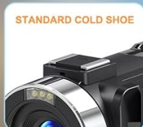
STANDARD COLD SHOE