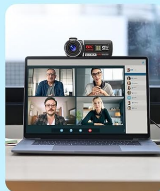
Image: Wi-Fi connection process and other connectivity options.