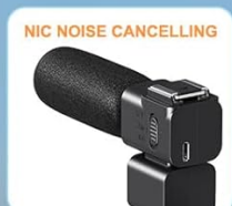
NIC NOISE CANCELLING