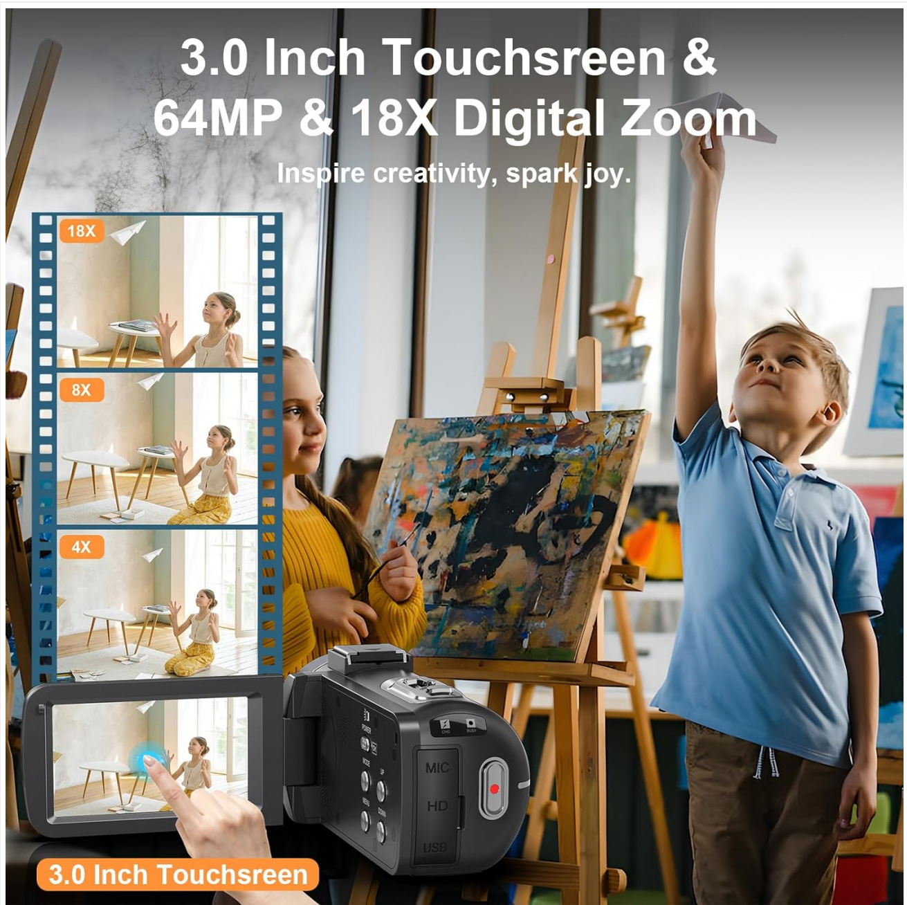
Image: Visual representation of the 18X digital zoom feature.