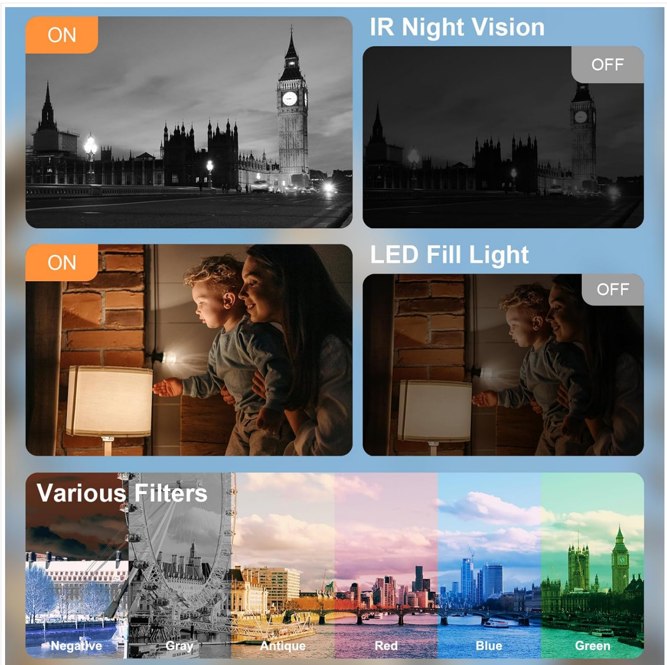
Image: Demonstrations of IR Night Vision, LED Fill Light, and creative filters.