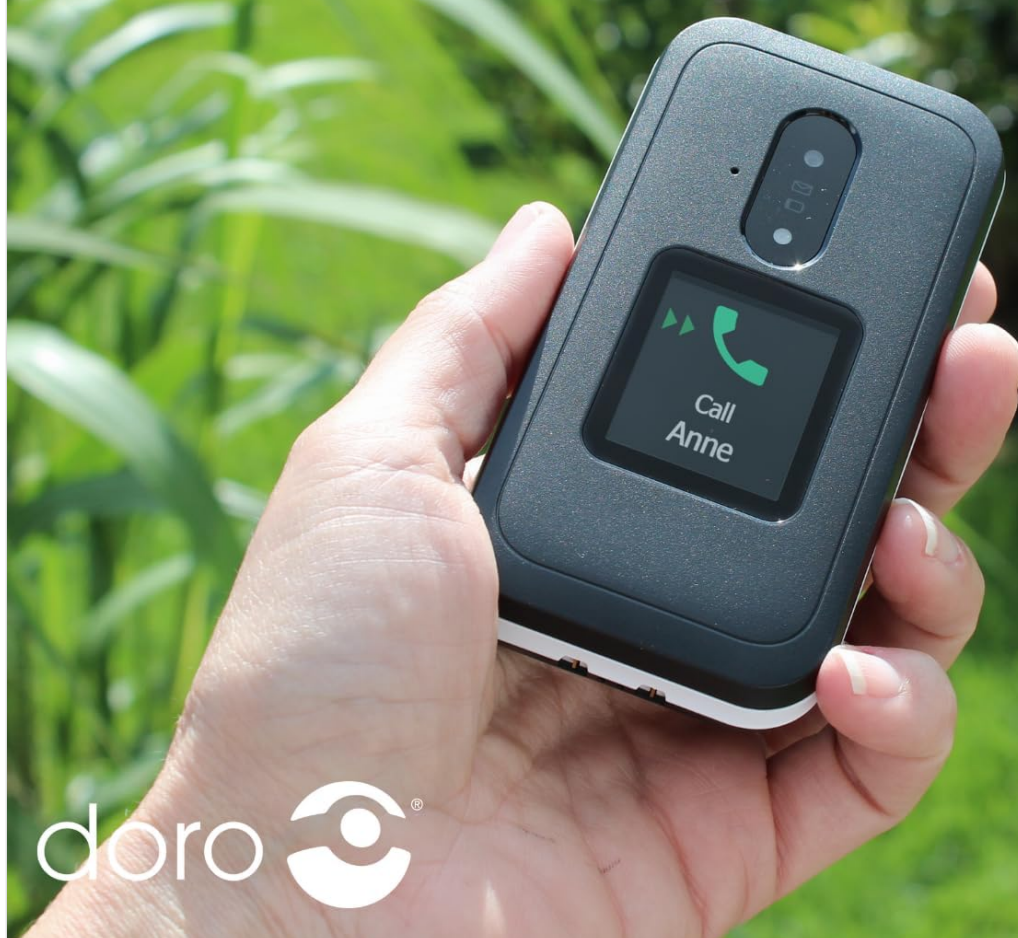
Image: A hand holding the DORO Leva E30, illustrating how to answer and end calls with a simple flip motion. The external screen shows an incoming call from "Anne".

Neem op en hang op met een simpele klapbeweging.