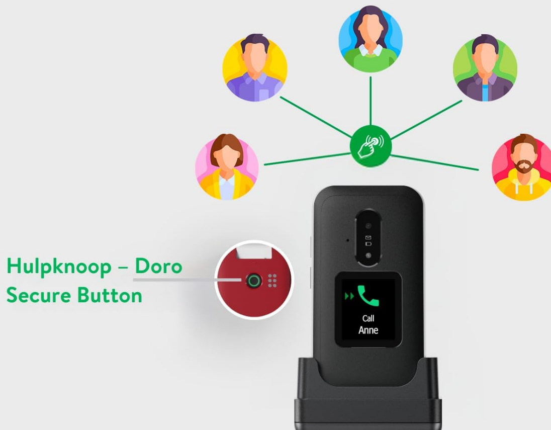
Image: The DORO Leva E30, emphasizing its ergonomic design and the prominent Doro Secure button. The image also illustrates how the phone's well-spaced, high-contrast keys and large screen facilitate easy calling, texting, and photo-taking, and mentions the included charging station.

Bel, sms en maak foto's eenvoudig dankzij de goed gespreide en hoogcontrasterende toetsen, en het grote scherm . Dankzij het meegeleverde oplaadstation weet je altijd waar je telefoon is.