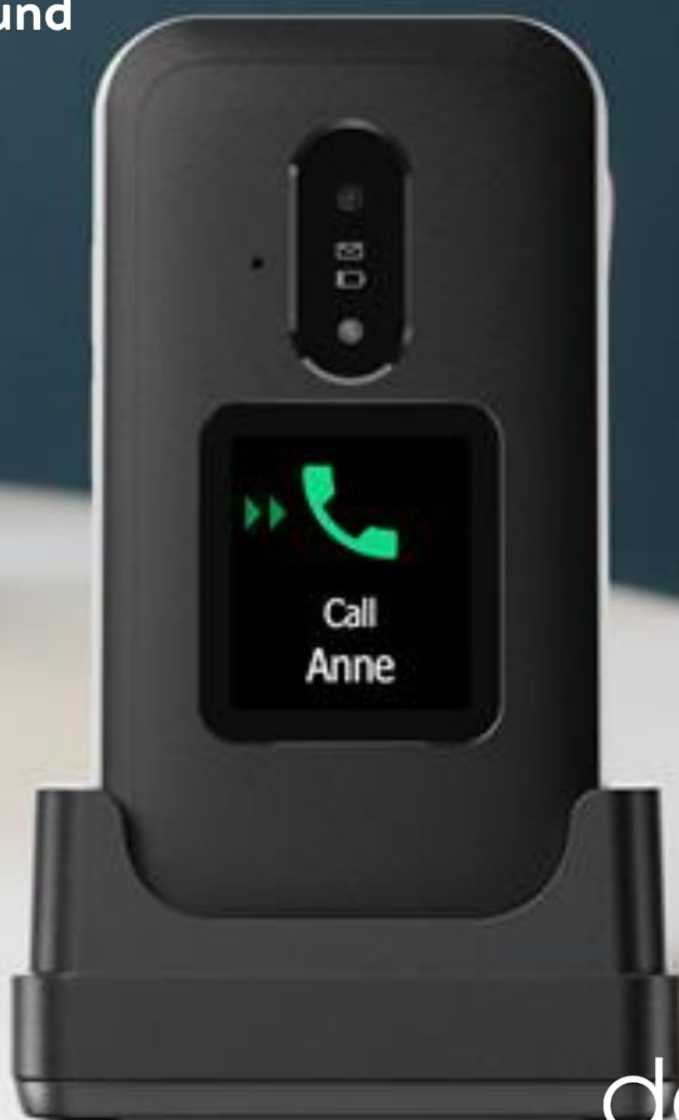
Image: The DORO Leva E30 phone resting in its charging cradle, demonstrating how to charge the device. The image also mentions "Hear better with Doro ClearSound".