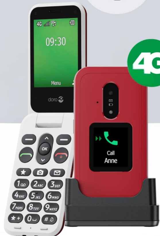
Image: The DORO Leva E30 4G Flip Phone highlighting its simple, user-friendly design, dual screen, Doro Secure button, clear sound, hearing aid compatibility, large keys with voice feedback, and three speed dial keys.