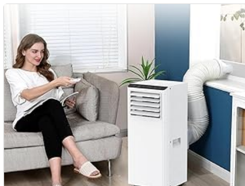
Figure 7: Remote control for convenient operation.