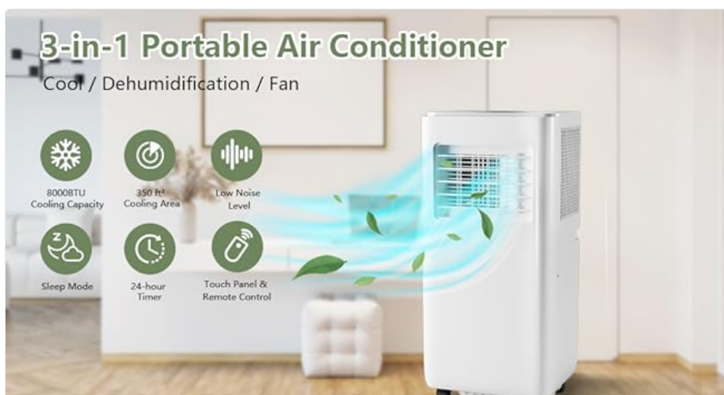
Figure 5: Illustration of the three operating modes.