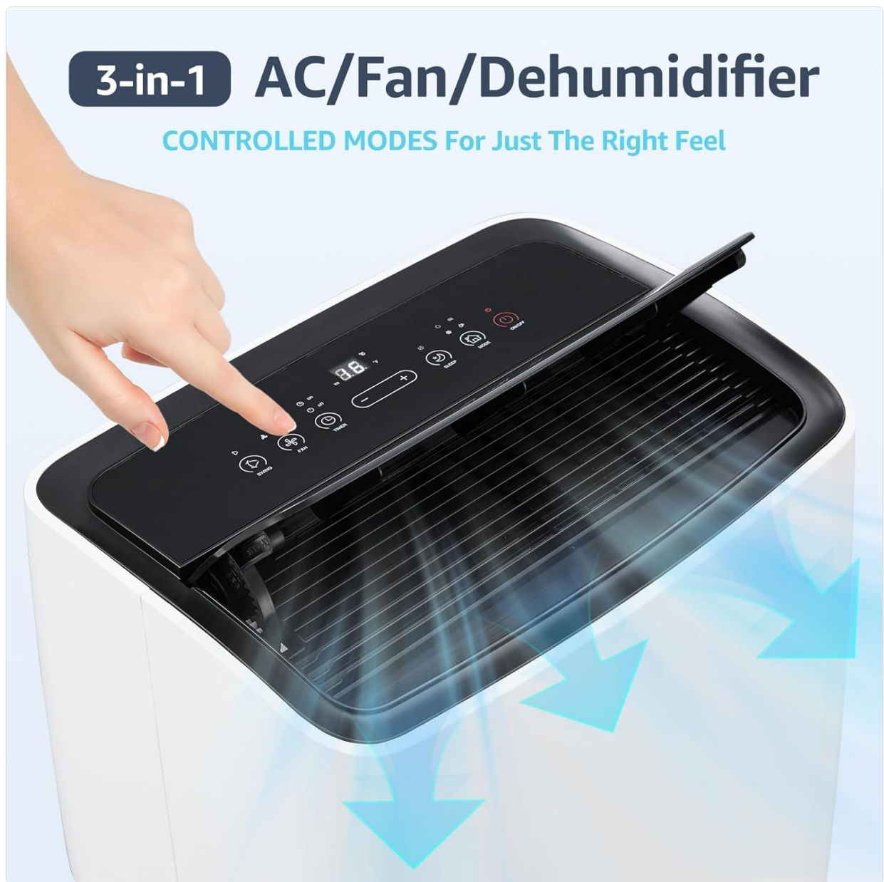
Figure 4: Control panel showing 3-in-1 functions.