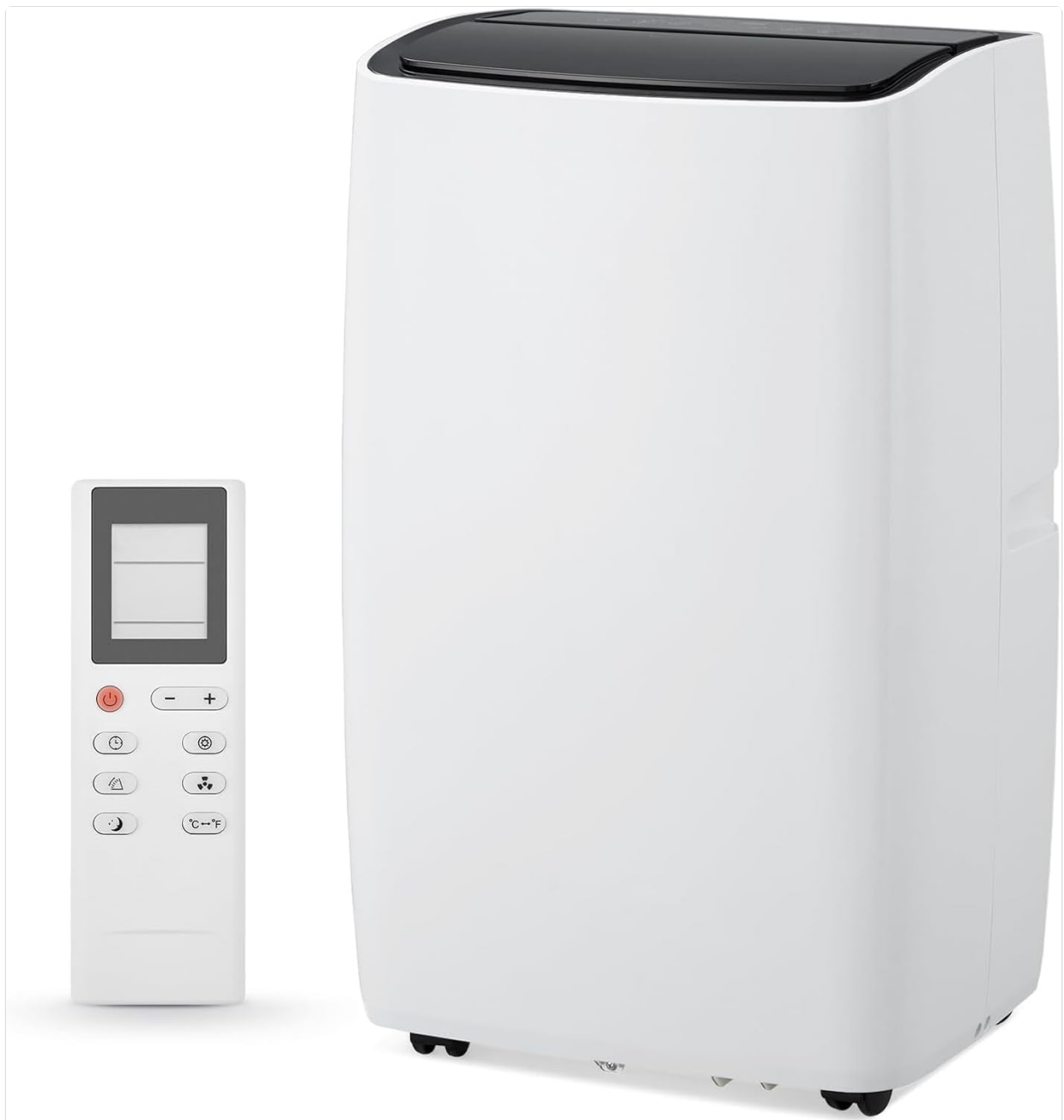
Figure 1: GAOMON 12000 BTU Portable Air Conditioner and Remote Control.