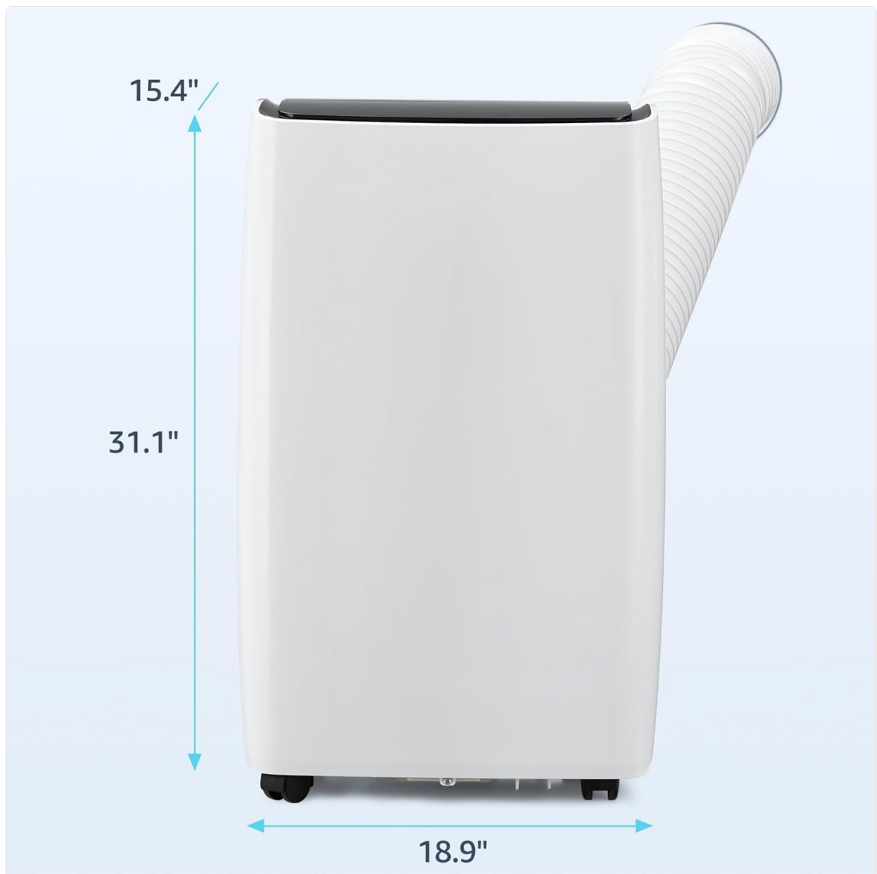
Figure 8: Product dimensions.