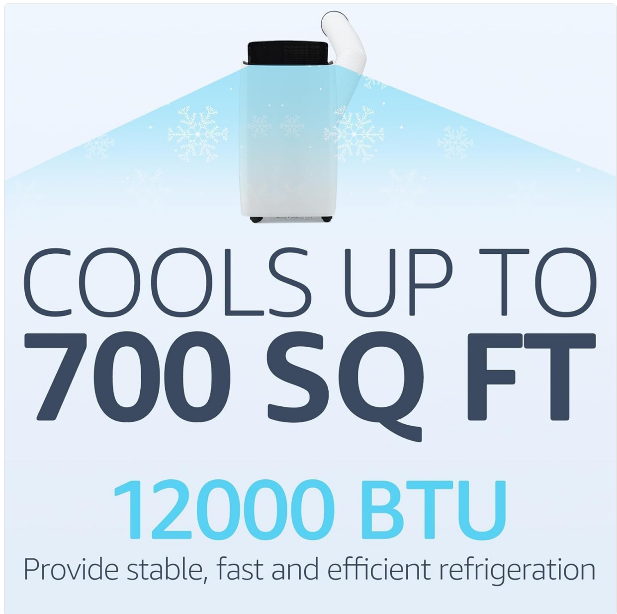
Figure 2: Cooling capacity of the 12000 BTU unit.