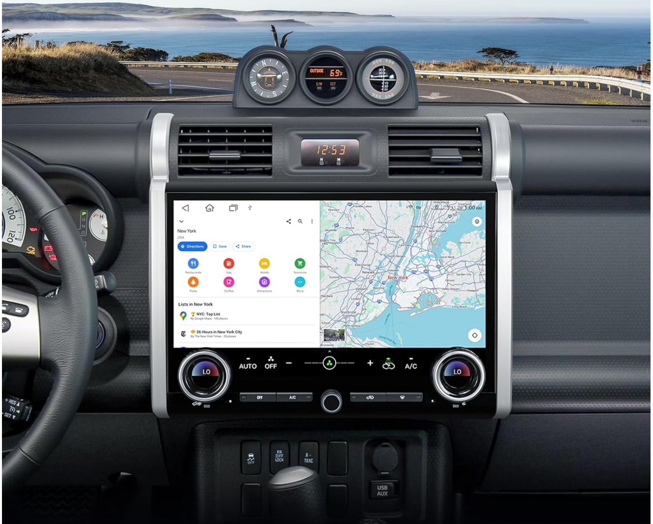
Image 4.1: GPS Navigation interface on the AINAVI Car Stereo Radio.

The best companion on the journey. Built-in GPS module, and support map software in the Google Play application market