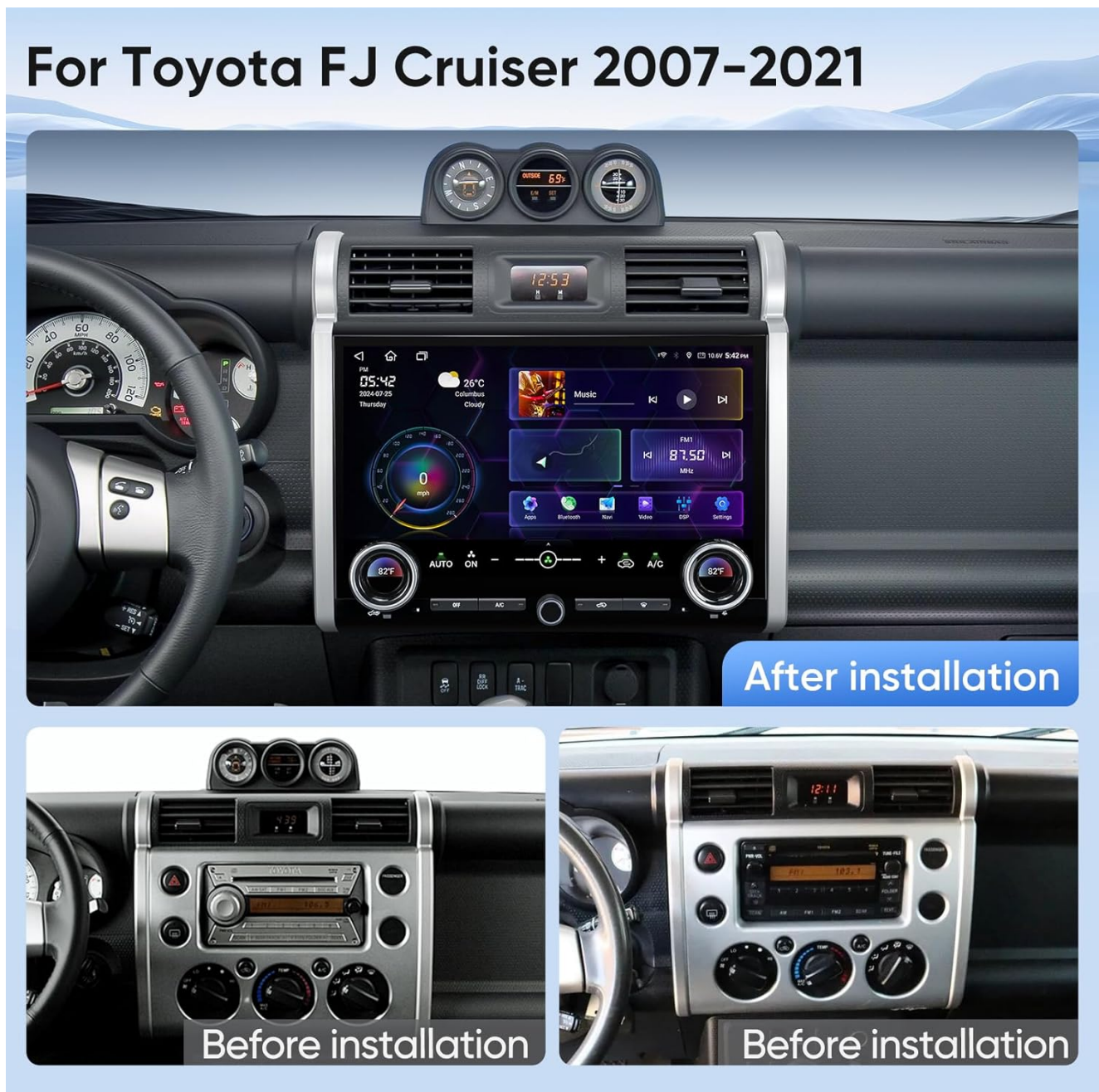
Image 3.1: Visual comparison of the dashboard before and after installing the AINAVI Car Stereo Radio.

Professional installation is recommended for this product. Ensure the vehicle's battery is disconnected before starting any electrical work. Refer to the provided wiring diagrams and follow these general steps.