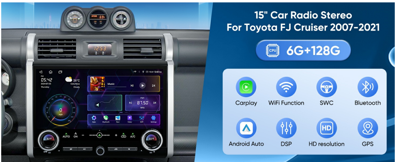
Image 1.1: Overview of the AINAVI Car Stereo Radio's key features.

This manual provides detailed instructions for the installation, operation, and maintenance of your AINAVI 15-inch Android 13 Car Stereo Radio, designed specifically for Toyota FJ Cruiser models from 2007 to 2021. This unit integrates advanced features such as wireless CarPlay, Android Auto, GPS navigation, and a high-resolution QLED touch screen to enhance your driving experience.