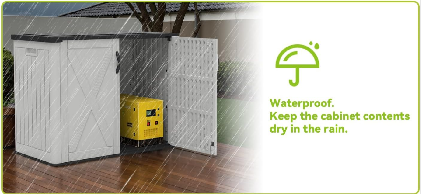
Figure 3.5: The cabinet offers UV protection to keep contents cool and is waterproof to keep them dry.

Waterproof. Keep the cabinet contents dry in the rain.