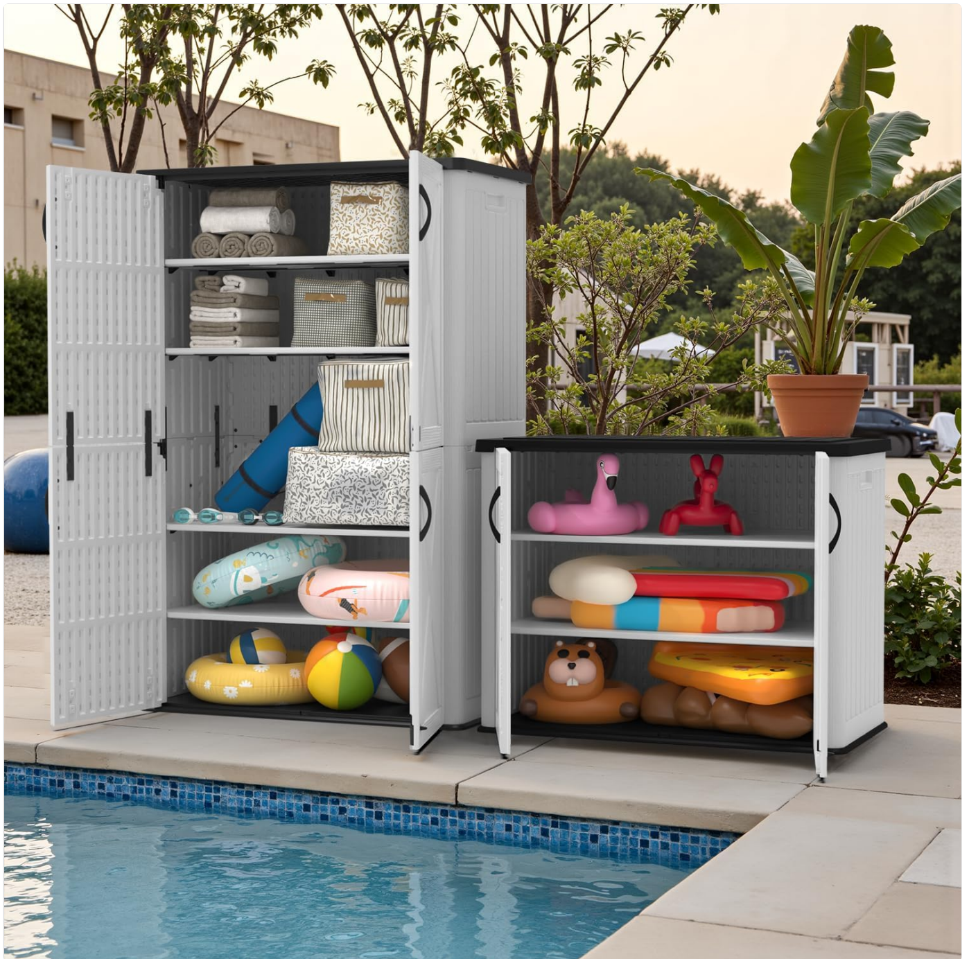
Figure 3.2: The storage cabinet with doors open, demonstrating its spacious interior for various items.