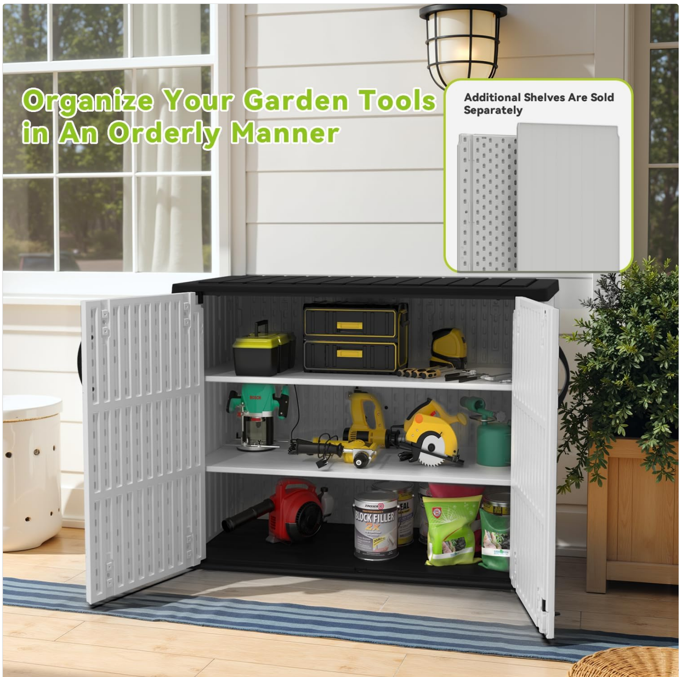
Figure 3.3: Example of organizing garden tools within the cabinet. Note: Shelves are sold separately.