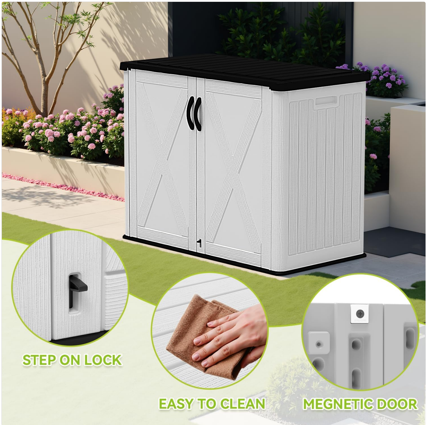
Figure 3.4: Key features including the step-on lock, easy-to-clean surface, and magnetic door latch.