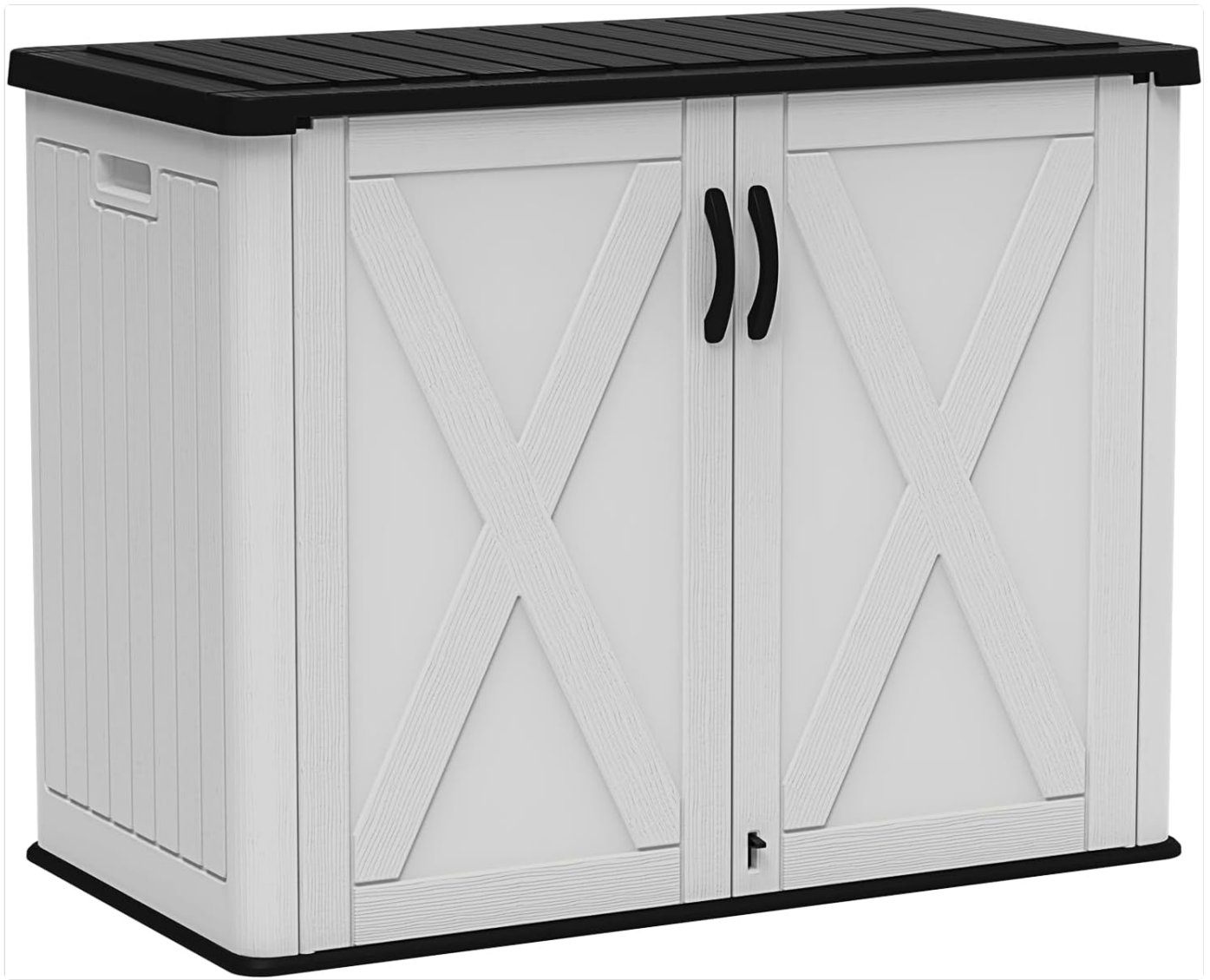
Figure 3.1: Front view of the Devoko 26 Cu Ft Outdoor Storage Cabinet.