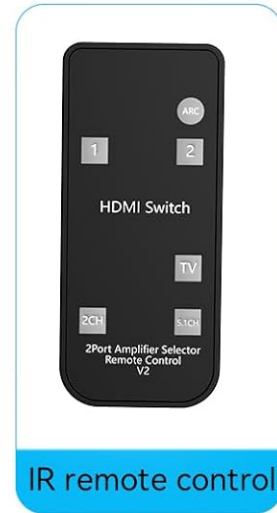
IR remote control