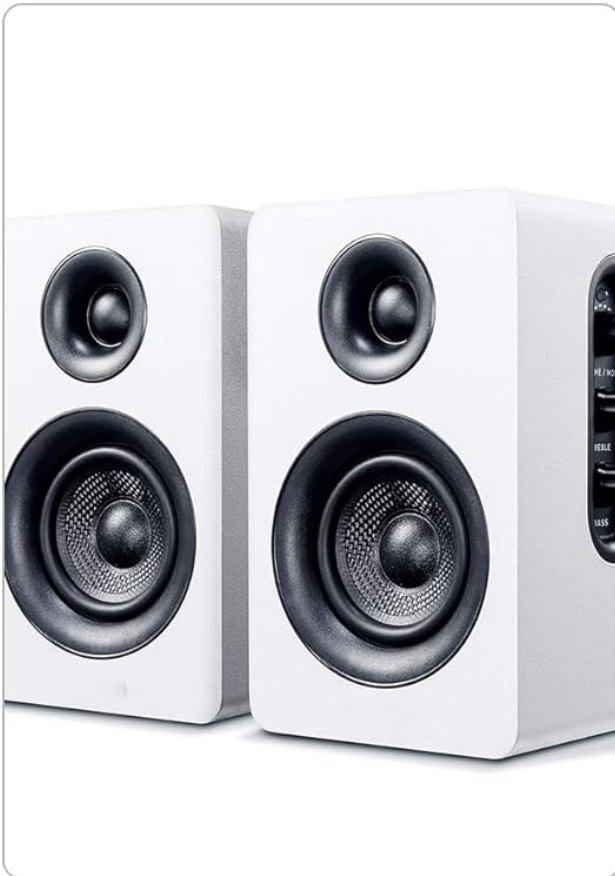
Audio Out: for 2.0L/R audio