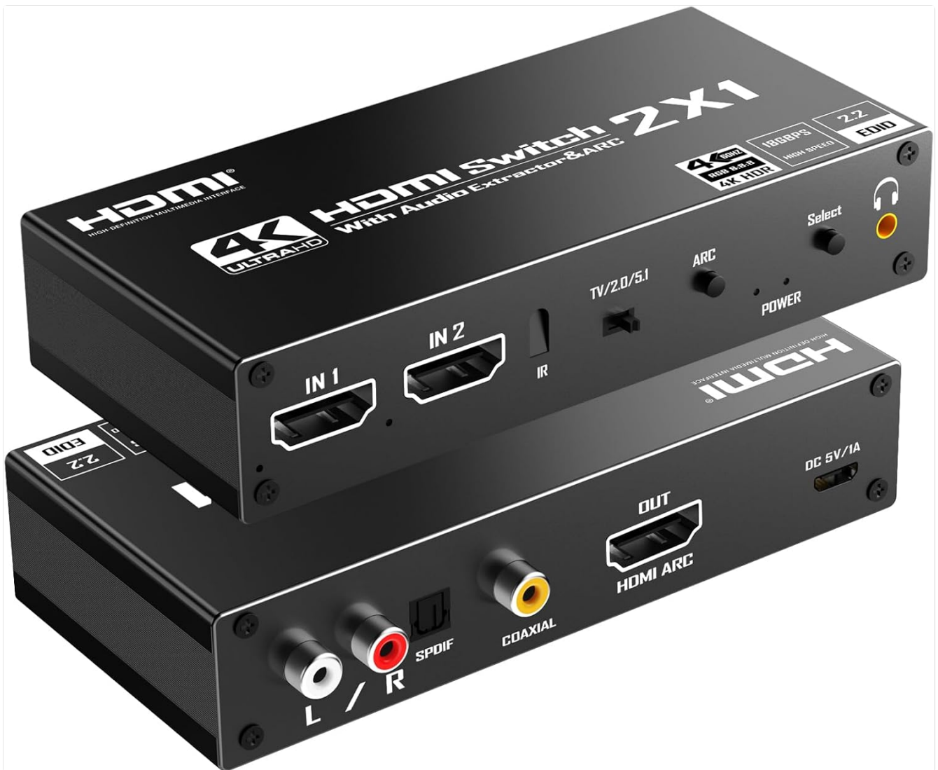
Image 1.1: Front and rear view of the PERESAL HDMI Switch with Audio Extractor.