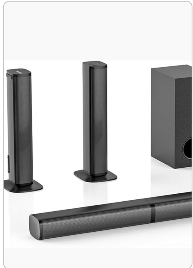
Optical/Coaxial Out: 5.1 Ch Home Audio System