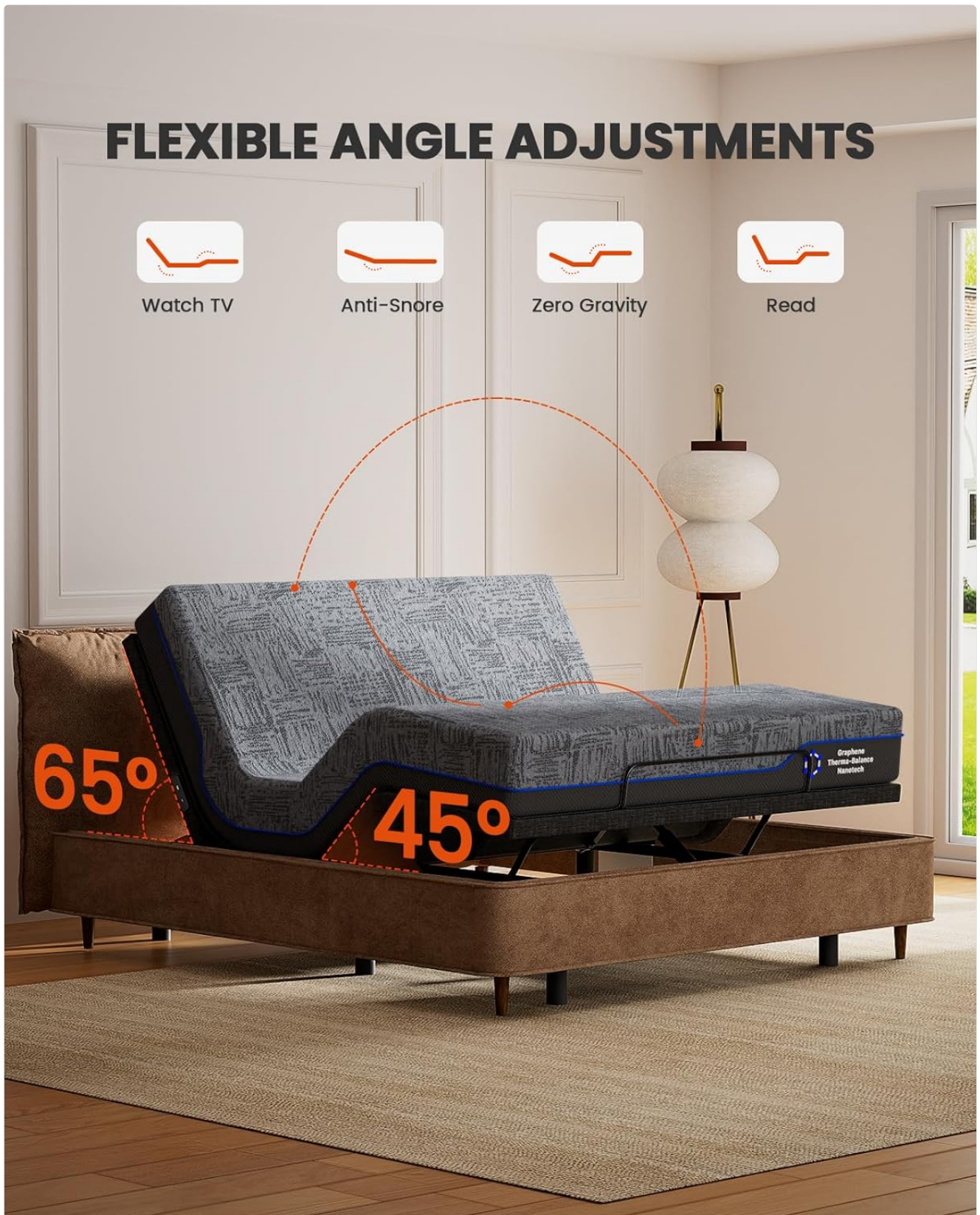
Image: Main components of the adjustable bed frame.